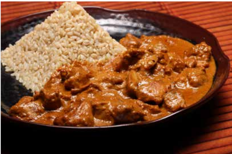
Tikka Masala, a classic red Indian curry with a creamy and rich base. Accented with flavors of cumin, turmeric, and coriander. One of the restaurant's most popular.