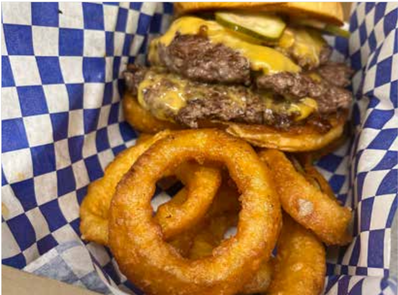
Charli's SmashBurger with cheese and onion rings.