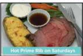
Hot Prime Rib on Saturdays

Dining Indoor & Patio • Bakery Open Daily