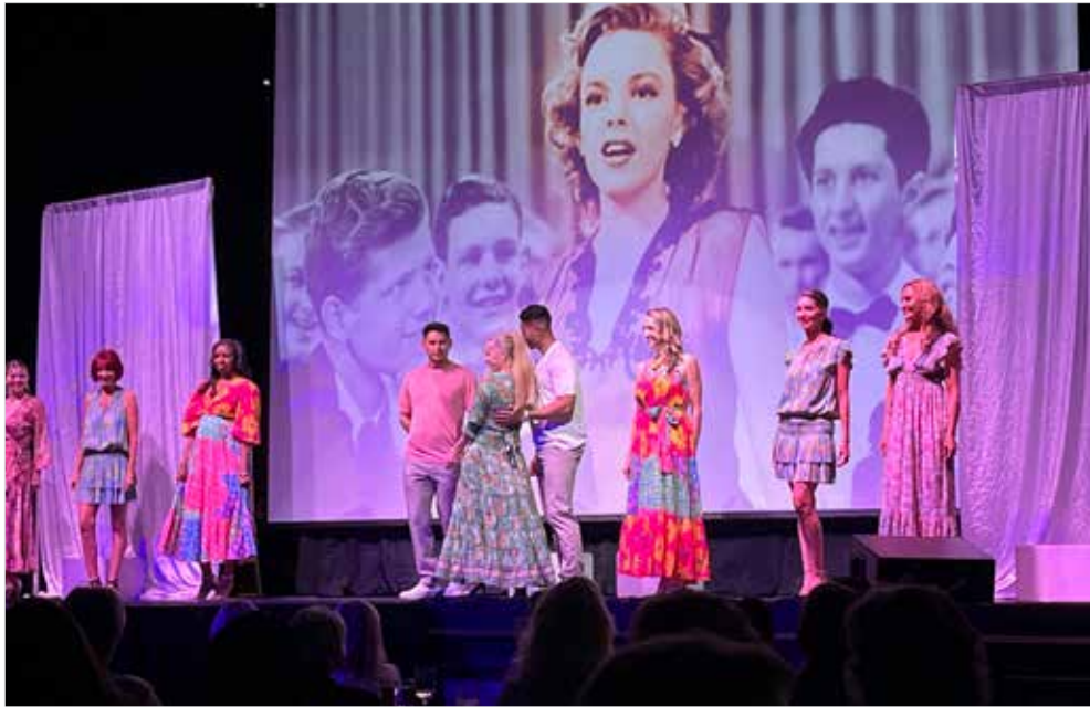
Opening number of the fashion show.

© 2024 Berkshire Hathaway HomeServices California Properties is a member of the franchise system of BHH Affiliates LLC. BHH and the BHH symbol are registered service marks of Columbia Insurance Company, a Berkshire Hathaway affiliate.