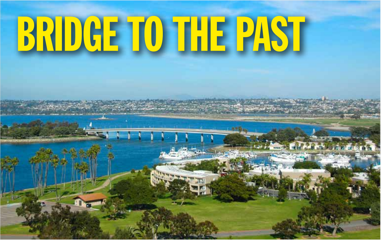
The south section of the Inghram Street bridge over the Mission Bay Channel to Vacation Isle.