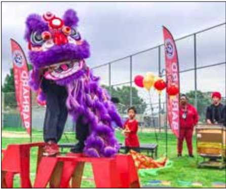
Barnard students celebrate SEE PAGE 8