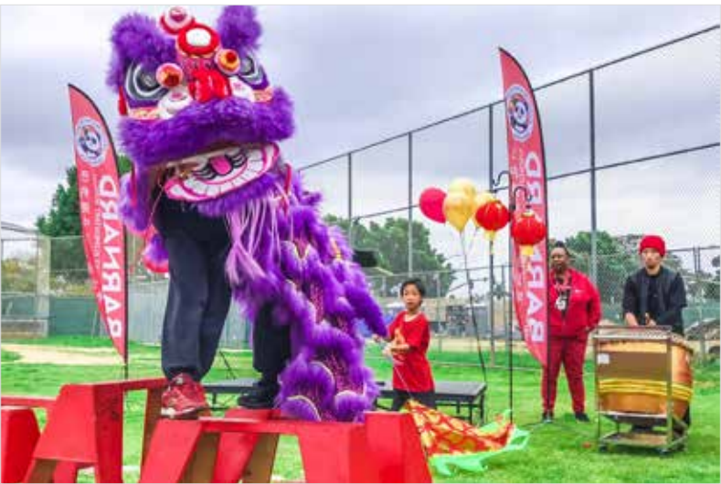
Barnard Mandarin Magnet Elementary School students performed a lion dance before the ground-breaking of the modernization project.