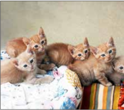
Kitten season begins SEE PAGE 7