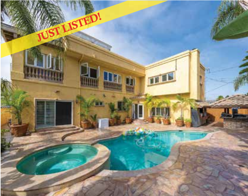
PACIFIC BEACH, CROWN PT Here's the glamorous beach & bay gathering space you seek! Revel in panoramic bay views from the rooftop patio & thoughtful design w/full kitchens & dual primary suites on each floor, pool, jacuzzi & outdoor kitchen. Solar powered for savings; beautified for curb appeal. 7 BD | 5.5 BA | 4,337 SF | $3,298,000