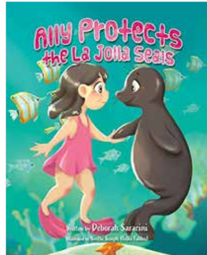
The cover of the book 'Ally Protects the La Jolla Seals.'