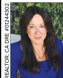
REALTOR, CA DRE #01244302