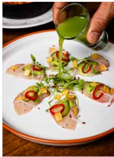
Aldea's menu embraces a wide range of seafood-centric dishes including aguachile, and bone-in rib eye steak.