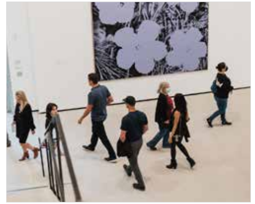
Visitors check out the galleries at the Museum of Contemporary Art La Jolla.

As cultural custodians, MCASD, which also has a downtown location at 1001 Kettner Blvd., recognizes the evolving role of museums in today's communities. The museum's commitment extends beyond preserving artworks. It encompasses fostering inclusive spaces where diverse audiences can engage