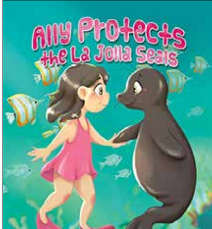
La Jolla author writes children's book SEE PAGE 16