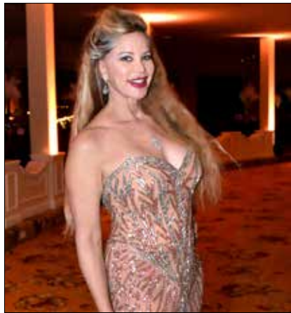
The Social Diary: Charity Ball celebrates 115 SEE PAGE 16