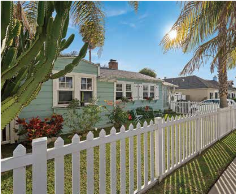
LA JOLLA, WINDANSEA Income Earning! Enjoy homelife in your quaint cottage with old world charm and generous green space. Earn rents from the nice-size unit in back, and more from any of five one-car garages, on a block that ends at the beach, west of La Jolla Boulevard. 3 BD | 1 BA || 2 BD | 2BA || 1,954 SF | 6,406 LOT SF | $2,798,000