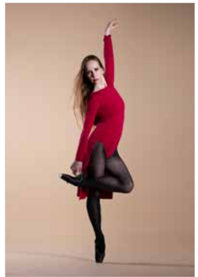
City Ballet of San Diego to present 'Boléro – The Awakening' in March.