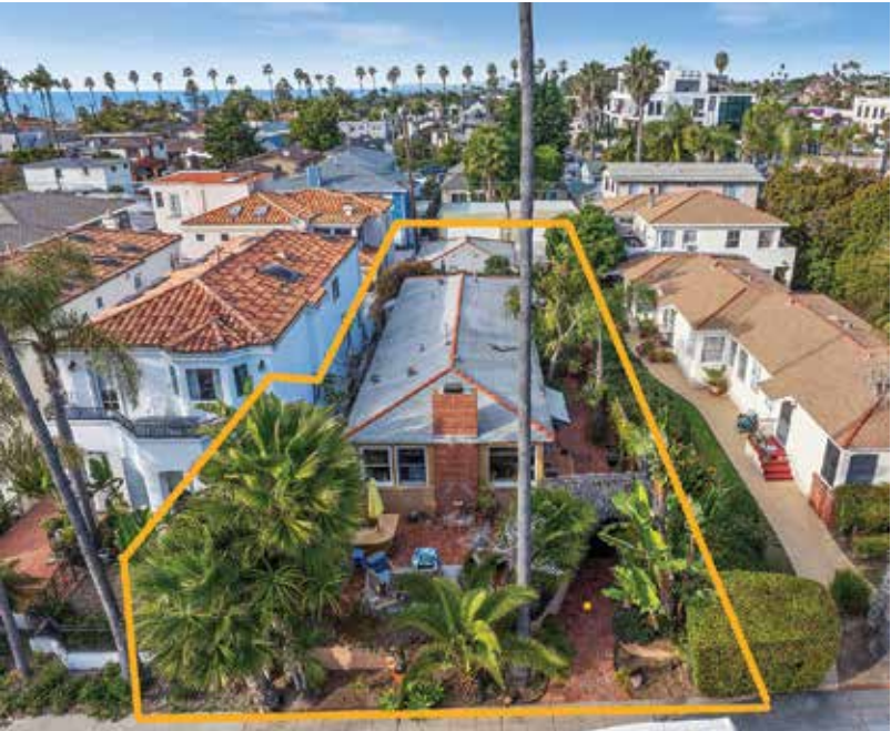
LA JOLLA, WINDANSEA Income Earning! Envisioning the quintessential beach bungalow, private and quaint, with defined income to offset costs? Here it is. A duplex, within a block of the beach, west of La Jolla boulevard, in highly sought WindanSea. 2 BD | 1 BA || 1 BD | 1BA | $2,398,000