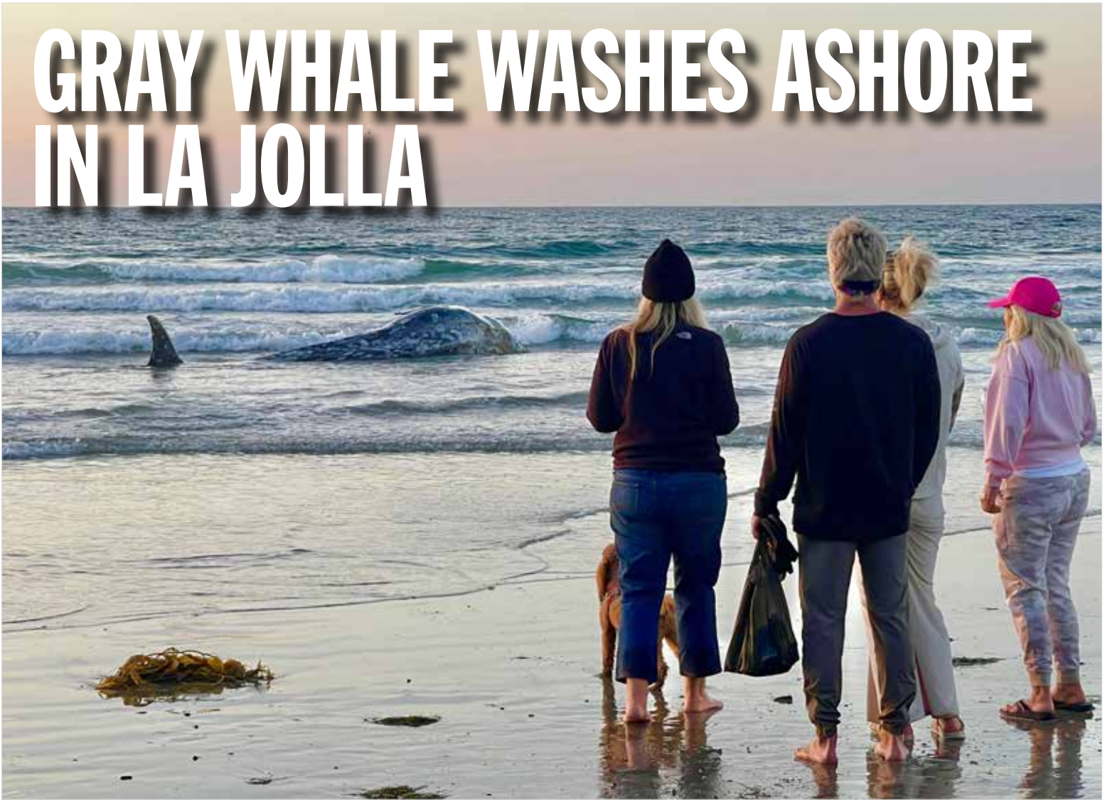
A 24-foot-long juvenile gray whale washed in near the Marine Room on Thursday, Feb. 22. It was too weak to move, and concerned locals tried to push it back into the ocean through the waves, but the surf was too heavy and they eventually had to give up. Lifeguards waited and wanted to see if higher tides would free it up to swim away, but by Friday morning it had died. San Diego Fire-Rescue had the whale loaded onto a truck for transport to the NOAA's center for a necropsy to determine the cause of death.