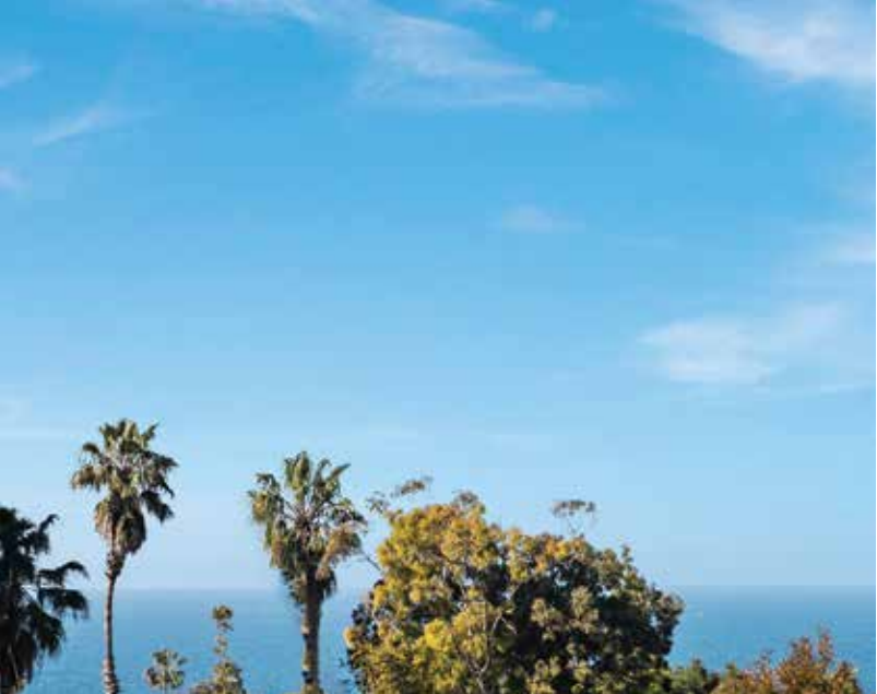
LA JOLLA Top-floor penthouse with westward balconies for beach & ocean views in pedestrian-friendly La Jolla shores. Enjoy high-ceilings, open concept floorplan with FP in living room and separate dining, renovated kitchen, and new baths, sunroom, terraces, sunset views. 2 BD | 2 BA | 1,485 SF | $1,250,000