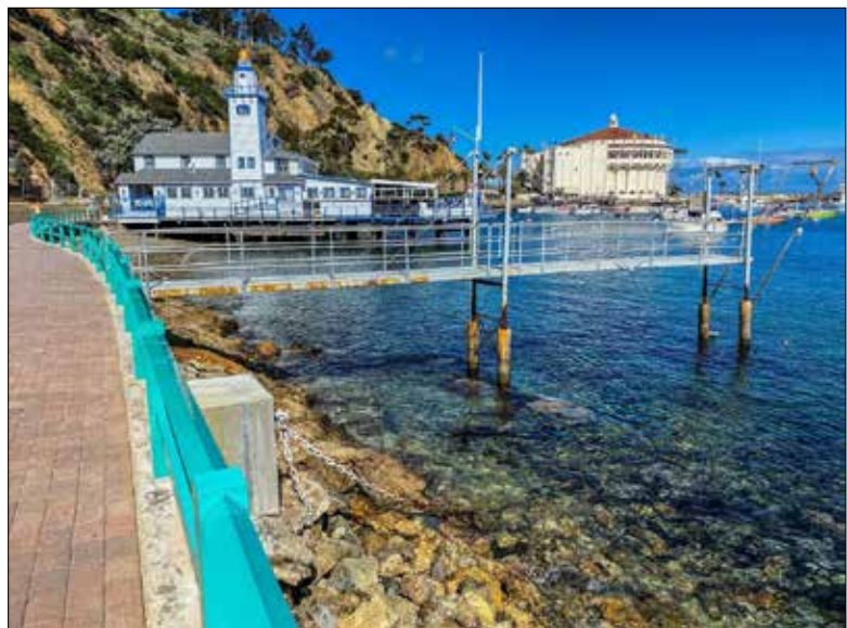
The Catalina Island Yacht Club and the iconic Catalina Casino in Avalon Harbor.