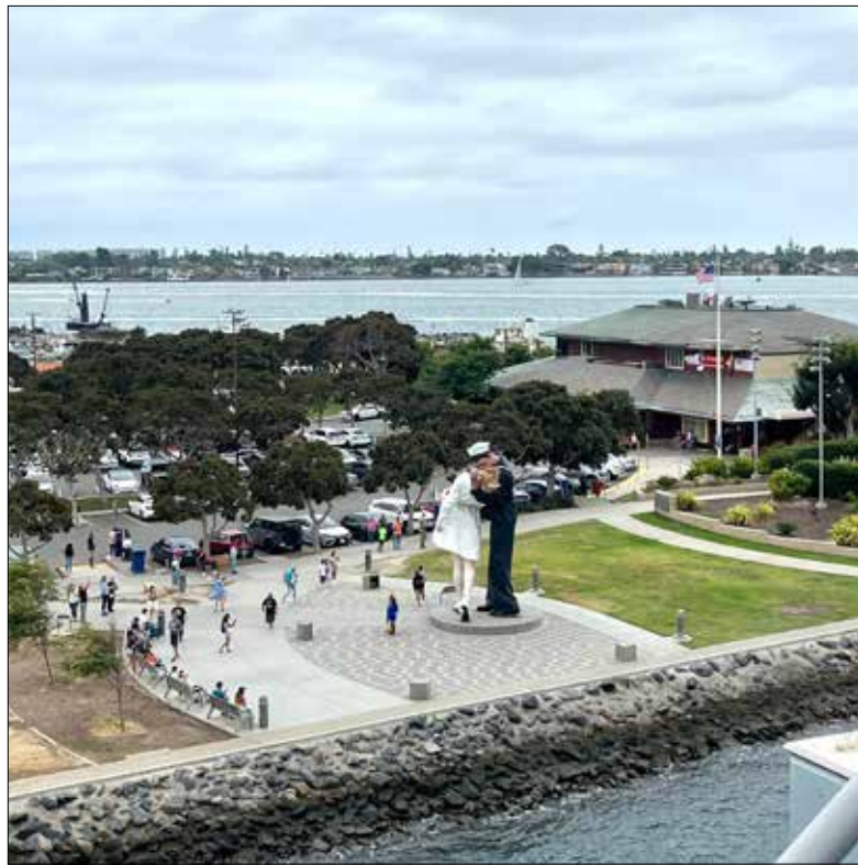
'Unconditional Surrender' from the terrace of the USS Midway Museum.