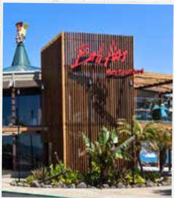
Bali Hai Restaurant 2230 Shelter Island Drive Sat Tour Starts at 11:30 am