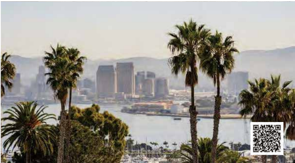
Point Loma, 3BR/1.5BA | $2,349,000 Info@WillisAllen.com | 619.226.7800