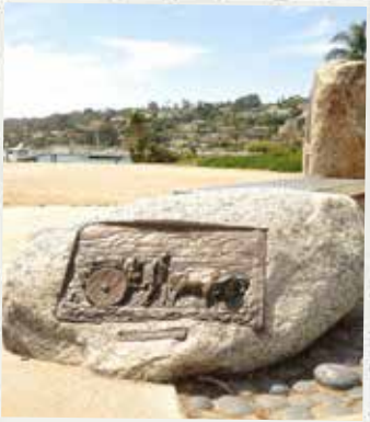
La Playa Trails Walking Tour 3035 Talbot Street Sat 10:30 am