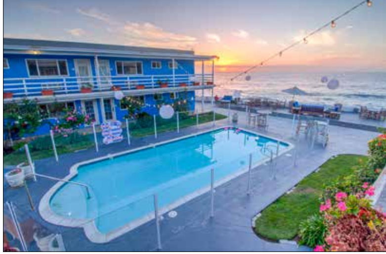
Beautiful sunset views daily at the Inn at Sunset Cliffs.