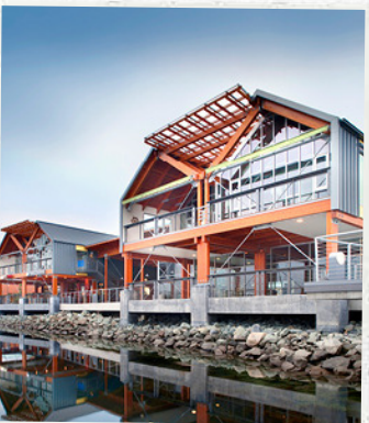
The Miller Hull Partnership 4980 North Harbor Drive Sat 10am - 4pm