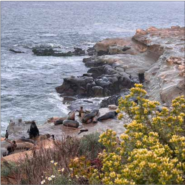
Sea lions in La Jolla.