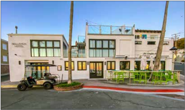
The luxurious Bellanca Hotel re-opened in 2020 after undergoing a nearly $4 million transformation.

The upper level houses the 20,000-square-foot Catalina Casino Ballroom. It is the world’s largest circular ballroom, with a 180-foot diameter dance floor that can accommodate 3,000 dancers. French doors