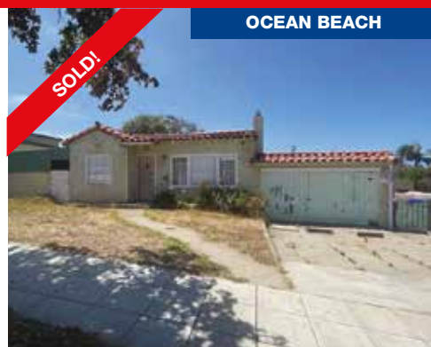
4575-4577 Bermuda Ave. | $2,100,000 This three unit property boasts a rare and substantial lot size of 10,498 square feet. This property presents limitless potential for renovation and expansion. Totaling 2,477 of livable space, these detached units consist of a two-bedroom, one bedroom, a studio, and another two-bedroom, one bathroom.