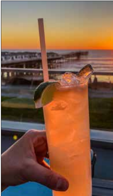
Drinks and a sunset on the Tower23 Hotel’s private deck with lounge chairs overlooking the boardwalk and pier.