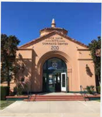
NTC | Liberty Station 2640 Historic Decatur Road Sat 10 - 4pm | Tours 1:30 & 3 pm