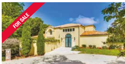
3616 Rosecroft Ln San Diego, CA 92106

Incredible Italian Villa located in the Wooded Area on an oversized 13k esf level lot! Views toward bay, boats, & nightlights. Private cul-de-sac location with access from Silvergate. Ideal open floor plan showcases intricate artistic design travertine and Brazilian cherry hardwood floors across 2 separate living areas. Gourmet kitchen with center island, granite counter tops, custom cabinetry. Extra large primary suite w. its own private patio & fireplace. Massive family room features wet bar, fireplace at second level with incredible bay views. $3,995,000