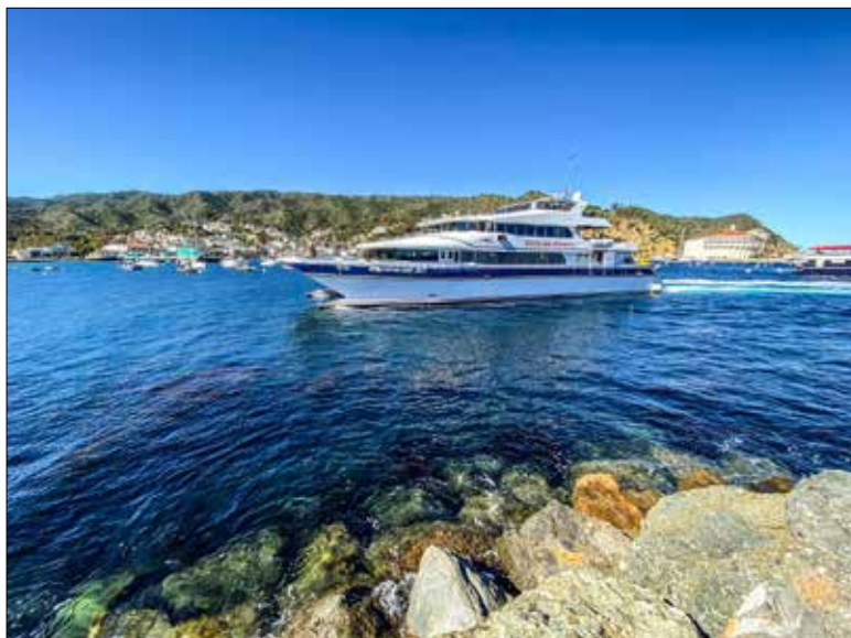
Catalina Express is the fastest, safest, most frequent, and most comfortable form of transportation to Catalina Island.