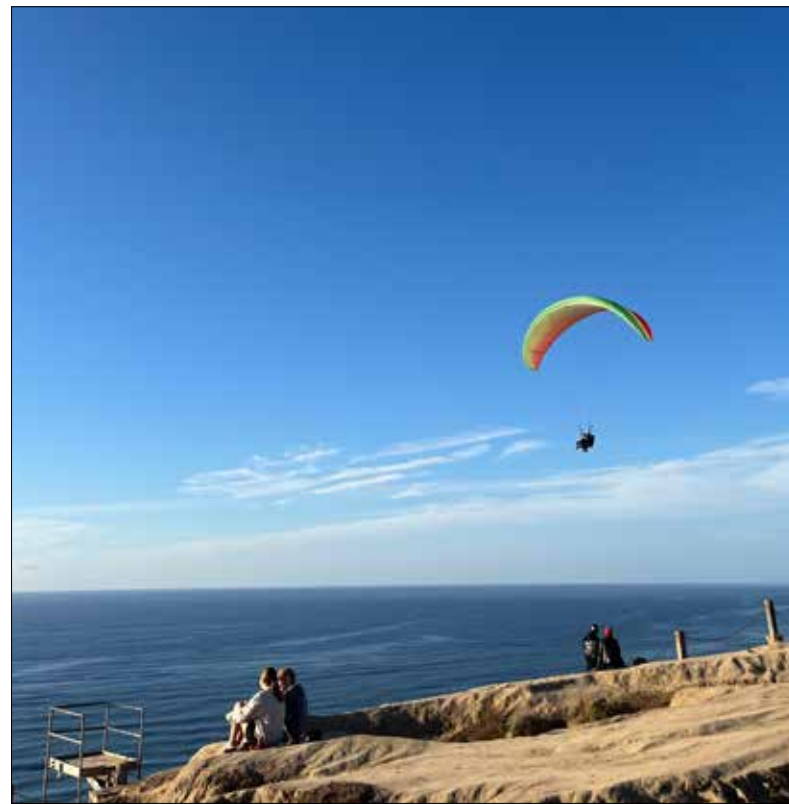
People paragliding at Torrey Pines.