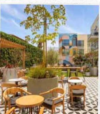
The Monsaraz 1451 Rosecrans Street Sat 10am - 4pm