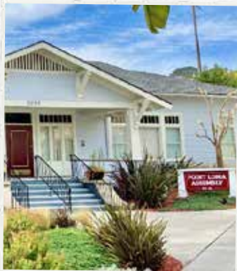
Point Loma Assembly 3035 Talbot Street Sat 9:30- 11:30 am