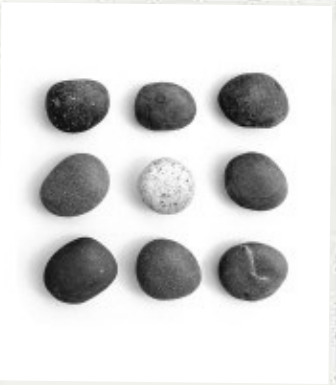
Schmidt Design Group 1310 Rosecrans St, 2nd floor Sat 10am - 4pm