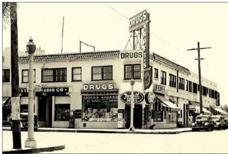
The Kraft Building is still at the corner of Bacon Street and Newport Avenue.

"These are snippets of memories I have of being an adolescent growing up in OB," Wilson said referring to a slide showing her