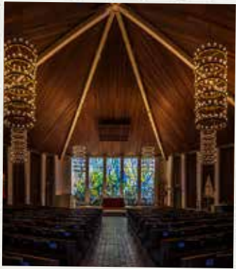
All Souls' Episcopal Church 1475 Catalina Blvd Sat 1 - 3 pm