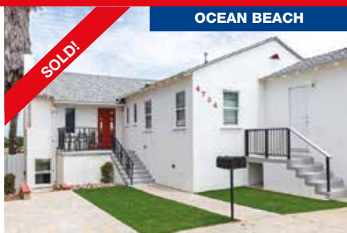
4734 West Point Loma Blvd | $1,795,000 RARE INVESTMENT OPPORTUNITY in Ocean Beach. 2 units for sale, 2BD/2BA & 2BD/1 Bath. VIEWS of Mission Bay and the Ocean that are UNOBSTRUCTABLE.