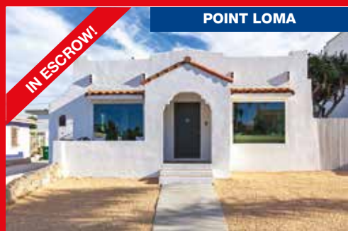
1819 Sunset Cliff Blvd. | $1,695,000 Excellent Development Opportunity. Build an Additional 2 to 4 units on a Level Flat Lot in the heart of Ocean Beach. Existing 2 Newly Remodeled units ready to RENT are currently on the property.