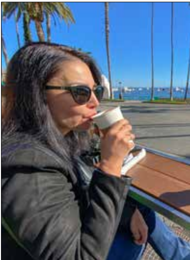
The Naughty Fox’s outdoor seating looks out onto Avalon Harbor.

Info: bellancahotel.com/the-naughty-fox/ .