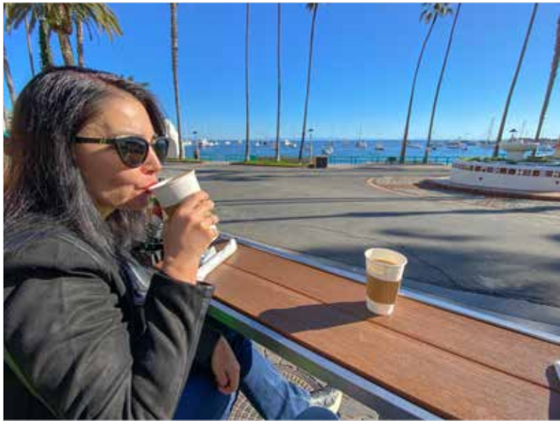
The Naughty Fox’s outdoor seating looks out onto Avalon Harbor.

Where: 111 Crescent Ave., Avalon. Info: bellancahotel.com/ the-naughty-fox/.