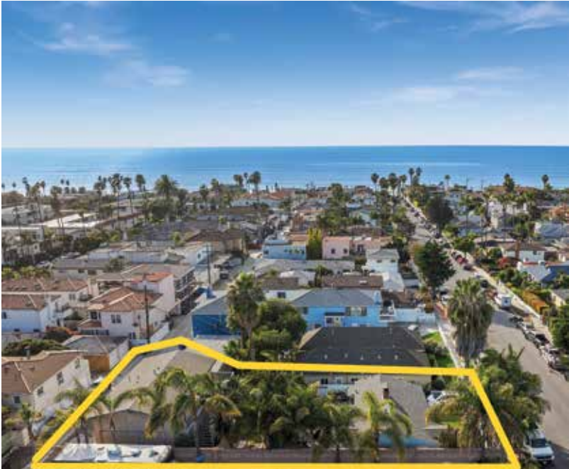
LA JOLLA, WINDANSEA Income Earning! Enjoy homelife in your quaint cottage with old world charm and generous green space. Earn rents from the nice-size unit in back, and more from any of five one-car garages, on a block that ends at the beach, west of La Jolla Boulevard. 3 BD | 1 BA || 2 BD | 2BA || 1,954 SF | 6,406 LOT SF | $2,798,000