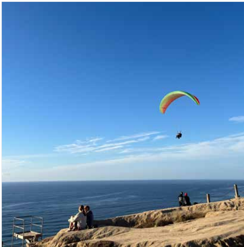
People paragliding at Torrey Pines.