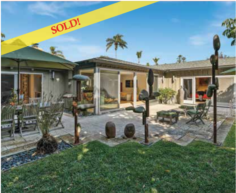
LA JOLLA, LOWER HERMOSA Contemporized behind a pair of extra-wide pivot doors, one steel & the other glass, for privacy & intrigue. Volume ceilings, open trusses, sliding glass doors show off its everything. 4 BD | 3 BA | 2,829 SF | $3,754,236