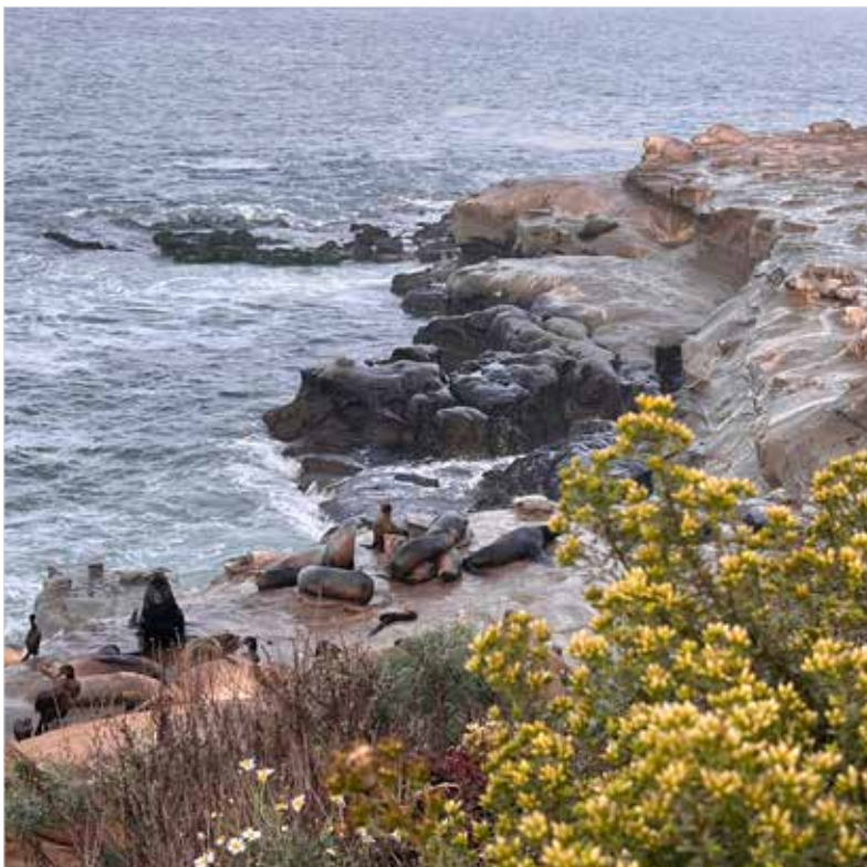
Sea lions in La Jolla.