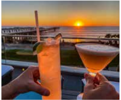
Drinks and a sunset on the hotel’s private deck with lounge chairs overlooking the boardwalk and pier.