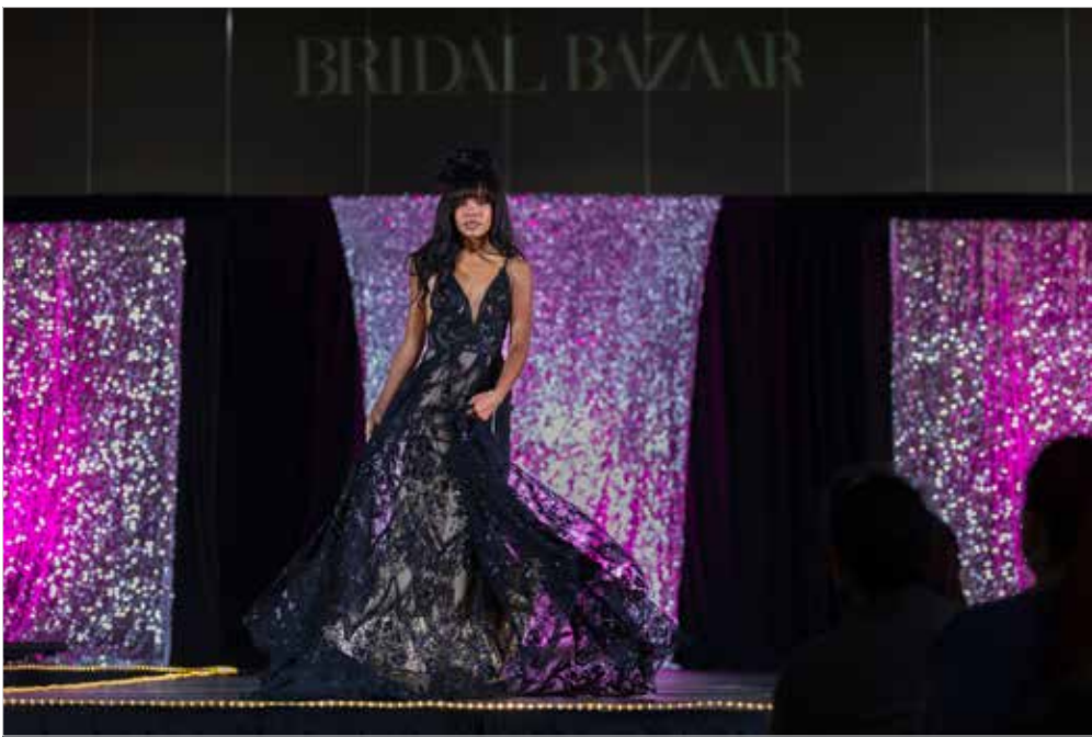
Is black the new white for bridal?