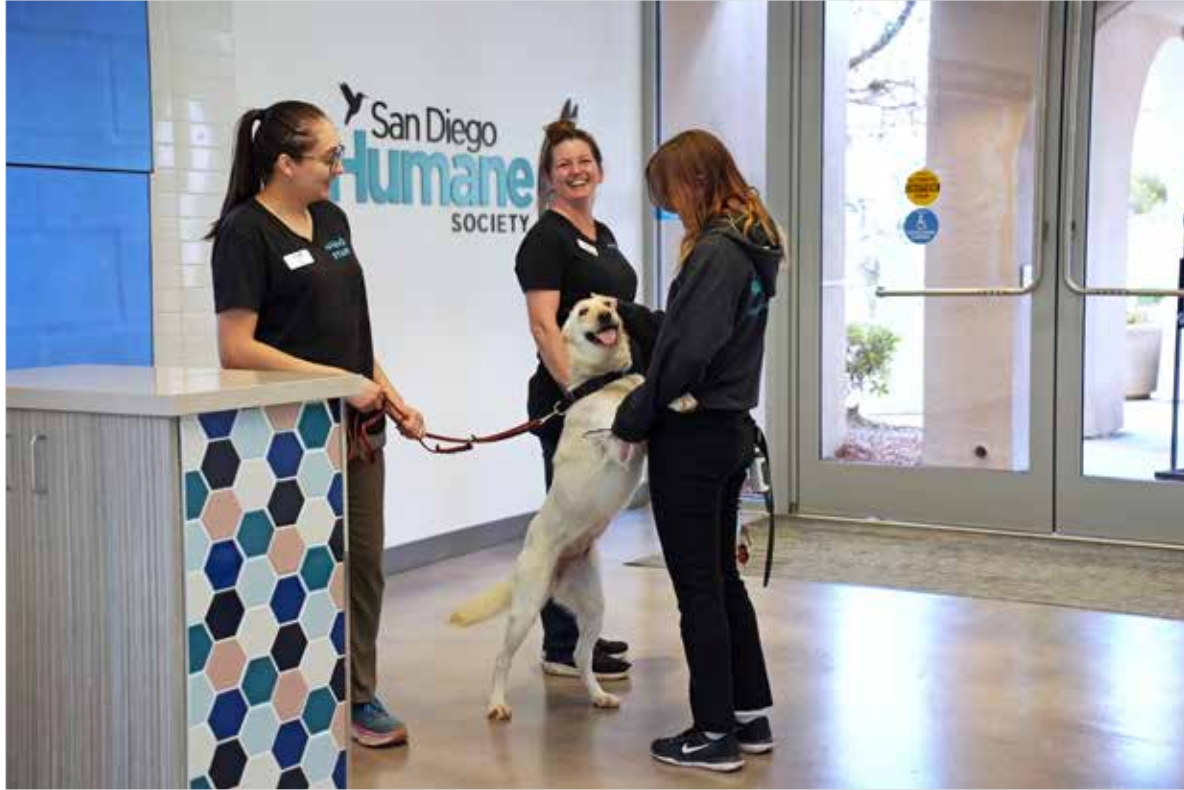
San Diego Humane Society animals move into the new Adoption Center. Natt happily entered the new building.