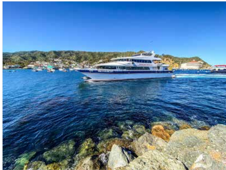
Catalina Express is the fastest, safest, most frequent, and most comfortable form of transportation to Catalina Island.

The easiest way to get there is on the Catalina Express. From San Diego, head north up I-5 for about an hour to Dana Point Harbor, buy tickets, and board for the 9:30