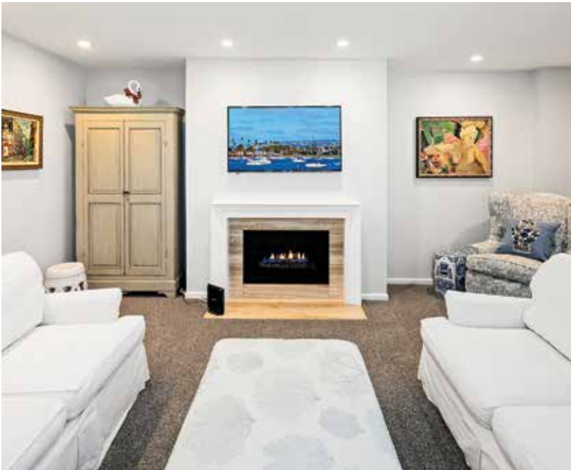
LA JOLLA Top-floor, penthouse with westward balconies for beach & ocean views in pedestrian-friendly La Jolla shores. Enjoy high-ceilings, open concept floorplan with FP in living room and separate dining, renovated kitchen, and new baths, sunroom, terraces, sunset views. 2 BD | 2 BA | 1,485 SF | $1,250,000