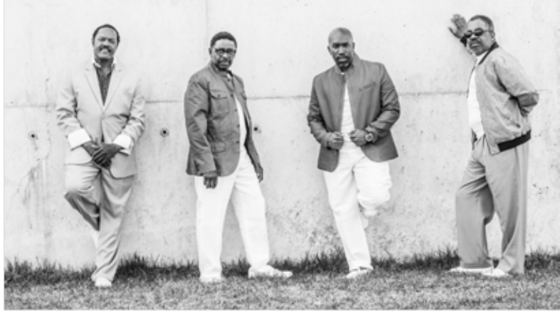
By BART MENDOZA