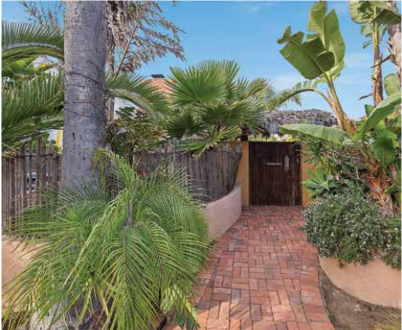
LA JOLLA, WINDANSEA Income Earning! Envisioning the quintessential beach bungalow, private and quaint, with defined income to offset costs? Here it is. A duplex, within a block of the beach, west of La Jolla boulevard, in highly sought WindanSea. 2 BD | 1 BA || 1 BD | 1BA | $2,398,000