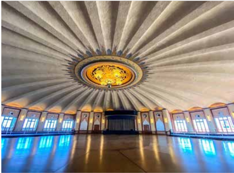
On the top floor of Catalina Casino is the world’s largest circular ballroom, with a 180-foot diameter dance floor.

Where: 111 Crescent Ave., Avalon. Info: bellancahotel.com, 310-510-0555.