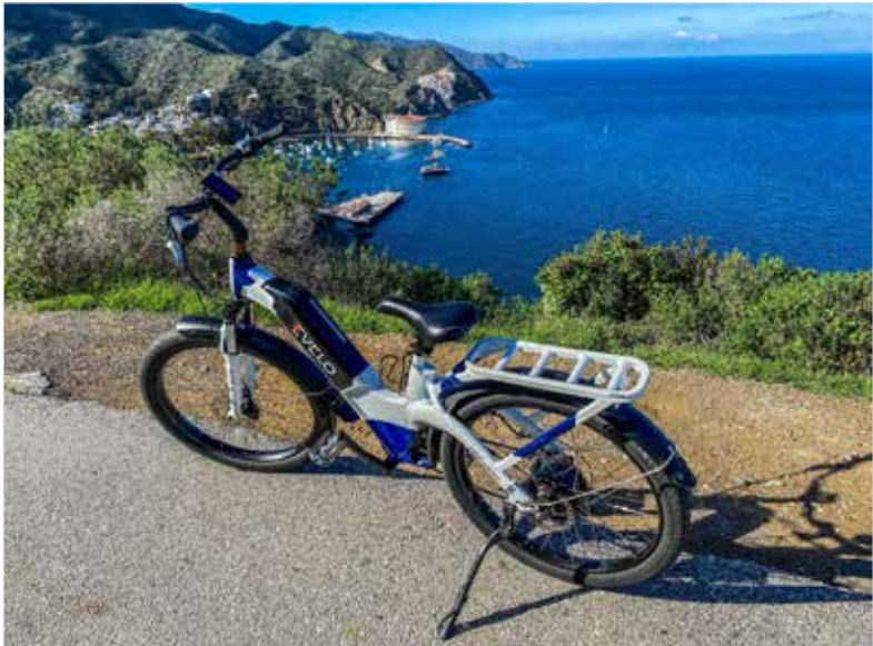
Rode e-bikes from Brown’s Bikes for a self-guided scenic tour of the island.

Where: 107 Pebbly Beach Road, Avalon. Info: catalinabiking.com, 310-510-0986.