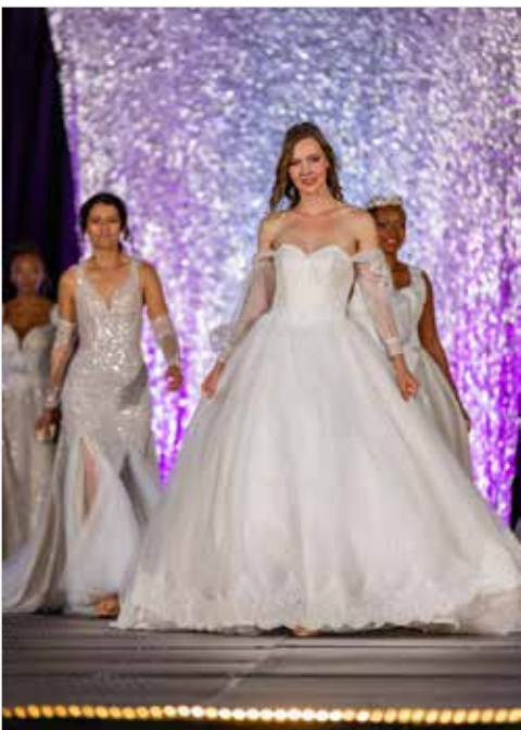
Example of off-the-shoulders and detachable sleeves.

The Bridal Expo and Wedding Festival was presented at the San Diego Convention Center on Jan. 28. This is a perfect place to do one-stop shopping for all the up-and-coming couples who will be tying the knot. Vendors set up booths, there were photographers, videographers, and ideas for honeymoon destinations. One of the crowd favorites was gourmet food sampling and dessert tasting offered by the catering businesses. The event also had interactive wedding activities, gorgeous flowers, and live music. Strolling through all these merchants, one can’t help but come away with a multitude of ideas for their special day. If you are looking for tuxedos or a bridal gown then this is a great way to