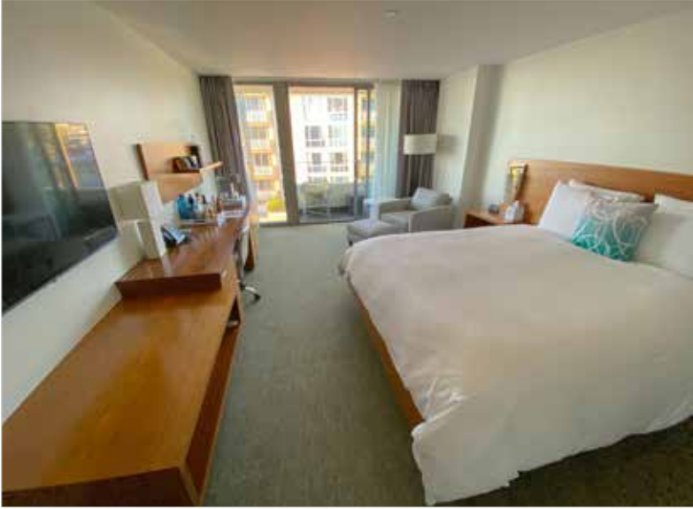
Tower23 Hotel features airy bright rooms with views of the ocean.