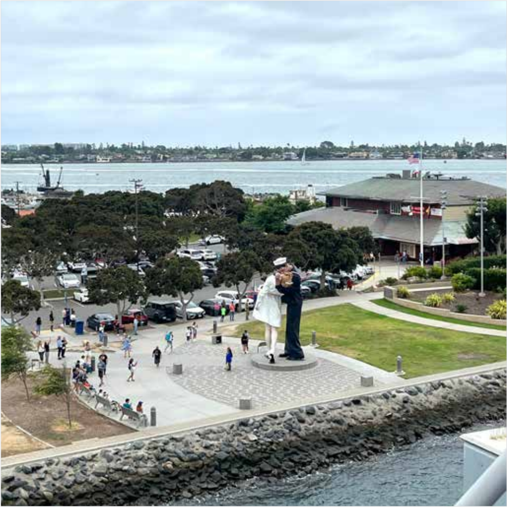
‘Unconditional Surrender’ from the terrace of the USS Midway Museum.

It is truly special to be born on leap day. You are among the rare individuals who fall under a probability of just 0.07%. You deserve to celebrate your birthday as grandly as possible! If you are someone who can confidently say, “Music is my life,” why not treat yourself to a ticket to a jazz club? Enjoy a meal or some finger foods along with some cocktails with your folks. How about dining at restaurants near the pier? On my birthday, I visited Ketch Grill & Tap (near Waterfront Park) and made lovely memories with my friends. They serve delicious food, particularly Mahi Mahi with sweet and sour cauliflower, and sautéed Brussels sprouts leaves, which is phenomenal. You can also host a birthday party on board near the pier. Rent a boat, indulge in food and drinks, party, and happy birthday!