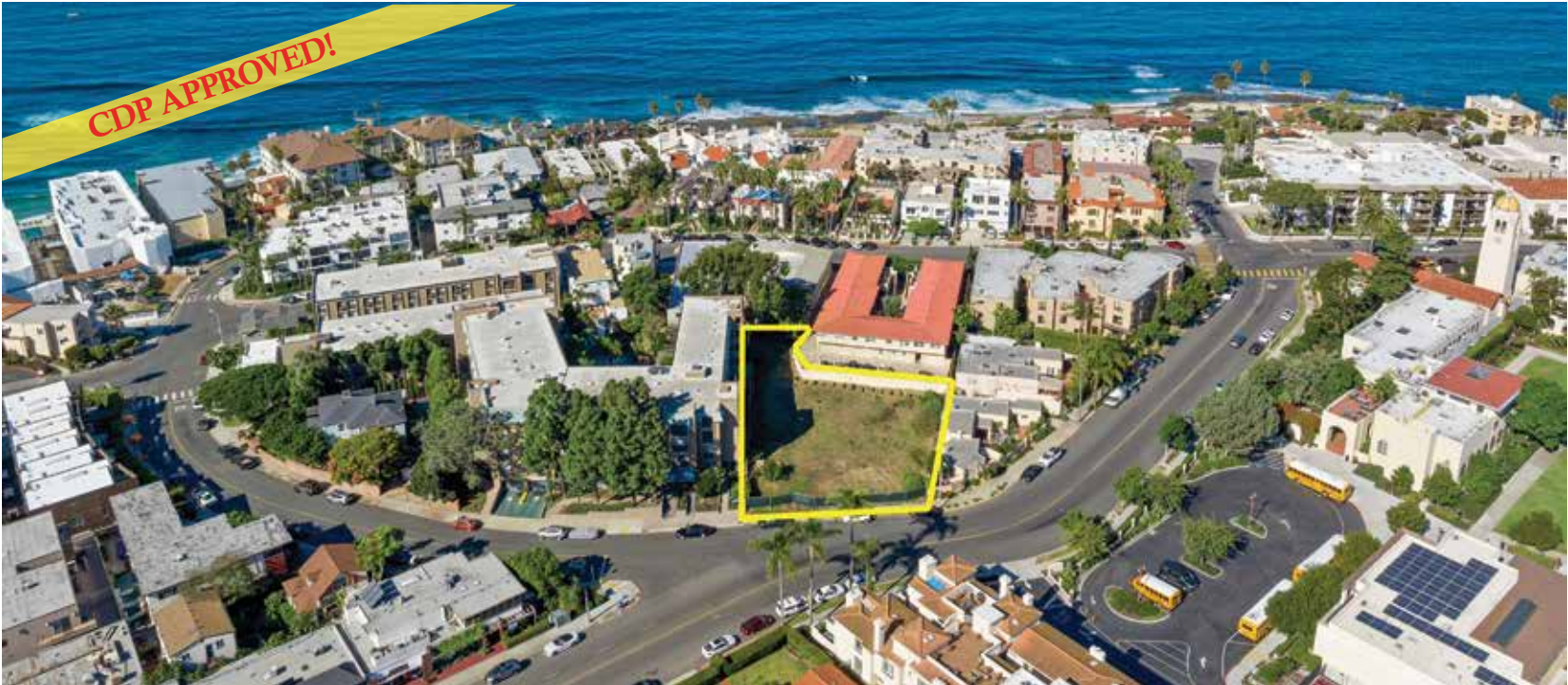
LA JOLLA, VILLAGE AREA Bankruptcy court-ordered sale of vacant lot, just a block from beach, immediately across street from Bishop's School in the heart of the village of La Jolla - a developer's dream! Build from the 8-unit plans by architect Claude Anthony Marengo that are approved by Coastal Development Commission or the alternative best-use analysis: 24-30 units, inclusive of underground garage. 1/3 Acre + | 14,637 SF | $5,898,000