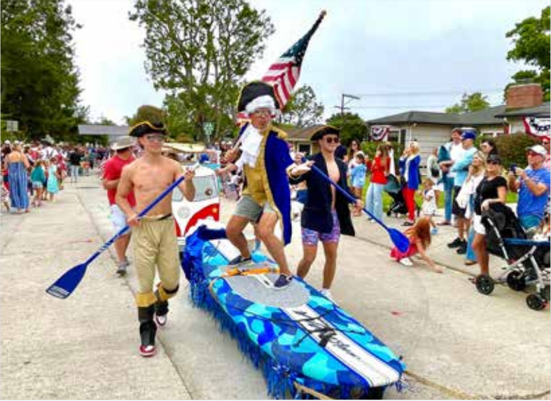
Gen. George Washington surfing across the Delaware River during the annual Beaumont Avenue Independence Day Parade in Bird Rock. The parade’s theme was ‘Surfing USA.’

The City Planning Commission on Aug. 3 thwarted an initial attempt to make San Diego the first California city to implement SB 10, a bill that could allow up to 10