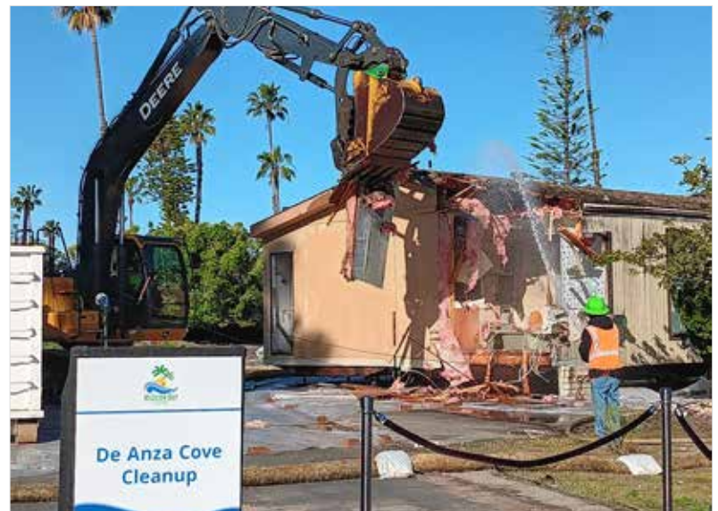
A backhoe rips down a dilapidated mobile home on Marigold Drive at De Anza Cove on Feb. 15.

Located at the Bahia Resort Hotel | (858) 539-7634 998 West Mission Bay Drive | San Diego, California