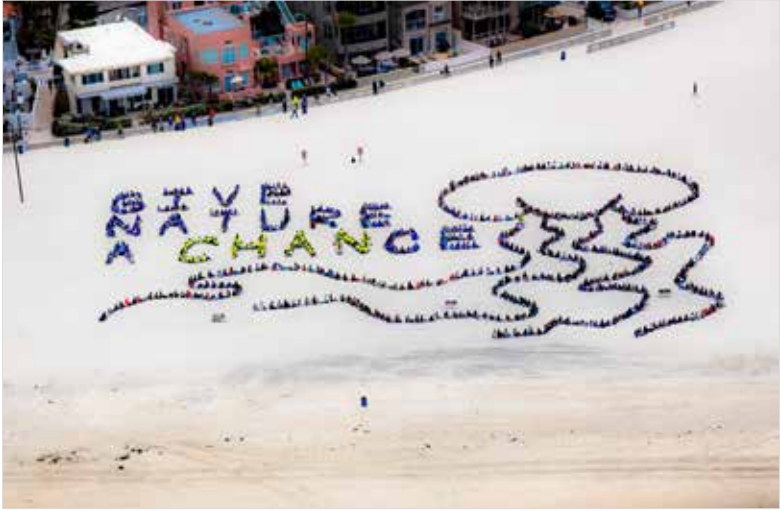
Kids Ocean Day, held by I Love A Clean San Diego for elementary students, took place on May 25 in Mission Beach. The students concluded their visit by creating an aerial art message, spanning an impressive 230 feet by 230 feet, which spelled out, ‘Give Nature A Chance,’ along with a jellyfish.