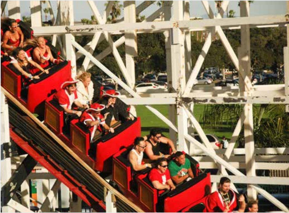
SantaCon attendees could ride all the rides, such as the Giant Dipper, at Belmont Park during the event.