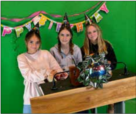
PB Middle media class