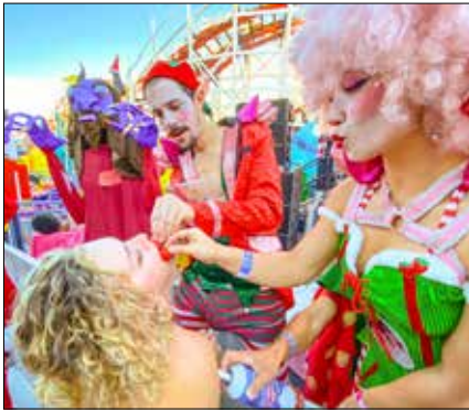
Wild times in Mission Beach