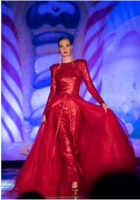
Glamorous gown by EMILcouture.