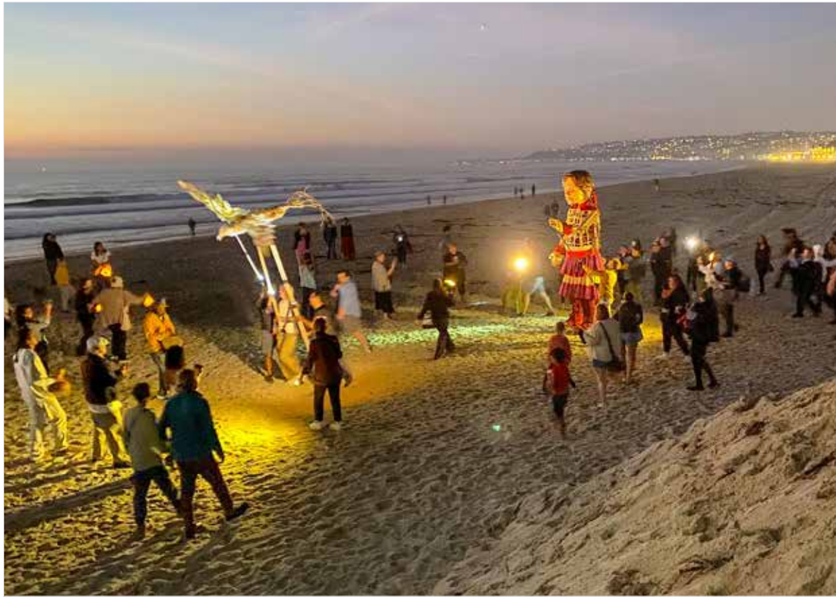
Little Amal walks south down Mission Beach on Nov. 4 and stops when she discovers the remnants of cherished belongings that have been washed ashore, thinking about the millions of refugee children across the world, who, like her, are searching for a better life. Little Amal, the internationally celebrated 12-foot-tall puppet of a 10-year-old Syrian refugee girl, made Mission Beach her final stop during her epic 6,000-mile journey across the United States this fall. She then crossed the border to Tijuana and started a new journey through Mexico.