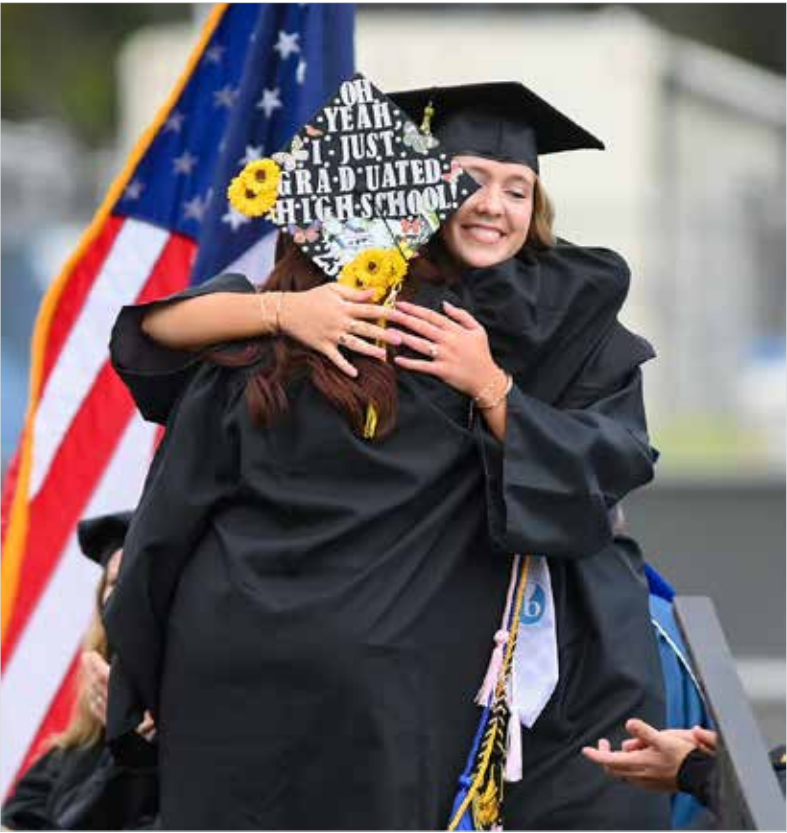
Two students hug during commencement ceremonies at Mission Bay High. The school’s graduating class of 2023 sent nearly 300 students out into the world at commencement ceremonies held on June 14.

Pacific Beach Town Council’s 13th annual graffiti cleanup on May 13 was a success. A total of 119 volunteers went out to remove graffiti, and 730-plus tags were removed.