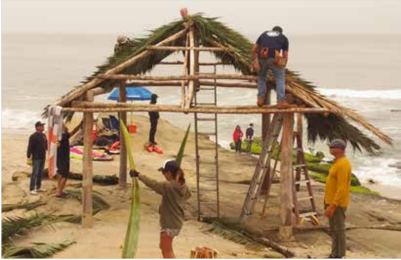
Friends of Windansea members and volunteers re-thatched the Windansea Surf Shack on Saturday, April 29.

The surfboard flower-petal community mosaic mural to revitalize the 65-year-old Pacific Beach Rec