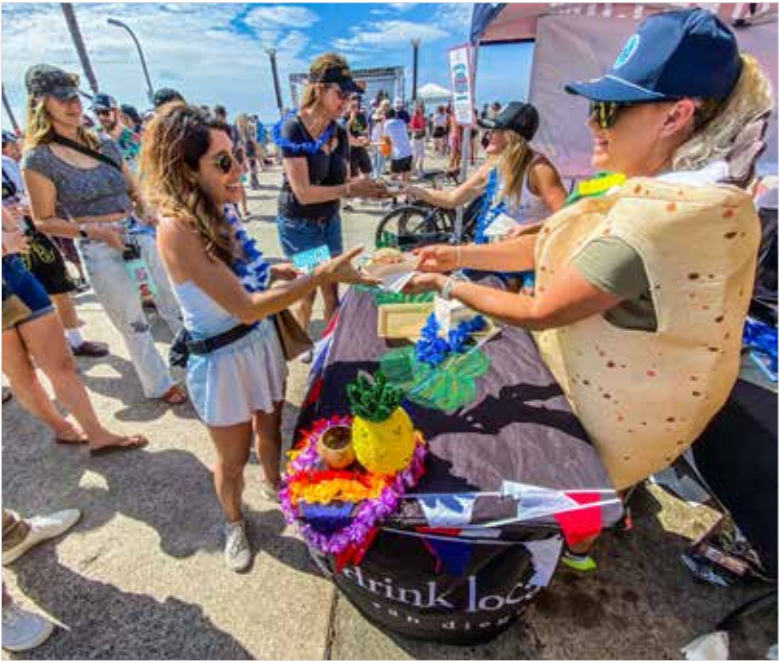
Pacific BeachFest attendees are served fish tacos from a giant taco at The Local’s booth during the Best of the Beach Fish Taco Contest at the annual event on Oct. 7. Sandbar Sports Grill’s TKO grilled mahi mahi tacos held off the other contenders to win the best taco title.