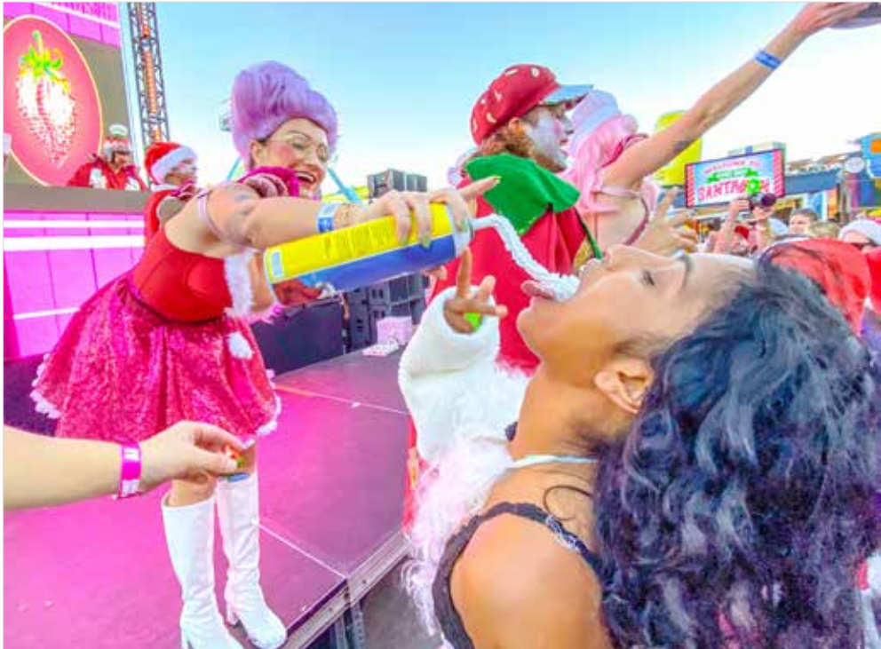
A member of the wonderfully charming Strawberry Disco Circus sprays whipped cream into the mouth of a fan during SantaCon at Belmont Park.