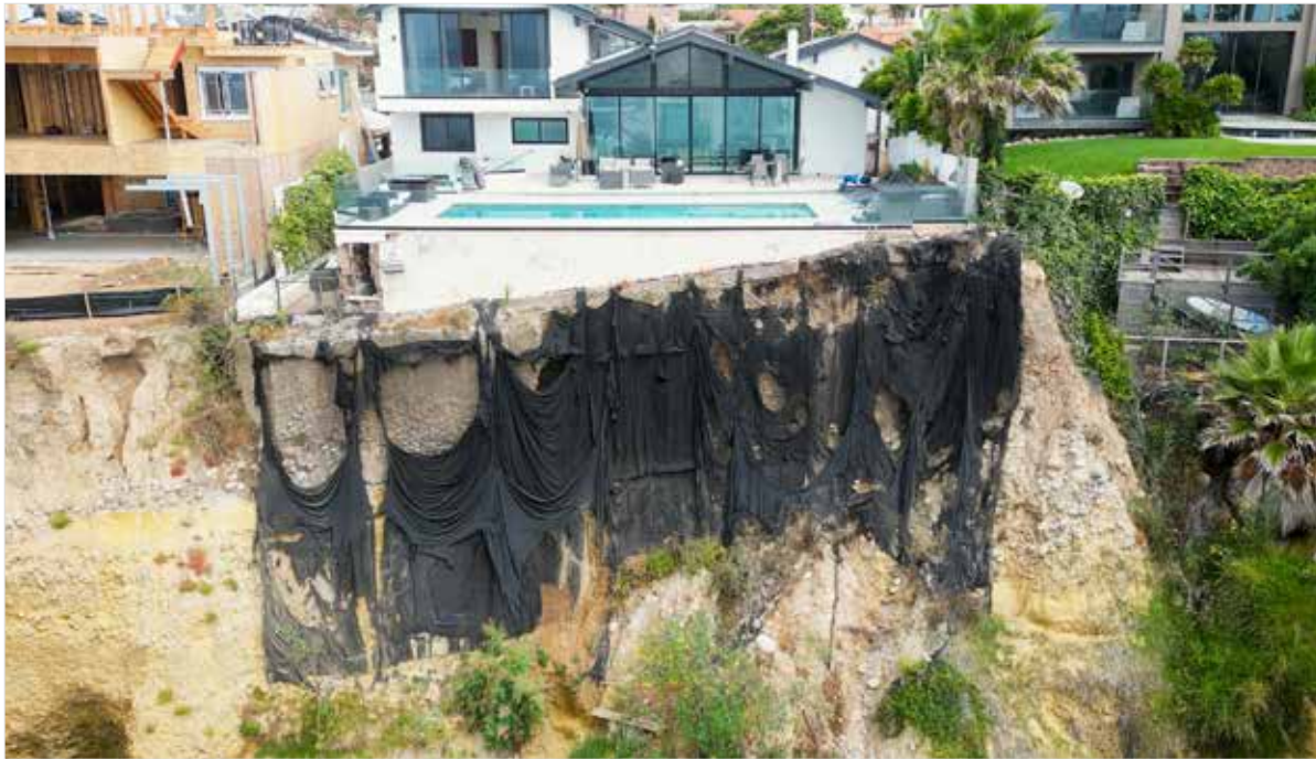
The ragged black tarp is covering up unpermitted slurry concrete infill on the bluffs at 417 Sea Ridge Drive.

During a recent visit to the tarp site, Bubbins noted the black tarp "serves no functional purpose. It's covering up unpermitted slurry concrete infill, and there was a partial collapse of the bluffs in 2016. So there's been an open code violation for unpermitted work since then."