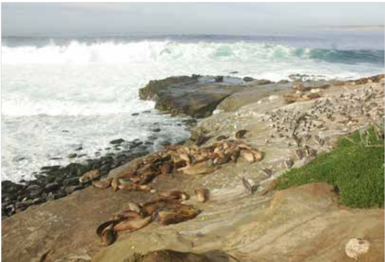
Sea lions use Point La Jolla as pupping grounds.

The popular pool was created and dedicated by philanthropist Ellen Browning Scripps in 1931 as a safe wading area for children to learn to swim. However, growing conflicts between seal advocates seeking protection of marine mammals, and beach-access proponents arguing the state Constitution guarantees public access to coastal waters, ultimately led to Children's Pool being closed to the public with a guideline rope since 2014 during