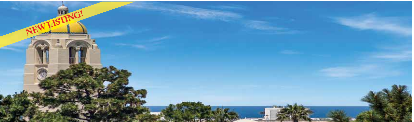
LA JOLLA in the village: Soak in sun and ocean views from your south- or west-facing balconies for your-choice vantage point of the panoramic ocean view. Come home to "escape" or dally in the village and the cove to enjoy beach and beach-town life. 2 BD | 2 BA | 1,353 SF | $1,625,000