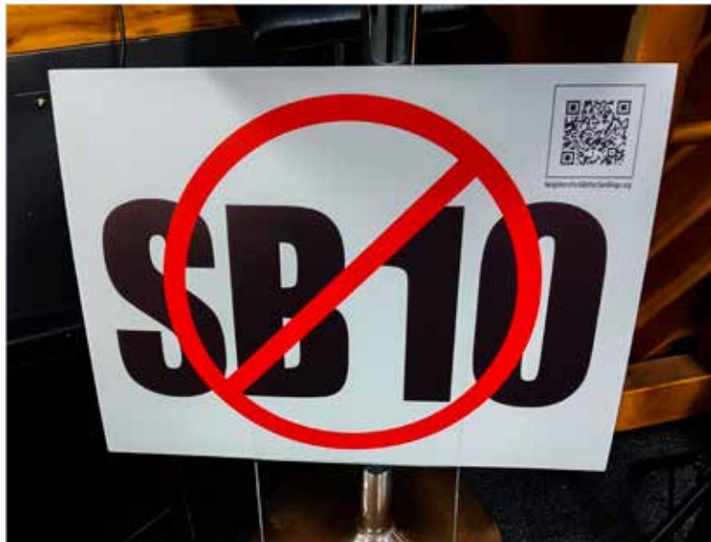
These signs against SB 10 have been spotted in the coastal areas.

Noting SB 10 was co-sponsored by former State Sen. Toni Atkins, Hueter pointed out the legislation, enacted in 2021, "allows you, without any kind of environmental review, to put up to 10 units