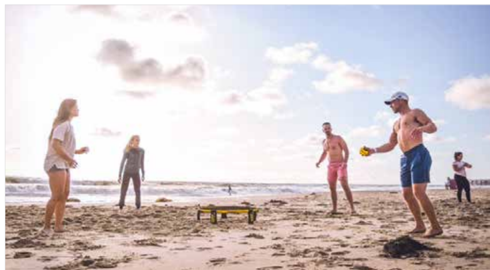
SD Roundnet is bringing the first Spikeball league to San Diego.