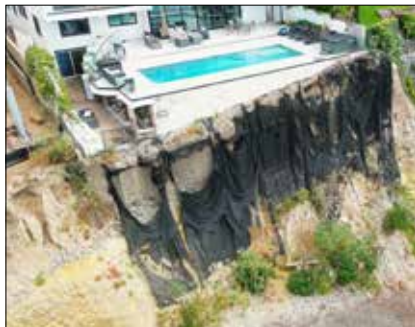
Residents want tacky Tourmaline tarp removed SEE PAGE 4