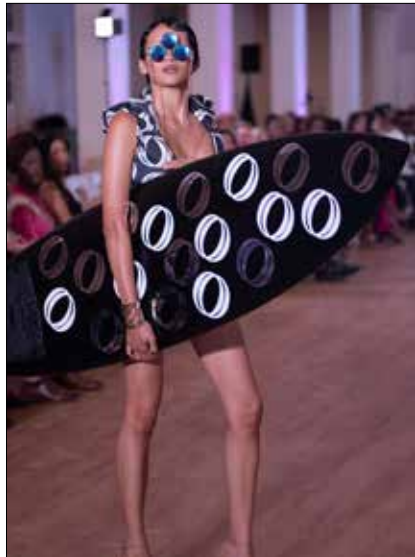
San Diego Swim Week makes waves SEE PAGE 13