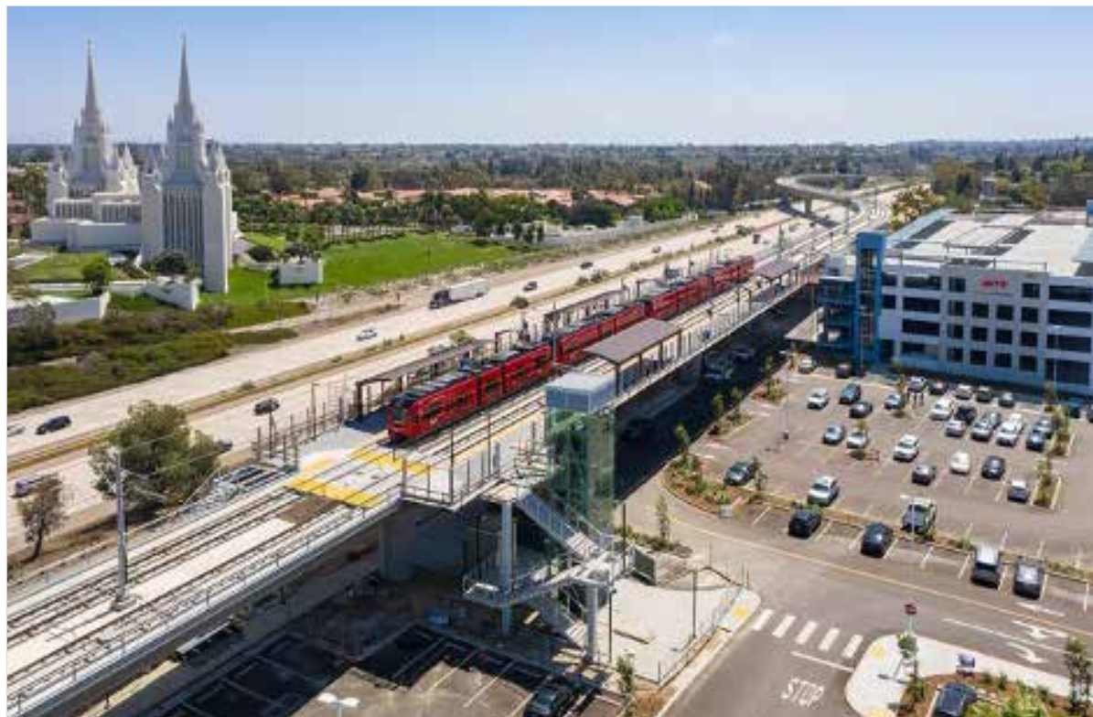
The new Blue Line Trolley heads north toward La Jolla past the Church of Jesus Christ of Latter-day Saints San Diego California Temple.

Extending the Blue Line Trolley to UTC with 92 miles of track, five park-and-ride facilities, and integrating UC San Diego