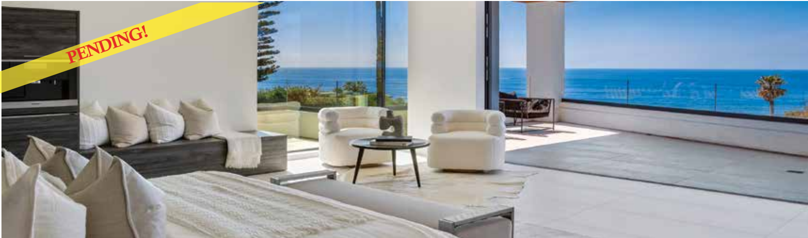
LA JOLLA Lower Hermosa: A Contemporary Estate. New Construction on Camino De La Costa, La Jolla's street of dreams. Enjoy sit down ocean views from every facing vantage point. Agent: Natalie McGhie | Hm: 4,457 sqft | Lot: 8,724 SF | Roof Deck: 2,677 SF | $10,500,000