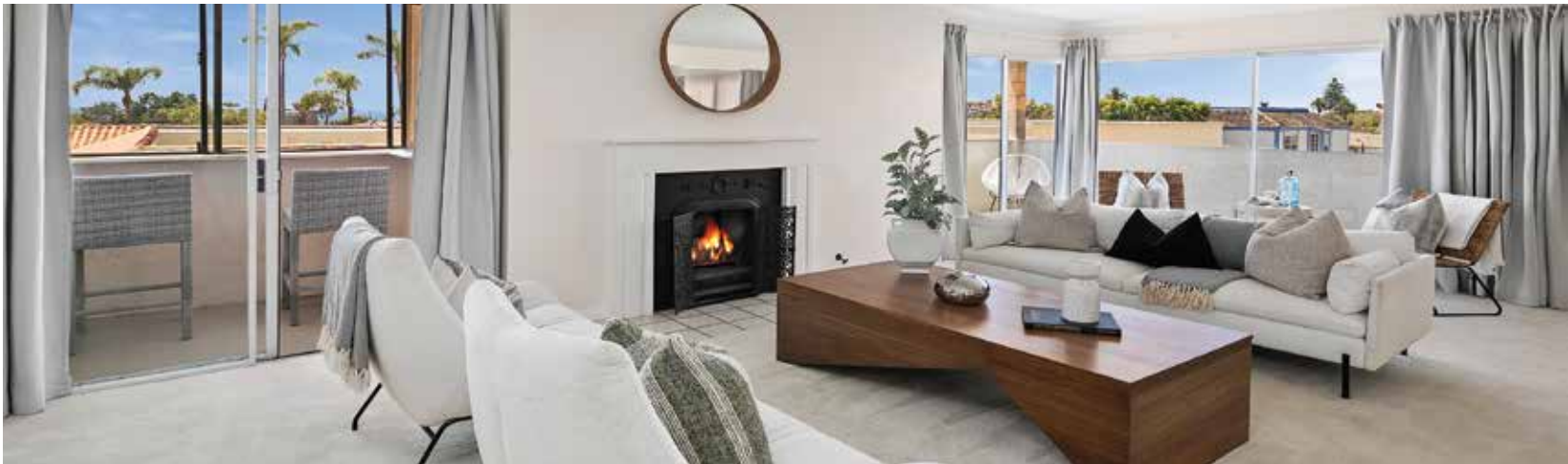
LA JOLLA Balconies and Ocean Views in the village: Enjoy the village lifestyle & your treasured solace in this single-story, end unit with westward views of ocean and beach town, a fireplace lounge and breezy balconies to sit & sip coffee or martini toasts on cold or warm weather days. 2 BD | 2 BA | 1,359 SF | $1,398,000