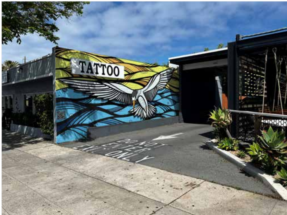
A rendering of how the California least tern mural at PB Tattoo will look when completed.