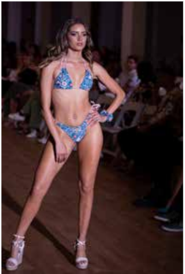
Closing Collection from Coral Swimwear X with bikini and scrunchie on the wrist.