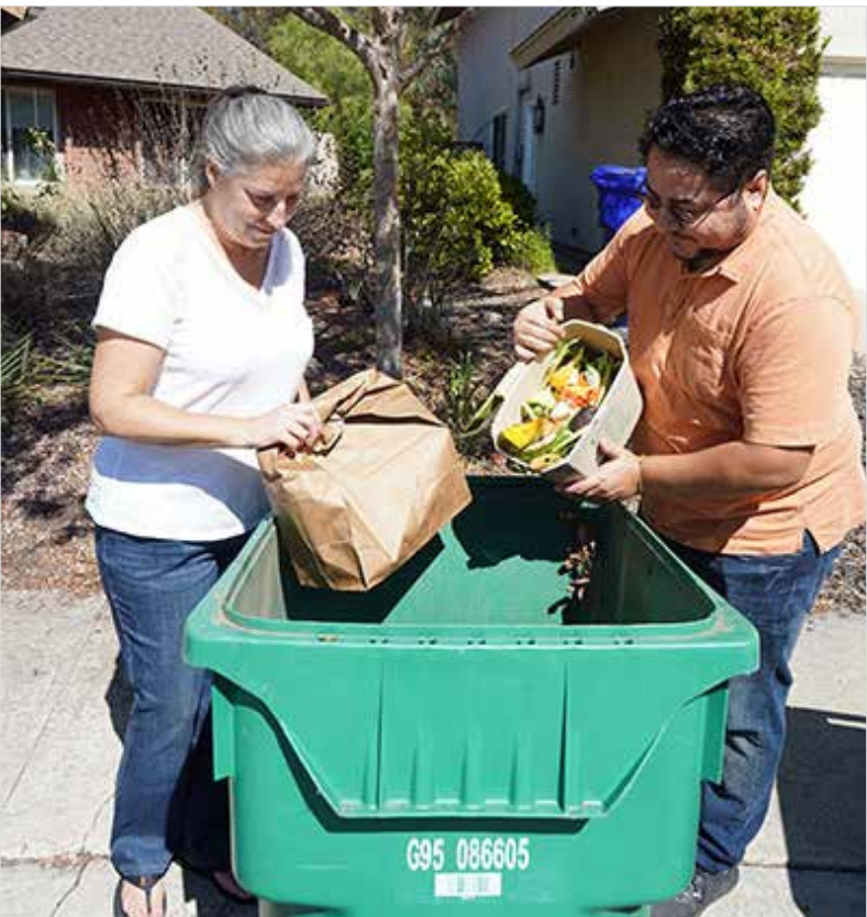
Line the bottom of your outdoor container with newspaper, a paper bag, or yard waste to absorb excess moisture and prevent food from sticking to the bottom.

City: Area supervisors coordinate with drivers to strategically