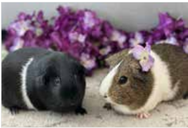
Last year's winners were Guinea pigs Rosie and Nibbles, which raised $1,022 for the nonprofit San Diego Humane Society.

Submit your favorite pet photo at sdhumane.org/photocontest and encourage your family and friends to vote for your pet's picture through Aug. 31.