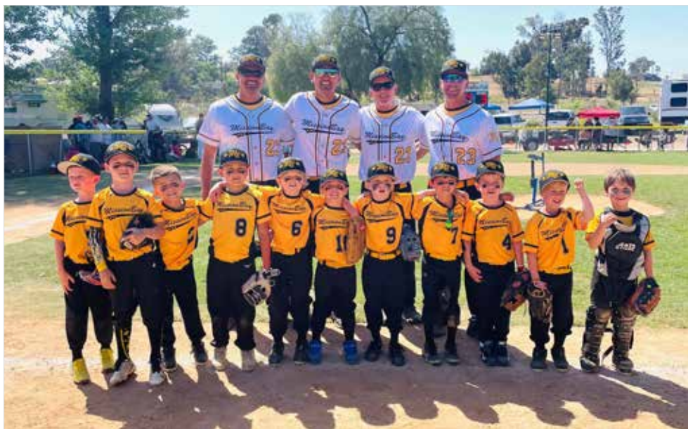
The Shetland 6U Mission Bay Youth Baseball All Star team had a good run to the Super Regional tournament.