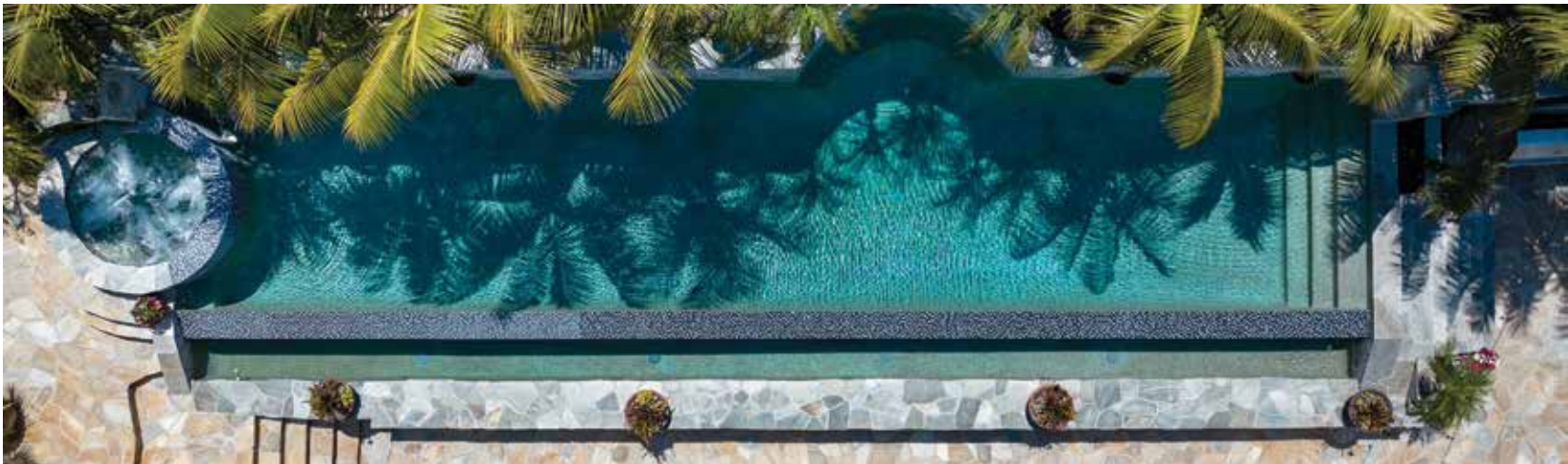
LA JOLLA Scenic North: Breathtaking & romantic villa masterpiece nestled behind private gates on a half-acre lot offers five fireplaces, two offices, chef's kitchen, a movie room and primary suite w/dual ensuite baths and closet-dressing rooms, with serene gardens and vibrant play spaces to complement and fulfill! 6 BD | 6.5 BA | 8,873 SF | $6,498,000