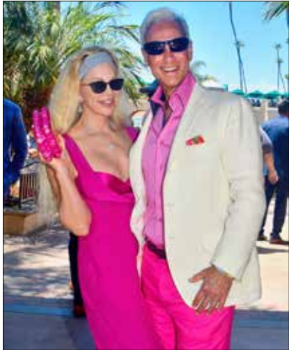
The Social Diary: Baywatch Barbie rescues osprey SEE PAGE 16