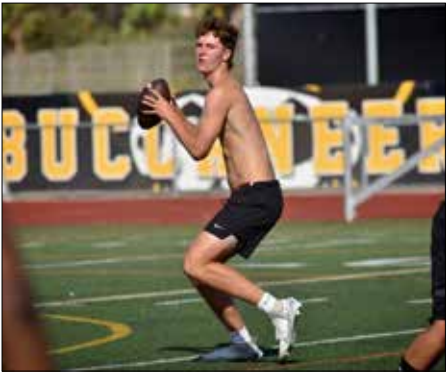
Bucs prepare for season SEE PAGE 15