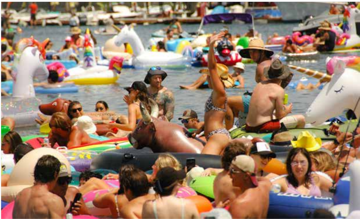
Last year, hundreds of people came out for the second annual Festival of Floats on Mission Bay.