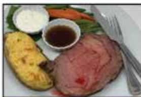
Hot Prime Rib on Saturdays

New Bistro Menu Patio & Inside Dining www.thefrenchgourmet.com catering@thefrenchgourmet.com