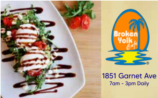
sdnews.com SAN DIEGO COMMUNITY NEWSPAPER GROUP