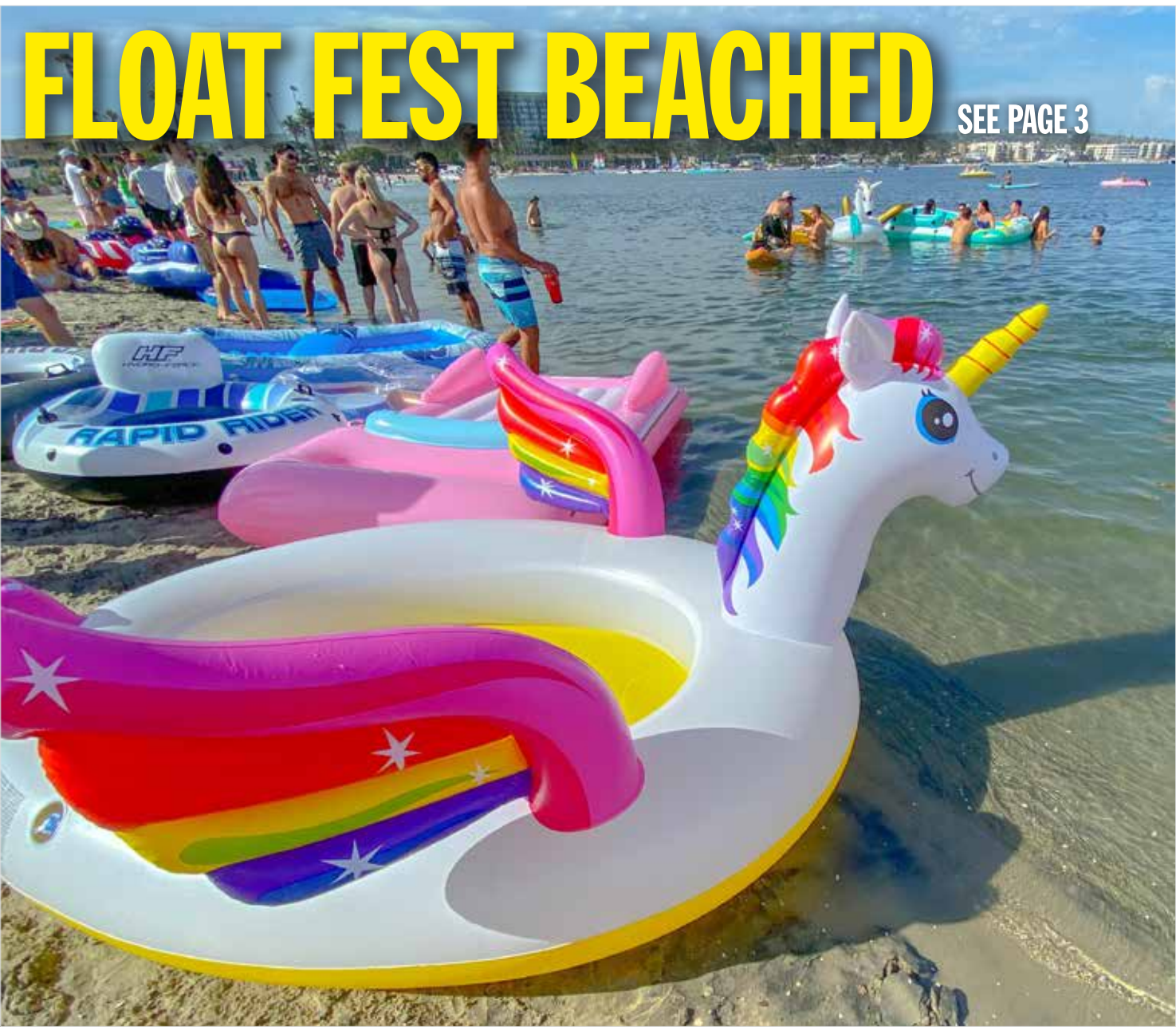
Dozens of people showed up, but almost all the floats stayed on the beach on Sunday, July 30, after the Festival of Floats was canceled by the organizer and City due to a lack of permits and safety concerns.