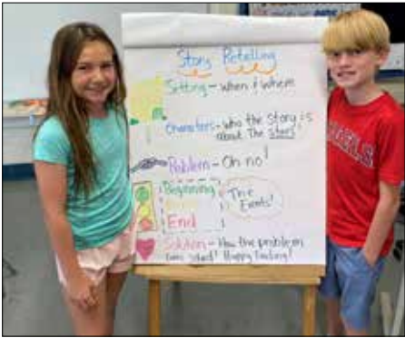
Sessions summer sessions SEE PAGE 8