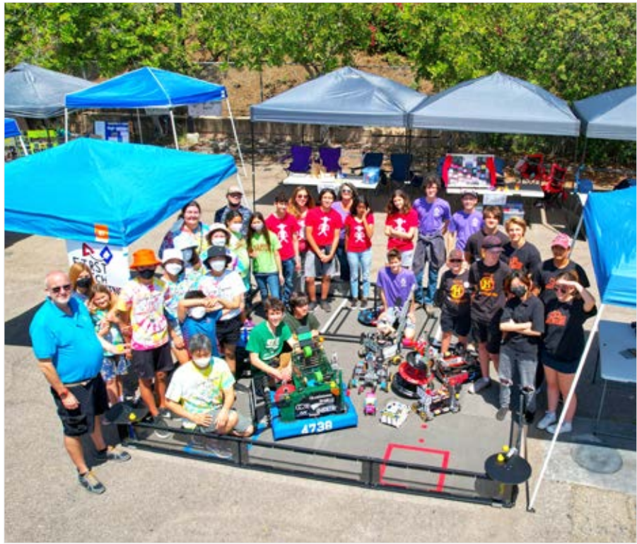
The Robotics Showcase Extravaganza is back for this year.