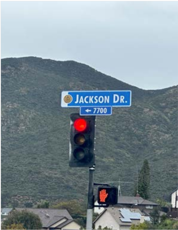
A before and after look at a street sign replacement on Jackson Drive.