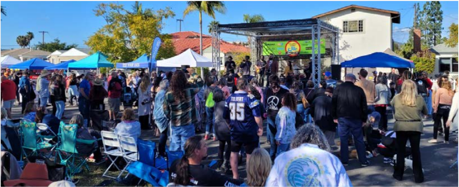
Plenty of fun and more awaits visitors to this year's 25th edition of the Rolando Street Fair

Corbin O'Reilly, the owner of local BBQ and brew shop CorbinsQ and Tap Truck, is looking forward to stepping up the event in 2023. "I'm upping staff, equipment and our plan of attack so people can be ready to listen to great