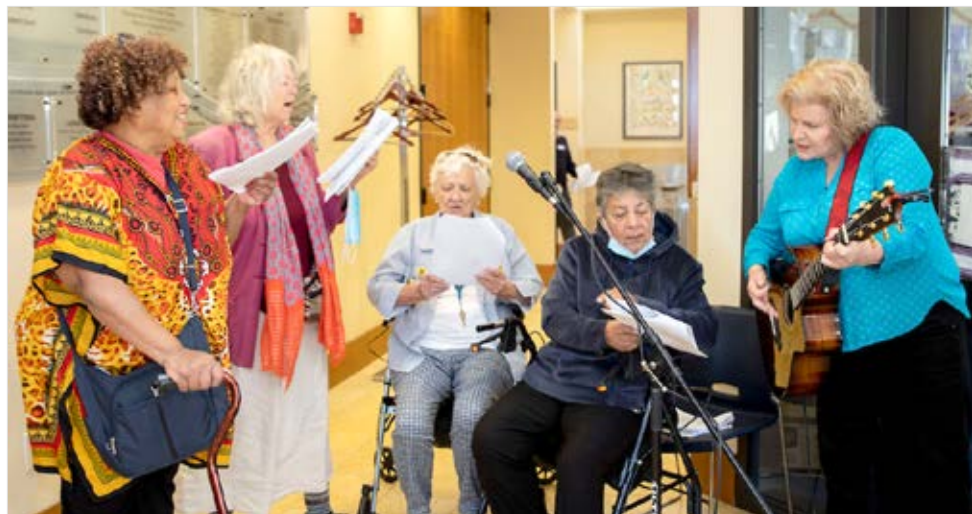
Musical entertainment is but one of the many things seniors can enjoy and partake in at the reopened JFSCAC.