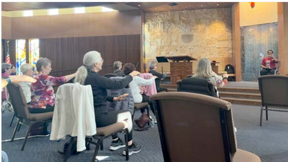
Tai Chi is another activity that seniors can participate in at JFSCAC