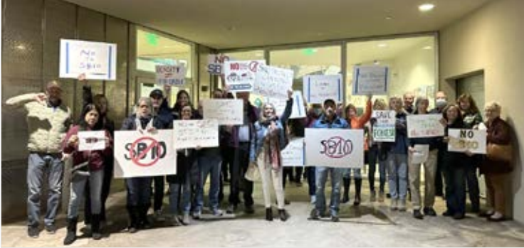
Residents turned out recently to voice their unhappiness with SB 10.

automobile use requires us to build new development as close as possible to transit. City planners are focused on getting people from their home to the nearest transit stop, but mass transit can only work if there's lots to do — working, shopping, dining, medical appointments, etc. — at the destination end of the trip. For example, if I need to visit my doctor, meet a friend for coffee, mail a package, and get batteries for my TV remote, and I can finish my to-do list within close proximity of my doctor's office, then it makes sense for me to take the bus or trolley. But if each of those activities is a mile apart, then I'm going to take my car. And that's the reality for an overwhelming number of San Diegans. Therefore, the key to getting people out of their cars and onto the bus or trolley is to redevelop our transit and commercial corridors from automobile-focused strip malls into walkable, bikeable neighborhood cores that combine ground floor retail with upper floors of mixed-income housing. We can do that, because our city has more than