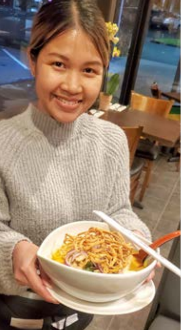
There is plenty to smile about with the food and service at The Corner Thai Kitchen.

Some other house specialties are Garlic Pork Spare Ribs, Crab Fried Rice, Thai Mango Chicken, and the Vegetarian dish called Buddha Delight with crispy tofu sautéed with mushrooms, zucchini, bell peppers and broccoli in a bean sauce. Thai Corner Restaurant is open every day except Tuesday from 11 a.m. - 9 p.m. If you go for lunch, they offer many lunch specials that include a house salad, egg roll and gyoza. They do a strong take-out business; you can preview their menu at: cornerthaikitchen.com .