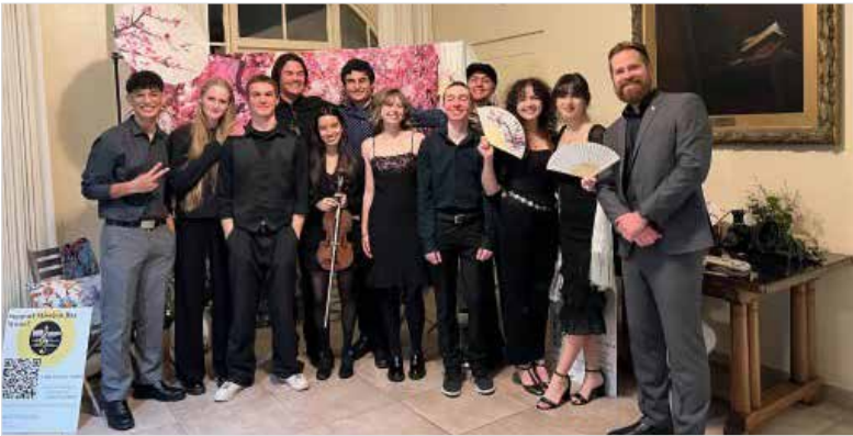
Mission Bay Preservationists played concerts to raise funds for their Japan trip.

the $15,000 needed for the trip to take place. The Yokohama Sister City Society is covering an additional $15,000. The sold-out fundraising concert on Feb. 22 at La Jolla Women's Club raised an additional $13,000, to help the band meet its fundraising goal.