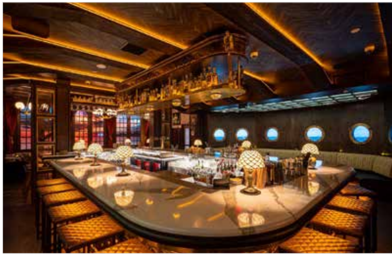
Captain's Quarters at 910 Grand Ave. is reminiscent of vintage 1800s Spanish galleon-style ships with room for about 75 seats for drinking and dining.

"We wanted to have a new kind of restaurant experience," Spencer said pointing out each of SDCM's restaurant locations "give you some kind of