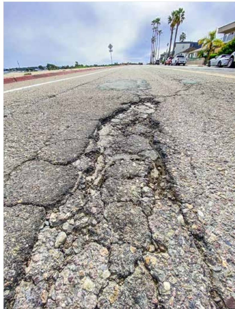
This crevasse opened up on Crown Point Drive near the entrance to Crown Point Park after heavy rains in February. City crews were out filling potholes on Crown Point Drive on Feb. 17 but didn't get to this one.

Santacroce: There are pothole issues across the City, and we recognize that some areas are worse, due to the frequency of travel and exposure to the elements, tending to have more severe potholes more frequently than other areas. Saltwater and moisture have