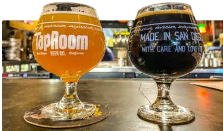
SD TapRoom's 16th Anniversary Triple IPA (left) and the stout Parabola by Firestone Walker.