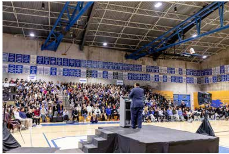
Martin Luther King III speaks to students during the Say It Now event at La Jolla Country Day School on Feb. 23.