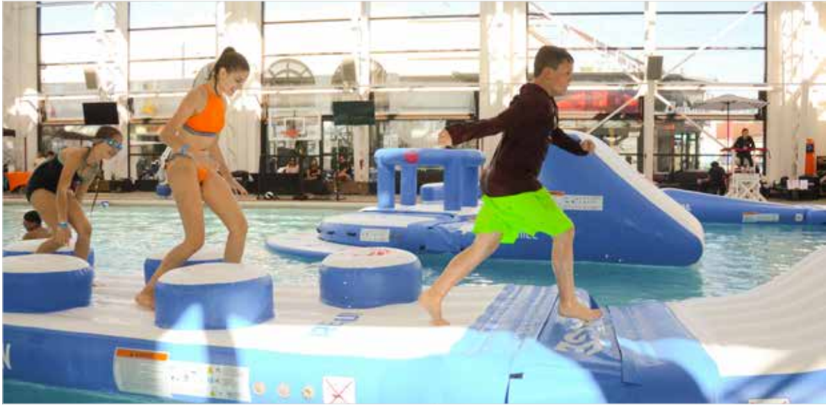
Kids run on the new floating obstacle course at Plunge San Diego in Belmont Park on Feb. 28.

Meinburg described one stretch of the new obstacle course called risky business. “It’s an up and down wave that guests will run up and over with a couple of little hills, then they come around and go through a tunnel and a wiggle