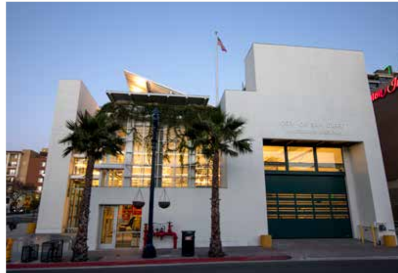
Bayside Fire Station 2, located at 875 W. Cedar St., is a three-story building with solar panels and a rooftop greenery.

The City's partnership with San Diego Community Power, which