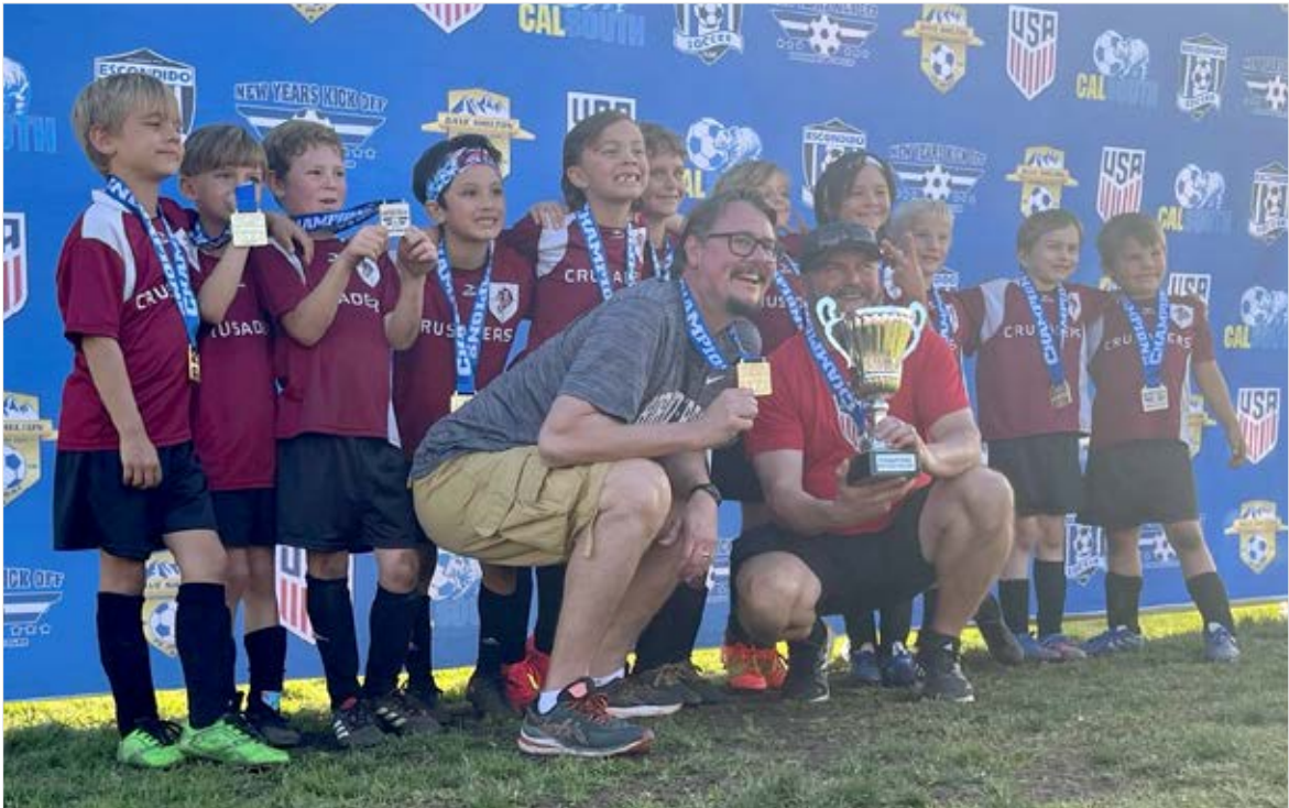
Three Crusaders Soccer Club All-Star Teams captured division crowns at the recent January Kick Off Soccer Tournament.