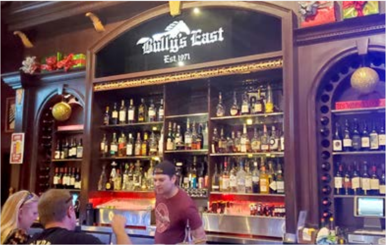
Dating back to its opening in 1971, some things have changed at Bully's East in Mission Valley. Some things that have not differed are quality meals, drinks and service.

—Robin Dohrn-Simpson is a local food and travel writer. Reach her at: robindohrnsimpson.com .