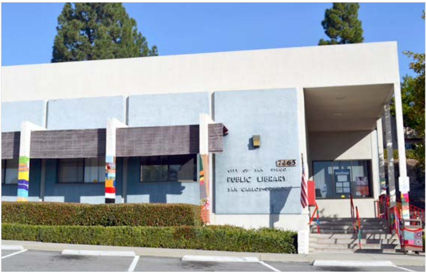
The San Carlos Branch Library will play host to the Jan. 18 meeting of the San Carlos Area Council.