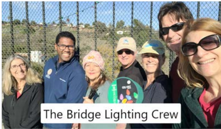
The Bridge Lighting Crew

This event included a performance by the Lewis Band, Holiday Readings by the Lewis