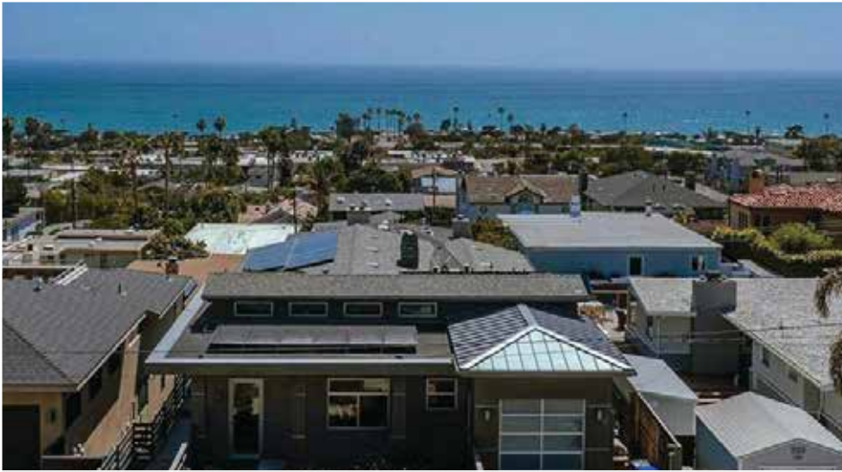
Cardiff, 5BR/5BA | $3,150,000 Info@WillisAllen.com | 619.226.7800