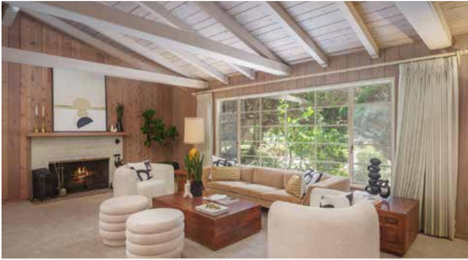
La Jolla, 6 BR + office /6 BA | $5,599,500 Nelson Brothers Team | 858.215.3739 | DRE #01376023, 01801493