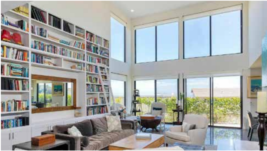
La Jolla, 4BR/4BA | $2,695,000 Info@WillisAllen.com | 619.226.7800