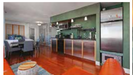
5027 Santa Monica Ave Unit A 2br/2ba Townhome 1/2 block to Tower 1. Low HOAs. Mixed use zoning! $899,000

SELLING SAN DIEGO 20 YEARS! CalRE# 01270748 www.NatalieHarris.com