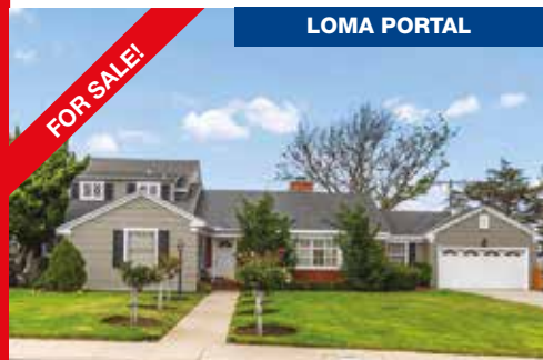
FOR SALE! 3118 Seville St. San Diego, Ca 92110 5 BR plus optional 6th BR | 3.5 B | $1,850,000 BEST VALUE IN POINT LOMA