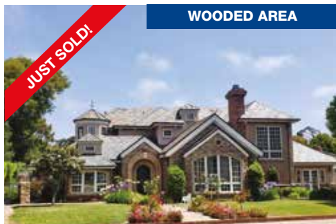
JUST SOLD! 3744 Rosecroft St. San Diego, CA 92106 5BD 5.5BA 4,652 SF. | $4,700,000