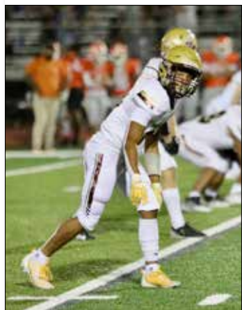
Point Loma Pointers rout Valhalla High SEE PAGE 11