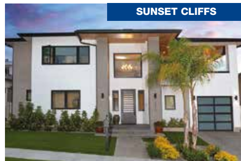
SUNSET CLIFFS 4515 Tivoli St. San Diego, Ca 92107 4 BR | 4.5 BA | 3850 SF | $5,395,000