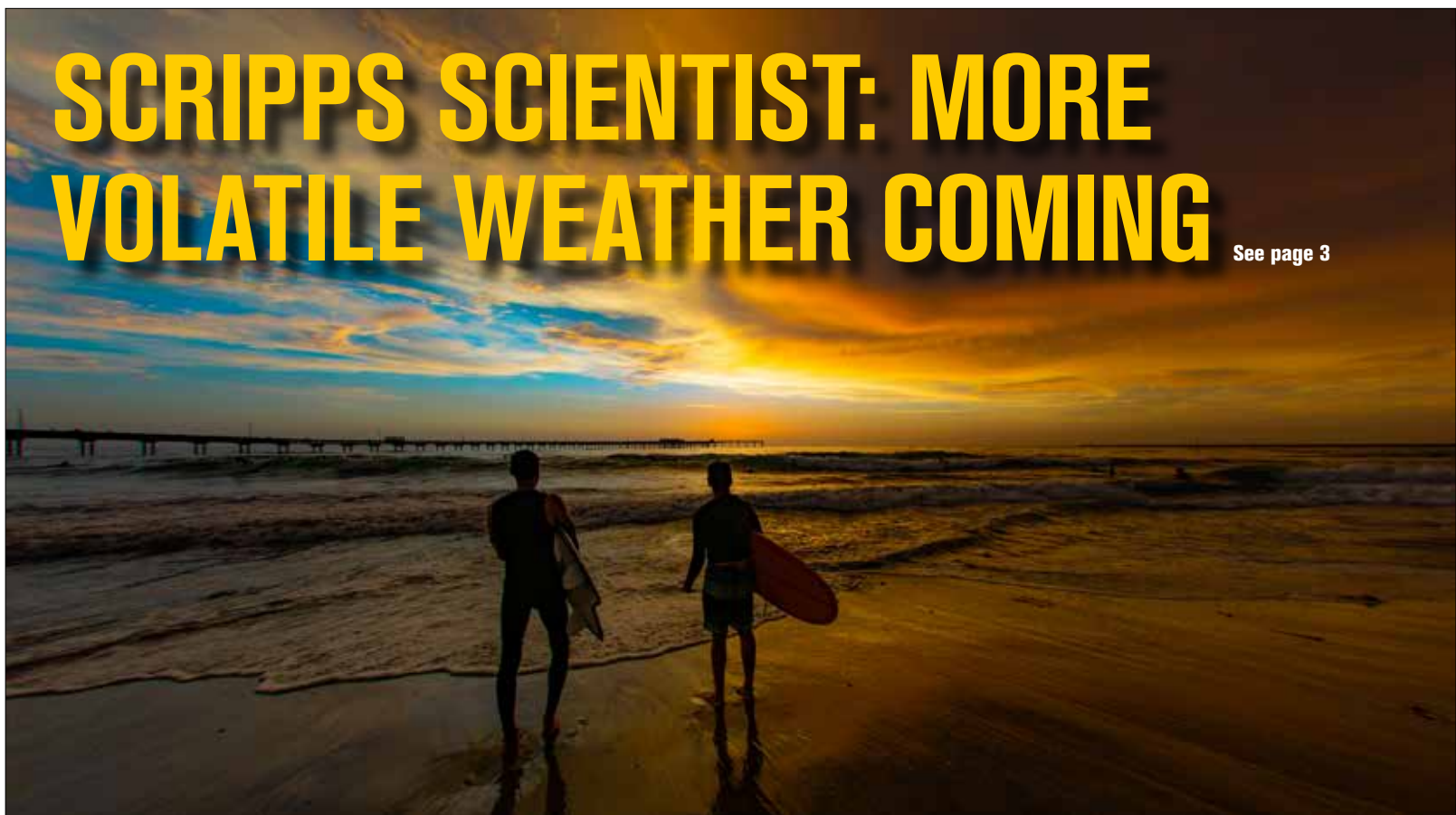
Two surfers check out the waves and some ominous clouds in Ocean Beach this summer.