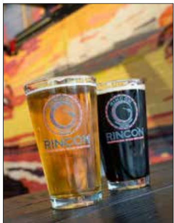
Fun and games at 3R Brewery in OB SEE PAGE 7