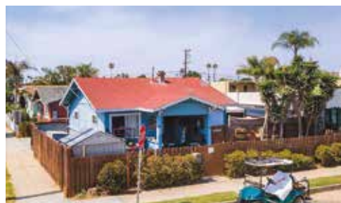
4903 Brighton Ave. Charming 2br/1ba home w private patio, 1 car garage. Steps to surf! $939,000