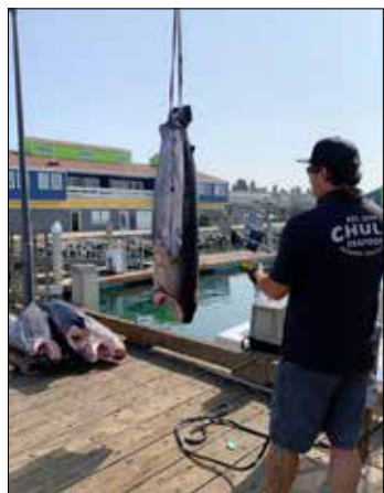
Chula Seafood thriving in Point Loma SEE PAGE 8