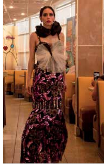
Sequin evening wear.

Afterward, rolling racks were wheeled out with MARALOVE clothing so that the audience could do some serious shopping with the artist. A hustle and bustle began and everyone had a