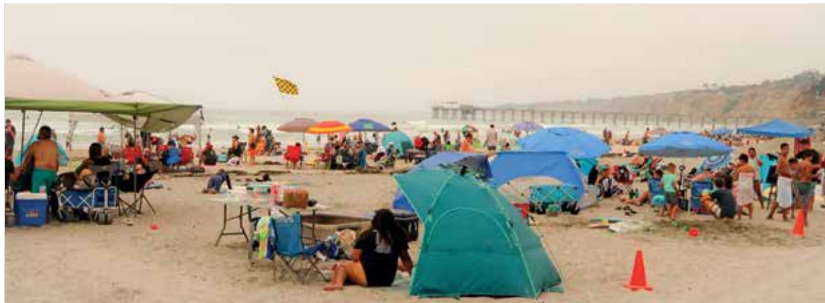
The youth camp at La Jolla Shores.