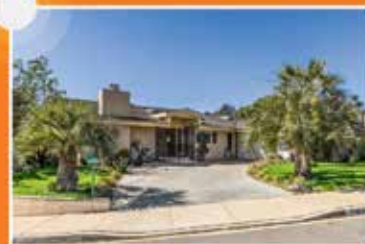
La Jolla Casa Fiesta Facility #374604425