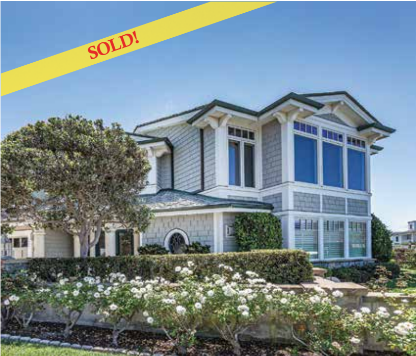
LA JOLLA Bird Rock: Unobstructed ocean views overlooking beachfront Calumet Park. Represented Buyer. 3+1 optional BD | 3BA | 3,368 SF | $4,700,000