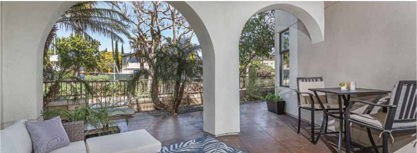
LA JOLLA Bird Rock: Beautifully appointed corner unit with oversize patio for entertaining in the Seahaus development, just steps from the beach. 2 BD | 2 BA | 1,769 SF | $1,598,000