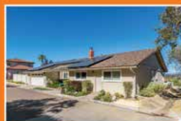
La Jolla Vista Facility #374604421