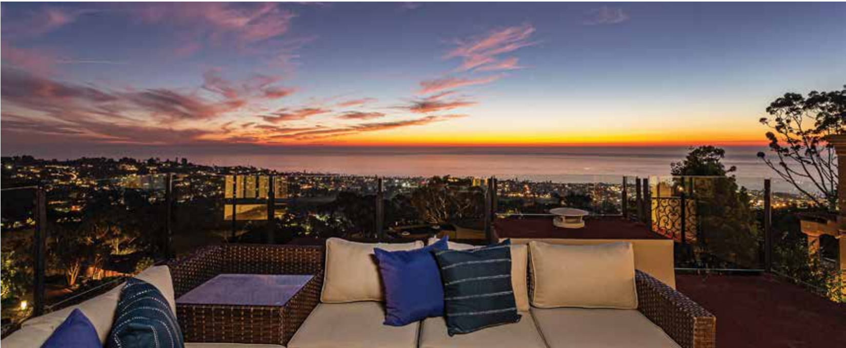
LA JOLLA Country Club: Landmark Henry Hester estate home with dual primary suites and guest quarters, infinity pool and panoramic ocean views. 4 BD + Casita | 5.5 BA | 7,459 SF | $5,995,000