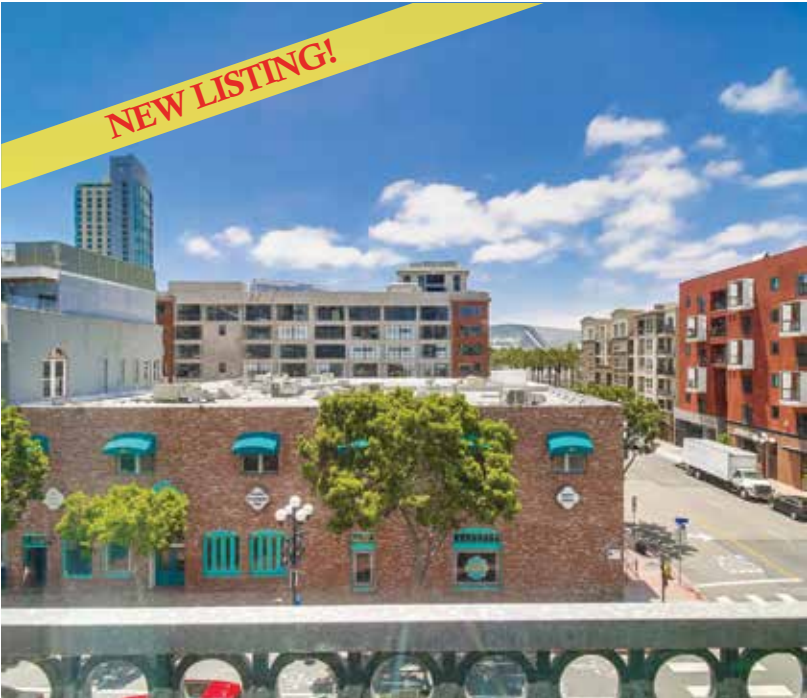
SAN DIEGO: Enjoy True urban living in the iconic Gaslamp Quarter! Southwest-corner unit w/2 assigned garage-parking spots. 2BD | 2BA | 1,013 SF | $750,000