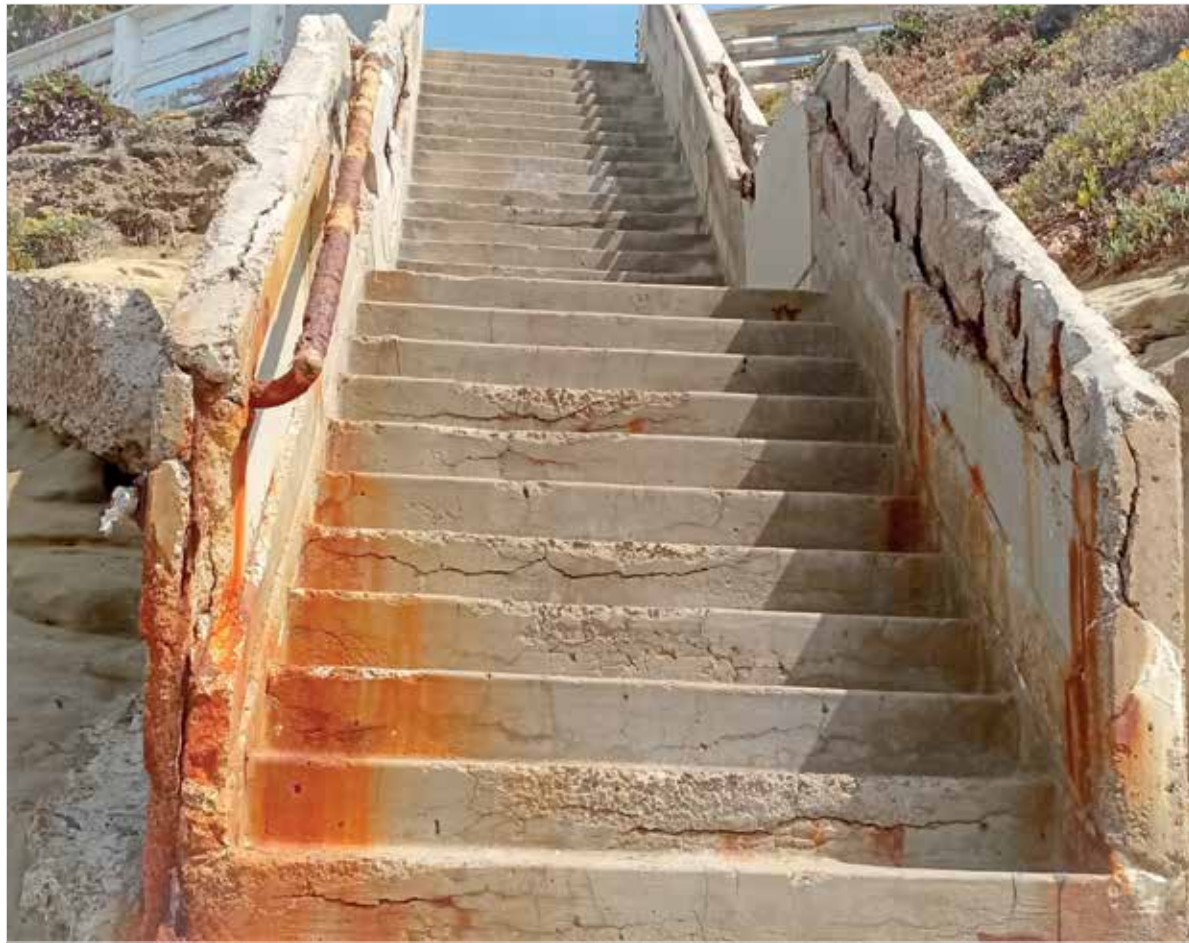
The stairwell to beach at Camino de la Costa in La Jolla is in rough shape.

The funding for the stairwell and other repairs came from the new $308 billion state budget signed June 30 by Gov. Gavin Newsom. Funding will serve a number of purposes at Camino de la Costa, from updating the design of the viewpoint there to staircase repair and improvements to the parking area of the viewpoint. The viewpoint is lacking appropriate striping for parking, no parking, and handicap zones.