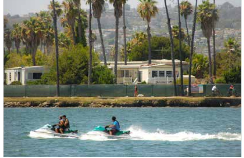
Jet skiers, a dog walker, and bicycle riders pass by the mobile homes at Point De Anza on the De Anza Cove peninsula.

the lowest inventory of affordable coastal accommodations in the state, and access is particularly scarce in the City of San Diego. In 2019, City access was further jeopardized when the former operators of the Mission Bay RV Resort at De Anza notified the City, with only a few months' notice, that they would be terminating their lease agreement that year.