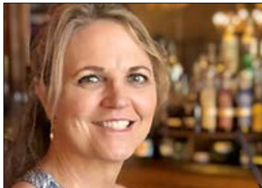
Students wind down school year. Page 4