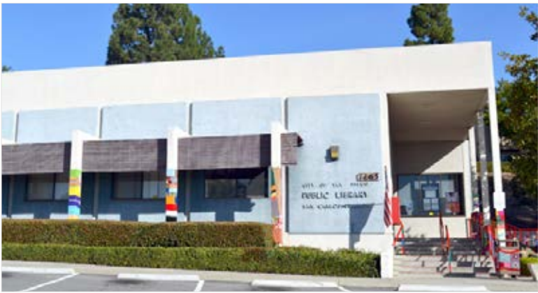
There is much to offer at the San Carlos Branch Library.

We will be hosting family friendly, in-person summer reading program events throughout the summer months, July to August, every Thursday at 10 a.m. The show locations will alternate between the San Carlos Branch Library