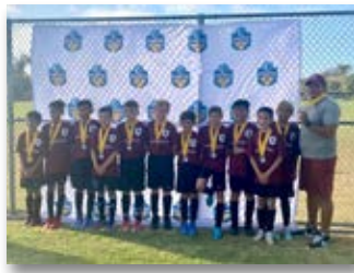
Crusaders netting more hardware. Page 13

Grantville • Allied Gardens • Del Cerro • Mission Trails • San Carlos • Fletcher Hills