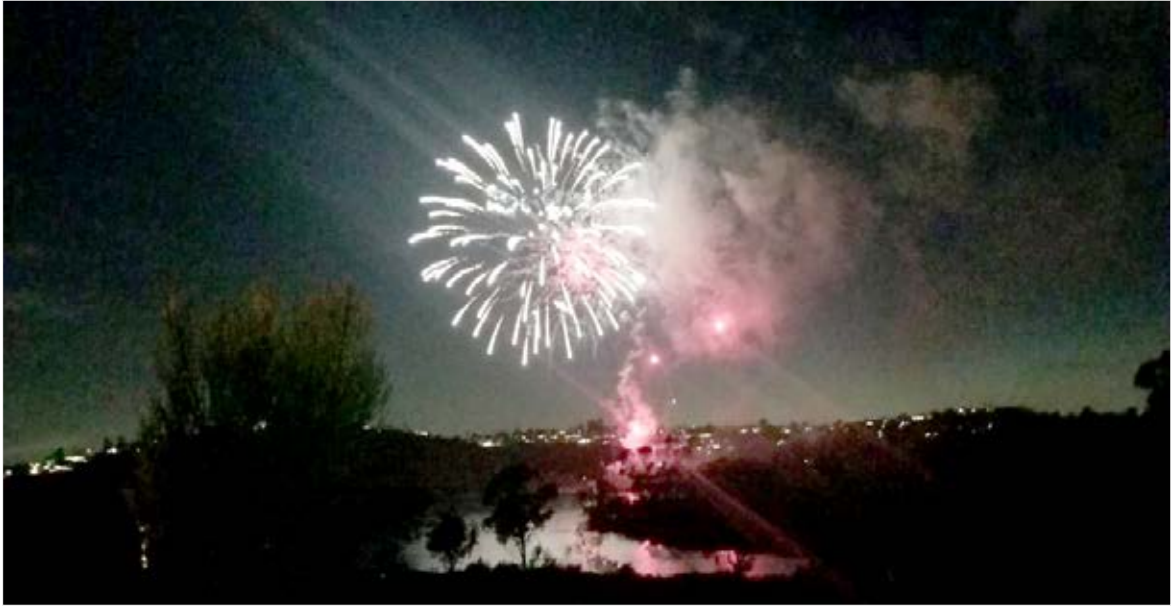
Fireworks lit up the night sky to end a terrific day in the Lake Murray area.

According to Jimmie Web, SDG&E vegetation management operational manager, the city hasn't announced where the next installment of trees will be planted, but once the City Heights and Allied Gardens planting is completed, the city will have fulfilled approximately 20% of the agreed plantings. According to Campillo, this plan and its expansion into other neighborhoods in San Diego are essential to combating environmental damage. "Expanding our urban forests in San Diego is critical in our fight against climate change. That is why I partnered with SDG&E and the City's Urban Forestry Department to plant over 300 trees in Allied Gardens," said Campillo. In addition to capturing carbon and improving air quality, Campillo highlighted that these trees contribute to energy savings, provided by shade, and stormwater runoff reduction. To learn more about the sustainability and mobility department managing this partnership, visit: sandiego.gov/sustainability . Editor's note: See related story on Page 9.