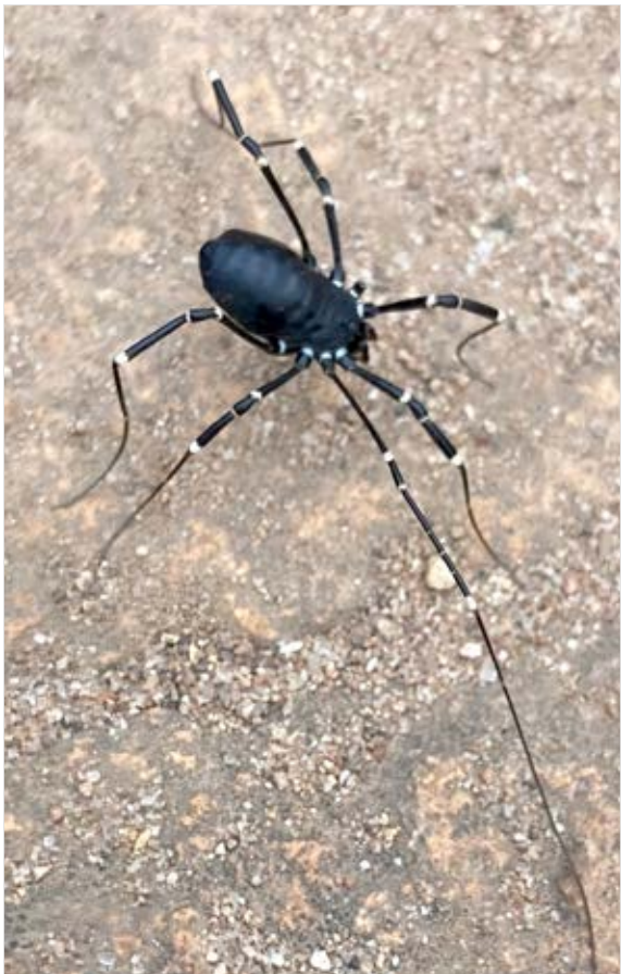
Have you spotted any harvestmen when you have been out and about?

Why the name harvestman? Most Opiliones species come out and wander in late summer or fall,