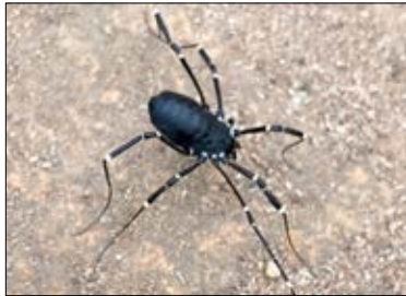
Don't call it a spider. Page 14