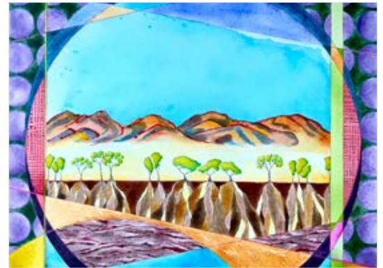
Roots Under 5 Peaks.

Layers of Nature expands the traditional landscape to include root systems, wood grain, geometric shapes, and plant textures, offering an opportunity to contemplate our