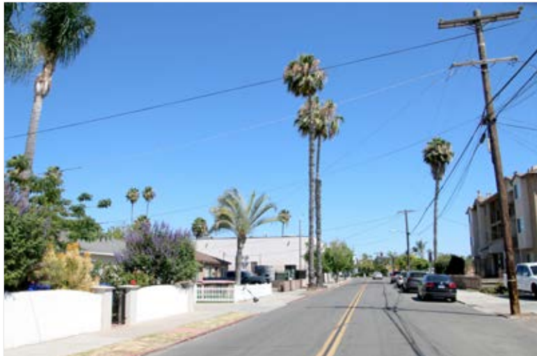
A shooting in the 4800 block of Art Street in the early morning hours of June 25 led to the death of a recent Grossmont High graduate.

VOTED #1 DISPENSARY IN SAN DIEGO 2021 SAN DIEGO READERS' BEST