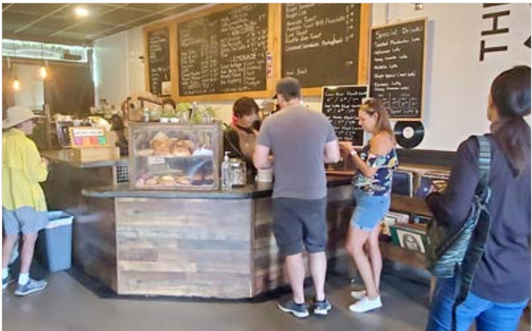
The Simple Coffee House is at 7407 Jackson Drive.

Grey, Coffee, Thai Green Tea, or Taro teas. If you want something different try one of the varieties of Lemonades such as Blue Raspberry, Arnold Palmer, Acai Berry Tea, Mango, Pineapple, or Peach. If you’re looking for a bite of food, besides an assortment of pastries, try an Avocado toast with or without Prosciutto. For something more substantial a ham and cheese croissant sandwich or an Acai bowl should hit the spot. Smoothie specials change regularly. Pina Colada, Strawberry Banana, Wild Berry, Mango, and Peach are currently on the menu. Located at 7407 Jackson Drive in the Navajo Jackson Center, come in, or phone in your order at (619) 888-4873. You can also order online through GrubHub, Seamless, or DoorDash. Rumor has it that the Viennese Coffee is popular with honey and cinnamon. Give it a try.