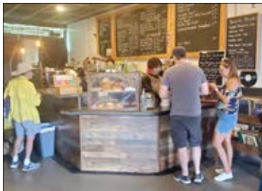
The Simple Coffee House serves up great tastes. Page 10