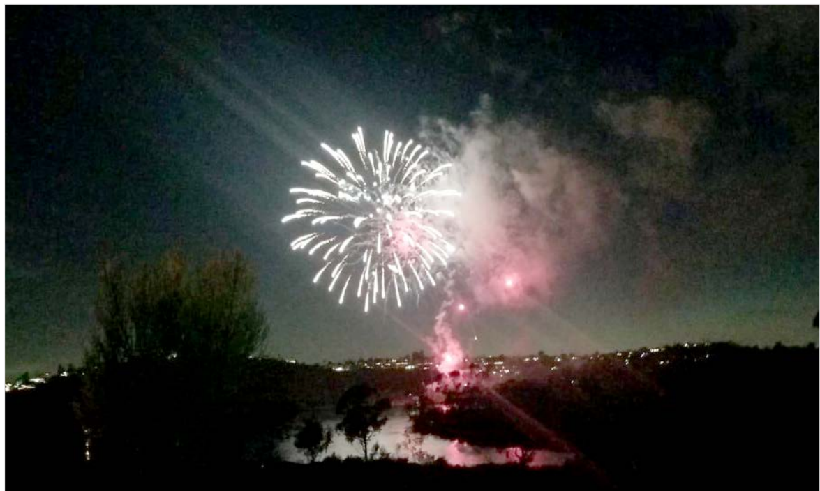
Fireworks returned to the Lake Murray area after a two-year absence due to COVID.