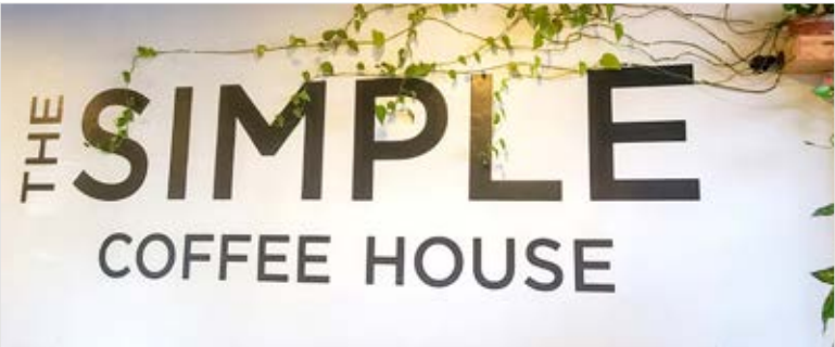
Have you visited The Simple Coffee House?

Elizabeth Tran moved here in 2019 and opened the shop. “It was anything but simple”, she said. The calming decor with plenty of green plants, the friendly staff, who are always willing to help. Many patrons have donated their “old-fashioned” record albums and return after the morning rush to choose a favorite song or album to listen to while enjoying a beverage. Enjoy your food and drink on their outdoor patio shaded with greenery walls that provide both shade and moderate privacy from the bustle of the shopping center. You almost can’t tell there are large box stores in the same