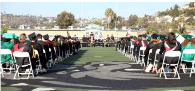
Helix Charter High School graduated a school-record 566 students earlier this month.

For 70 years, Helix Charter High School has established a reputation of excellence and high achievement in the arts, athletics, and academics and the Class of 2022 is no exception. This ceremony celebrated the largest graduating class in our history, with a total of 566 Highlanders. Two hundred and eighty eight wore platinum cords which represent that they earned honors with a cumulative grade point average above 3.5. Two hundred and fifty students with platinum caps have earned distinction for outstanding achievement through coursework or assessments indicating college readiness. Fourteen students with platinum tassels have demonstrated academic achievement through lifetime membership in the California Scholarship Federation, 78 graduates have earned designation in the program for bi-literacy, and 106 graduates have completed a career technical education pathway.