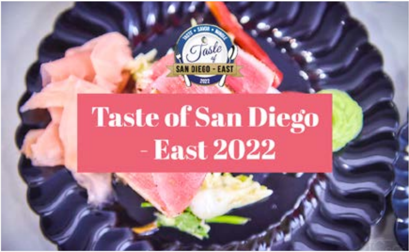
The 13th annual ‘foodie’ event is happening July 18 at Town & Country Hotel in Mission Valley.

Among the food and beverage lineup will be samples from Dream Dinners, Duke’s Old Fashioned Onion Burgers, Edible Arrangements, Extraordinair, Golden Spoon, Hooleys Public House, I-Que BBQ, Little Roman, Los Pinos Taco Shop, Marie Callender’s, Outback Steakhouse, Pick Up Stix, Ultimate Catering Concepts. For details or questions, call (619) 465-7700 or email: chamber@lamesachamber.com . Full event details can be found at: www.taste.lamesachamber.com .