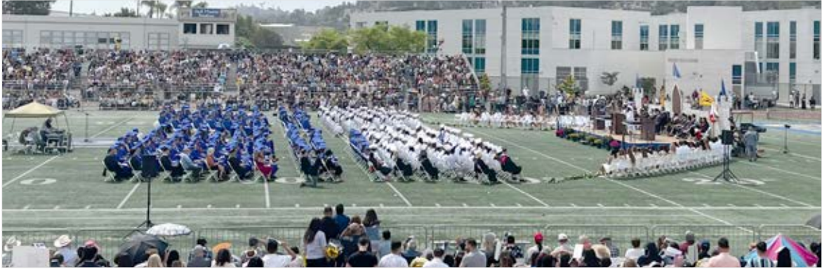
Grossmont High School graduated 471 students this year.