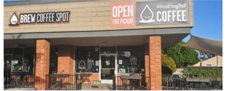
Brew Coffee Spot is at 6101 Lake Murray Blvd.