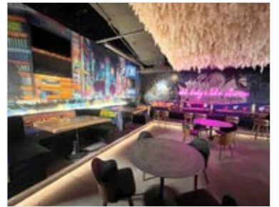
The tucked-away Shibuya Nights (Alternative Strategies)

The atmosphere lends itself to lamb lollipops, vegetables with to-fu, rum-infused dragon ball tea, and more.