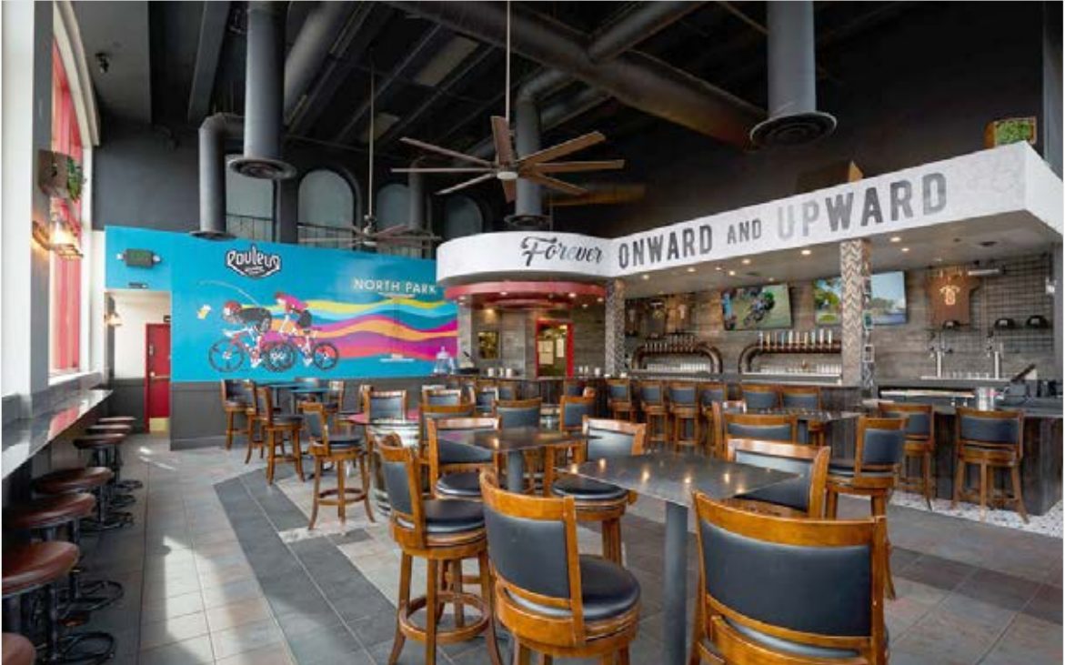
Inside Rouleur, which is a bike-themed bar inside the Observatory.

With a full belly and light head, I pointed the old Trek bicycle south and carefully headed home on the bike path with a smile on my face remembering all the brewers and patrons I met and stories they shared that make North Park a beer drinker’s dream. So drive, bike, take a bus, ride-share or walk, but get on up to North Park and enjoy the brewery scene. You’ll be happy you did.