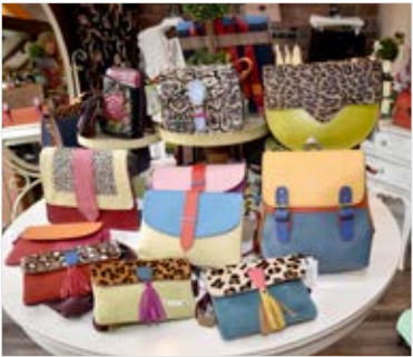
One of a kind leather handbags by Soruka