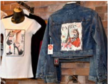
Jackets by Timmy Woods