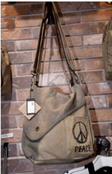
Recycled military tents by Vintage Addiction

June 5, 2022 — San Diego Swim Week Collective — Network, shop and celebrate at The Inn at Rancho Santa Fe from 1-4 p.m. on June 5. For tickets visit: bit.ly/3z652TZ