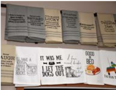
Mona B Towels