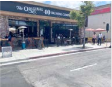
Mike Hess Brewing, North Park Beer Co. and the Original 40 were all stops in the beer tour.