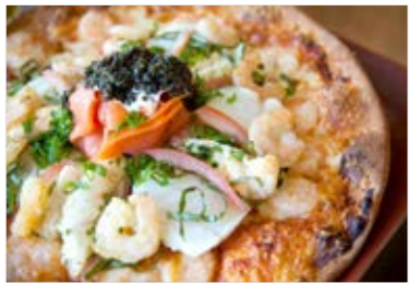
San Diego's priciest pizza is 'The Forty Five.'

Hailing from Vancouver, Canada is Steveston Pizza , which opened recently in the quaint bungalow formerly occupied by Empirehouse Urban Palate .