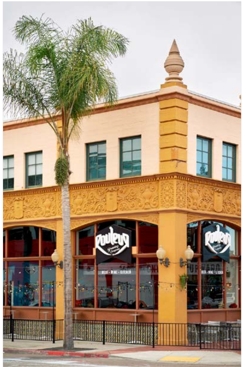
Rouleur is inside the observatory building.