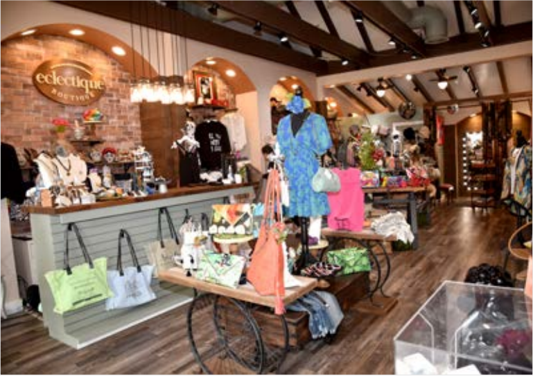
SEE ECLECTIQUE BOUTIQUE, Page 13 Inside of the store