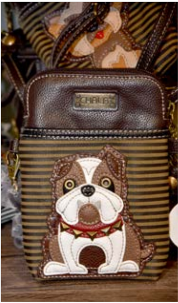
Chala Handbags