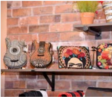
Crossbody Beaded Handbags by Mary Frances