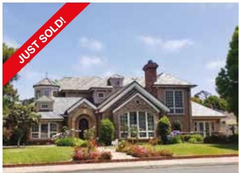
3744 Rosecroft St. San Diego, Ca 92106 5BD 5.5BA 4,652 SF | $4,700,000