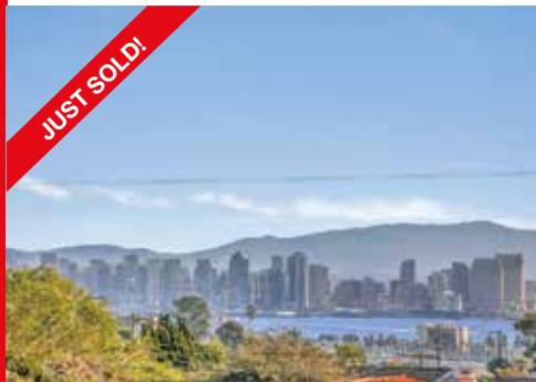
1760 Warrington St. San Diego, Ca 92107 3BD 2BA 1,676 SF | $1,750,000