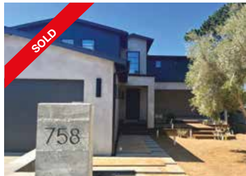
758 Cordova, San Diego, Ca 92107 5 BD, 7 BA, 4052 SF | $4,500,000