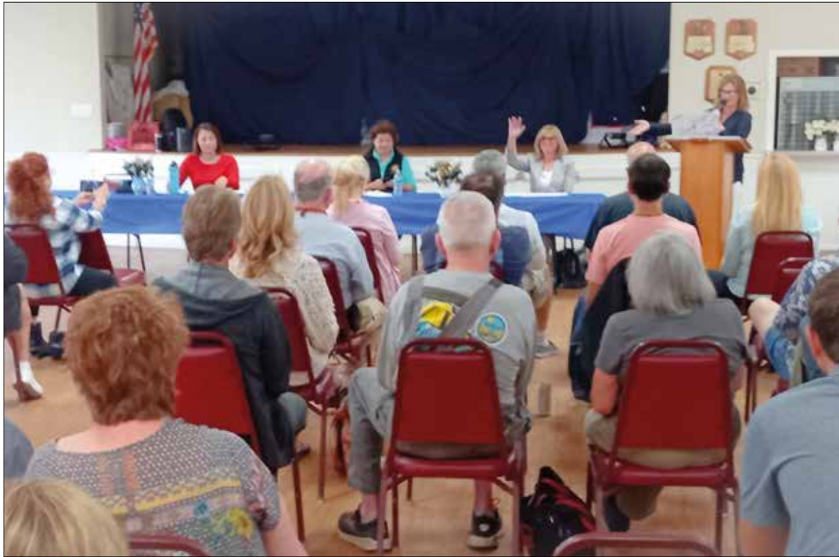
Three District 2 Council candidates fielded audience questions at an Ocean Beach/Point Loma community town hall meeting at the Masonic Center on May 31.