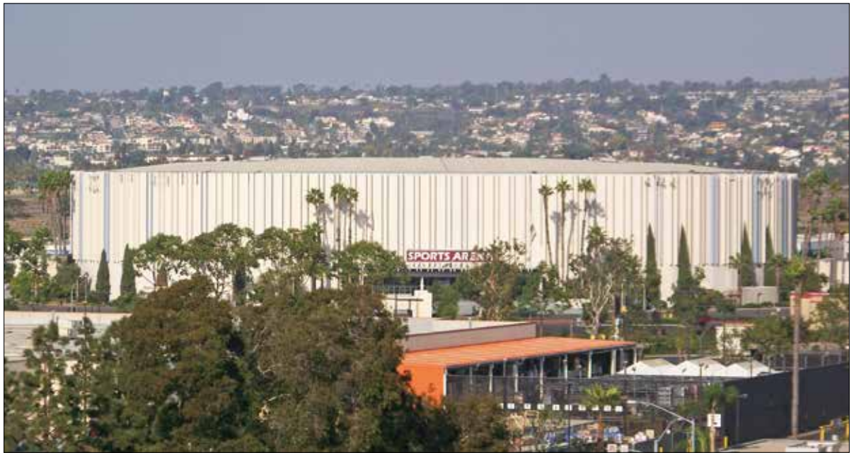
The former Sports Arena – now Pechanga Arena – site will be redeveloped with a new arena, parks, and housing.

Compass is a real estate broker licensed by the State of California and abides by Equal Housing Opportunity laws. License Number 01527365. All material presented herein is intended for informational purposes only and is compiled from sources deemed reliable but has not been verified. Changes in price, condition, sale or withdrawal may be made without notice. No statement is made as to accuracy of any description. All measurements and square footages are approximate.