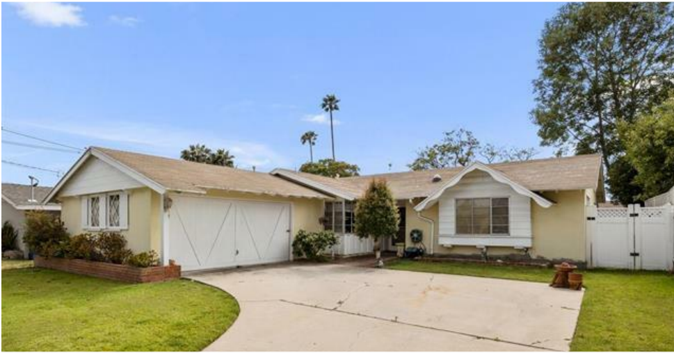
Clairemont, 4BR/2BA | $998,000 Info@WillisAllen.com | 619.226.7800