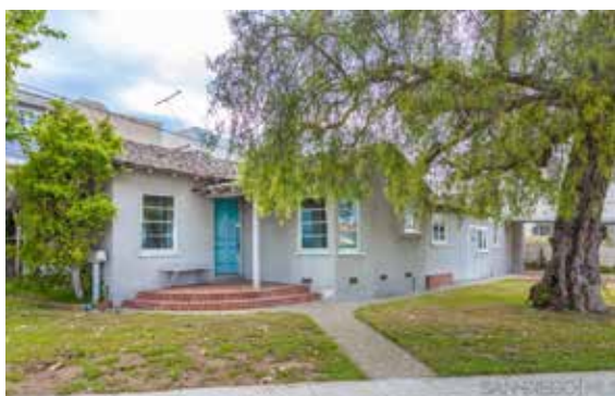
3810 Crown Point Drive 2 BD 1 BA 1112 SF $1,560,000