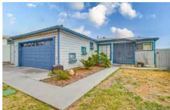
1643 Beryl Street 3 BD 2 BA 2151 SF $1,625,000

Are you an Executor or Trustee selling Estate or Probate Property?