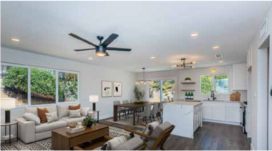
La Mesa, 3BR/2BA | $899,900 Info@WillisAllen.com | 619.226.7800