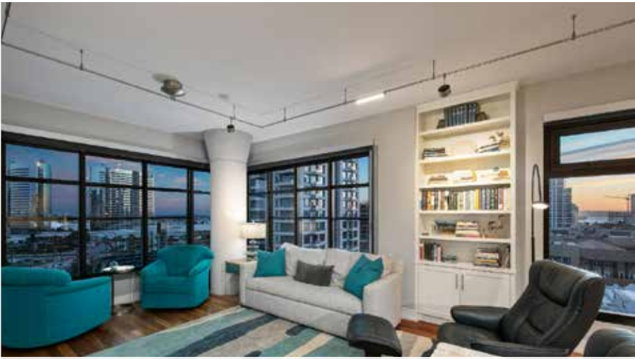
Downtown, 2BR/3BA | $1,120,000 Info@WillisAllen.com | 619.226.7800