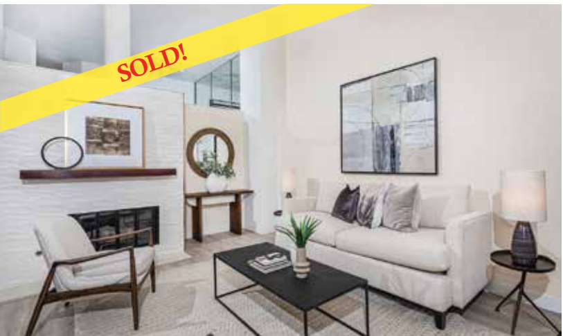
UNIVERSITY CITY University Town Square: Remodeled, 2 car attached garage, across from Westfield mall, and short bus ride to UCSD. 3 BD | 2.5 BA | 1,886 SF | $1,398,500