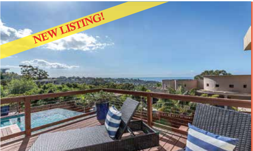
LA JOLLA Country Club: Exquisite hillside estate with dual primary suites and guest quarters, infinity pool and panoramic ocean views. 4 BD + optional & casita | 5.5 BA | $6,959,000