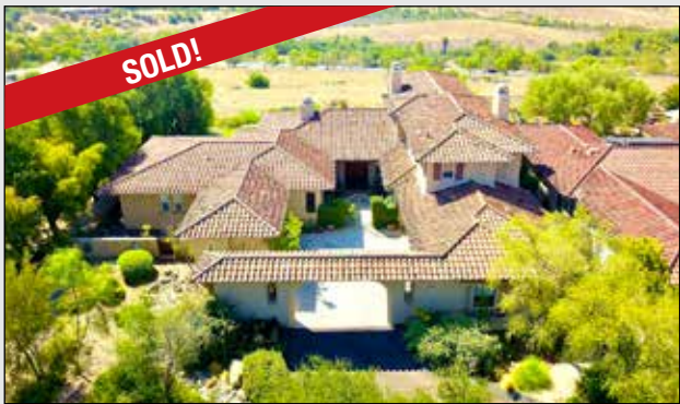
7817 Doug Hill Crt, San Diego CA 92127 Represented Buyer/ Seller $2,500,000

You are just steps from the sand! Unbelievable opportunity to buy into a building that will be completely reimagined and upgraded paid for by the Sellers. Coast Blvd has historically been one of the prestigious addresses in the nation. Now with the modernizing upgrades, your clients can have it all! They can move into a stunning, upgraded unit, and see the Pacific Ocean from their living room balcony. Amenities include 2 saunas, jacuzzi, and a large year around heated pool. There is a historical designation pending that could boost the value further in the future. This is a jewel within the jewel that is Coast Blvd La Jolla.