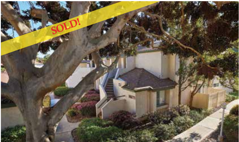
LA JOLLA La Jolla Terrace: Upgraded top-floor unit, ideal for UCSD medical pros and students! 2 BD | 1 BA | 822 SF | $825,000