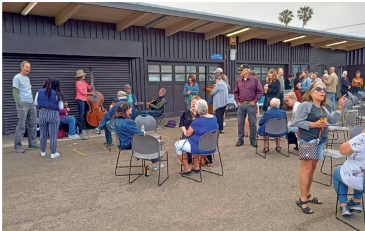
The Compass Station's opening in Pacific Beach was well attended.

Blanton pointed out the creation of a new hands-on service center for the unhoused has evolved from initially providing meals at local churches, then connecting guests with other wrap-around services. The Compass Station,