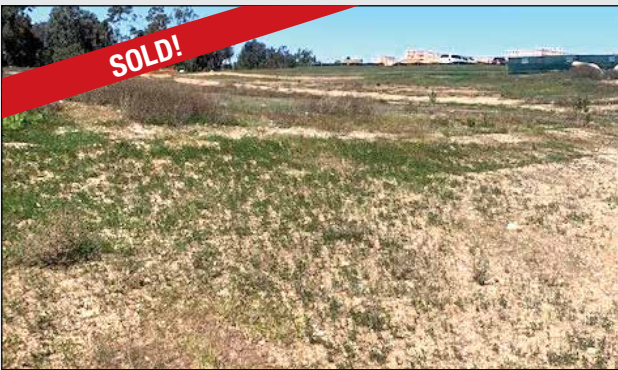
Calle Montana Lot 8, San Diego CA 92127 Represented Buyer/ Seller $2,100,000