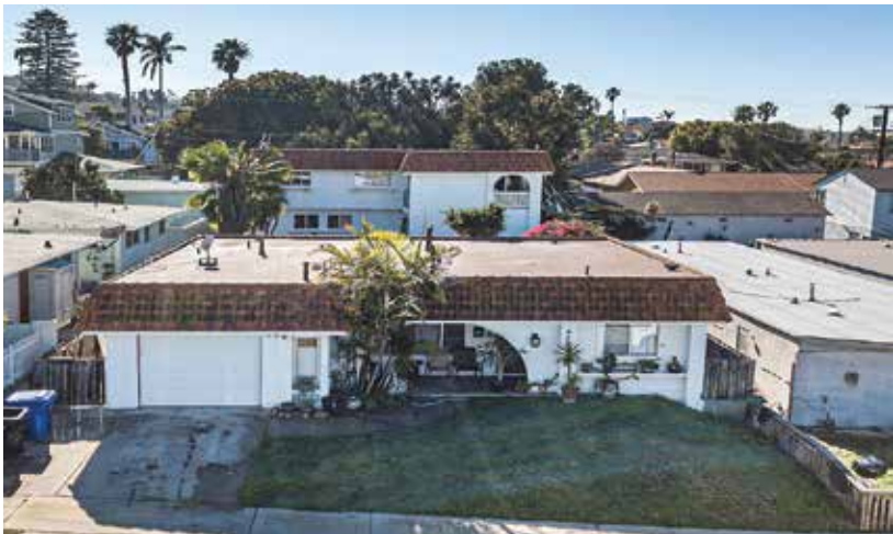
SAN DIEGO Ocean Beach: Opportunity Knocks! 2 residences w/private yards & 5 garages; easy walk to OB beach & pier. 2 BD/2BA is 1,082SF | 3 BD/2BA is 1,218 SF | $2,500,000