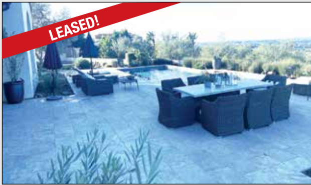
7867 Sendero Angelica, San Diego, CA 92127 Represented Buyer/ Seller $25,000