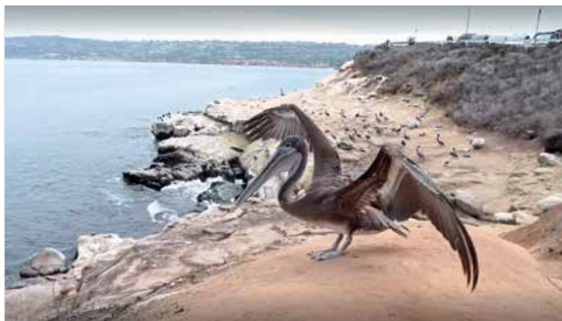
This pelican was rescued and rehabbed by SeaWorld and then returned to La Jolla.