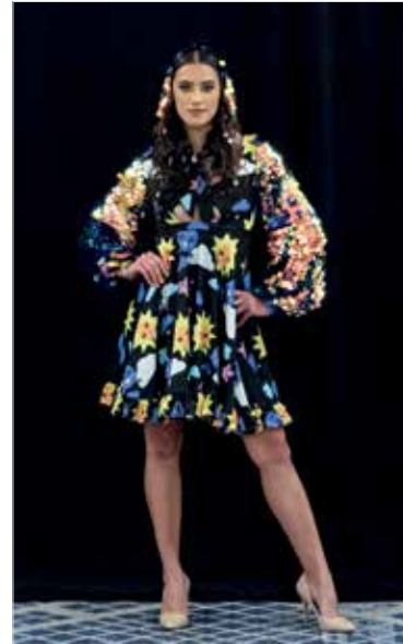
Designer ODD Bird Designs.