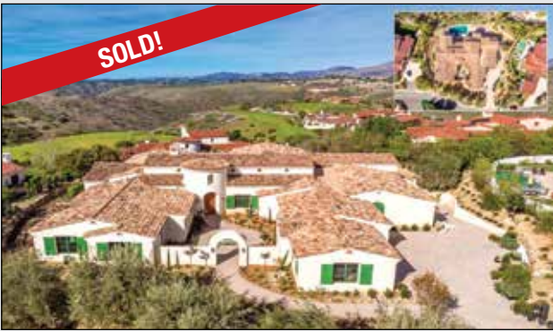
14934 Encendido, San Diego, CA 92127 Represented Buyer/ Seller $4,400,000