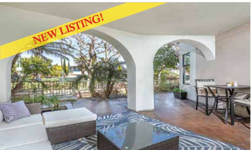
LA JOLLA Bird Rock: Beautifully appointed corner unit with oversize patio for entertaining in the Seahaus development, just steps from the beach. 2 BD | 2 BA | 1,769 SF | $1,598,000