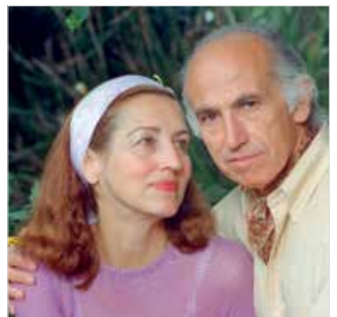
Françoise Gilot and Dr. Jonas Salk, La Jolla, 1976 This photo is a rare permission, granted just for this column!