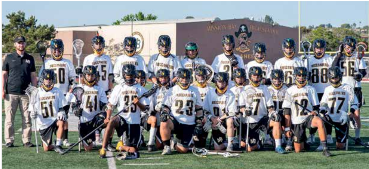
The Mission Bay boys lacrosse team.