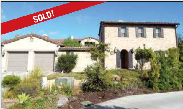
7778 Tierra Tesoro, San Diego CA 92127 Represented Buyer/ Seller $1,800,000