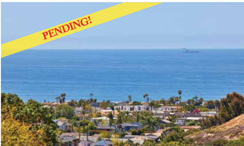
LA JOLLA La Jolla Alta: Oasis-like hideaway with ocean views, chef's kitchen, and hard wood floors. Seller will entertain offers between list range. 3 BD | 3 BA | 2,428 SF | L.P. $2,350,000 - $2,550,000