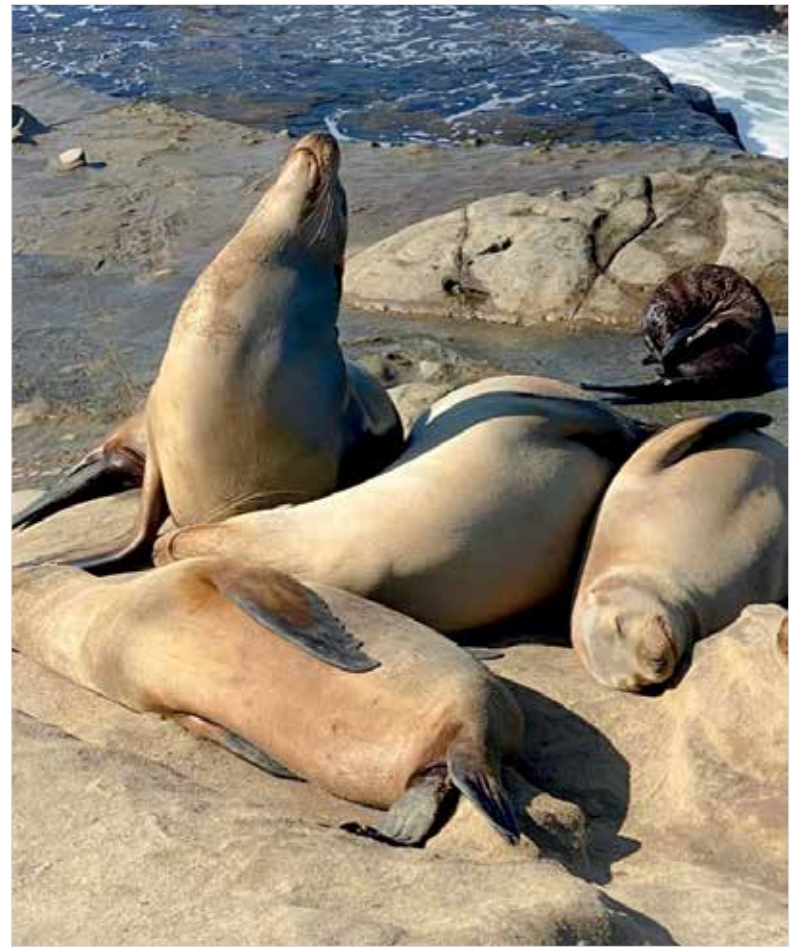
Sea lions at Point La Jolla.