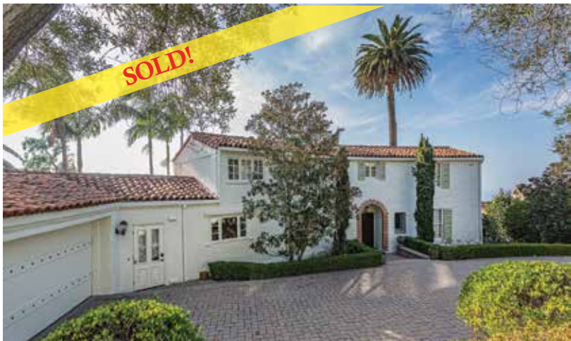
LA JOLLA Country Club: Estate home designed by legendary architect Tom Shepherd to showcase mesmerizing view over golf course to Pacific Ocean. 4 BD | 3 BA | 2,798 SF | $4,777,500