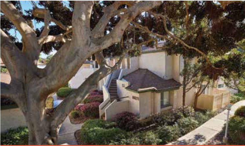
LA JOLLA La Jolla Terrace: Upgraded top-floor unit, ideal for UCSD medical pros and students! 2 BD | 1 BA | 822 SF | $725,000