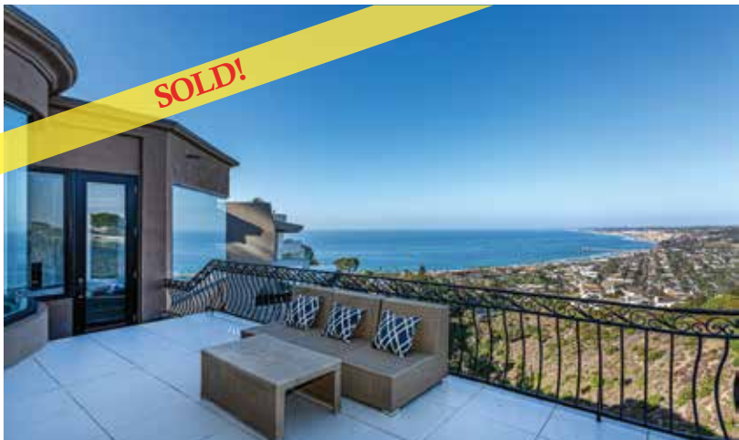
LA JOLLA Country Club: Private, gated estate with patios facing panoramic north shore ocean views for ultimate entertaining! 5 BD | 5 full + 2 half BA | 6,246 SF | $4,600,000