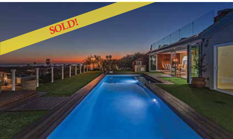
LA JOLLA La Jolla Alta: Majestically set for panoramic ocean views from living area expanse, backyard play space & rooftop patio. 3 BD | 3BA | 3,292 SF | $3,900,000