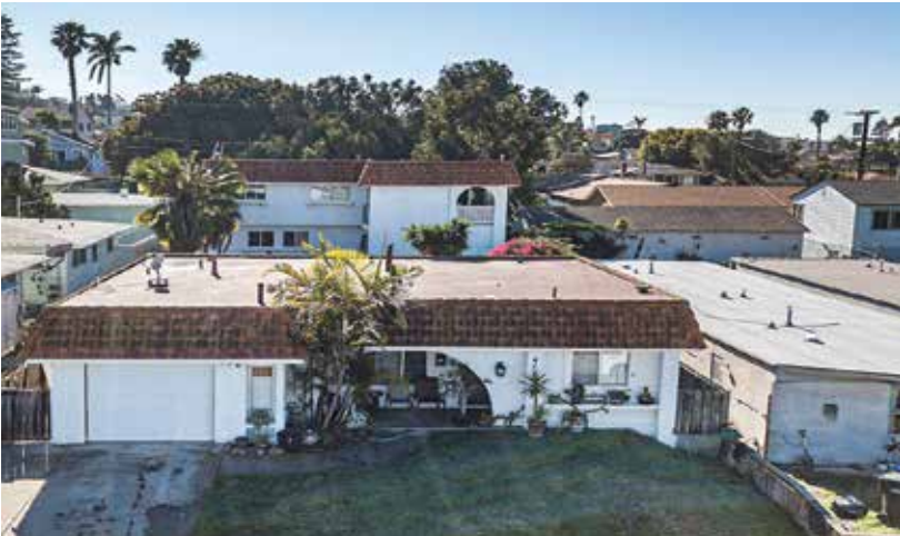
SAN DIEGO Ocean Beach: Opportunity Knocks! 2 residences w/private yards & 5 garages; easy walk to OB beach & pier. 2 BD/2BA is 1,082SF | 3 BD/2BA is 1,218 SF | $2,500,000