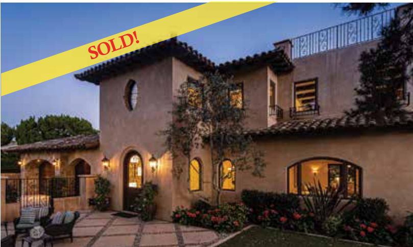
LA JOLLA Muirlands West: Grand & elegant estate on near-1/2-acre lot w/ panoramic roof-top view. 4+ BD | 5 BA | 4,309 SF | $4,600,000