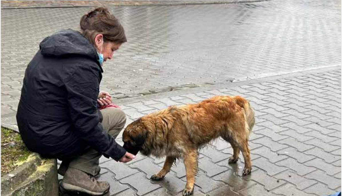
A staff member feeds a stray dog. Some animals had to be left behind, not because people didn’t want to bring them, but because authorities have stopped the migration of large dogs across the border.