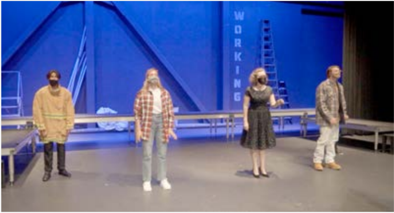
Students wearing masks prepare for a performance.

Katie Pipes, chair of the performing arts department, noted she has more than 100 students involved in the dance program. “I started in January of 2007 with 26 students and we have grown so much over the past 15 years,” Pipes commented. Currently, Pipes is preparing the dancers for a spring Storytime production May 5-7 centered on children’s stories. “There will be dances choreographed by faculty and students,” Pipes said. “This is a really fun show that will feature all styles of dance including jazz, hip