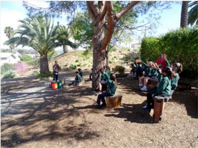
St. Martin of Tours Academy students learn the value of recycling at a recent presentation.