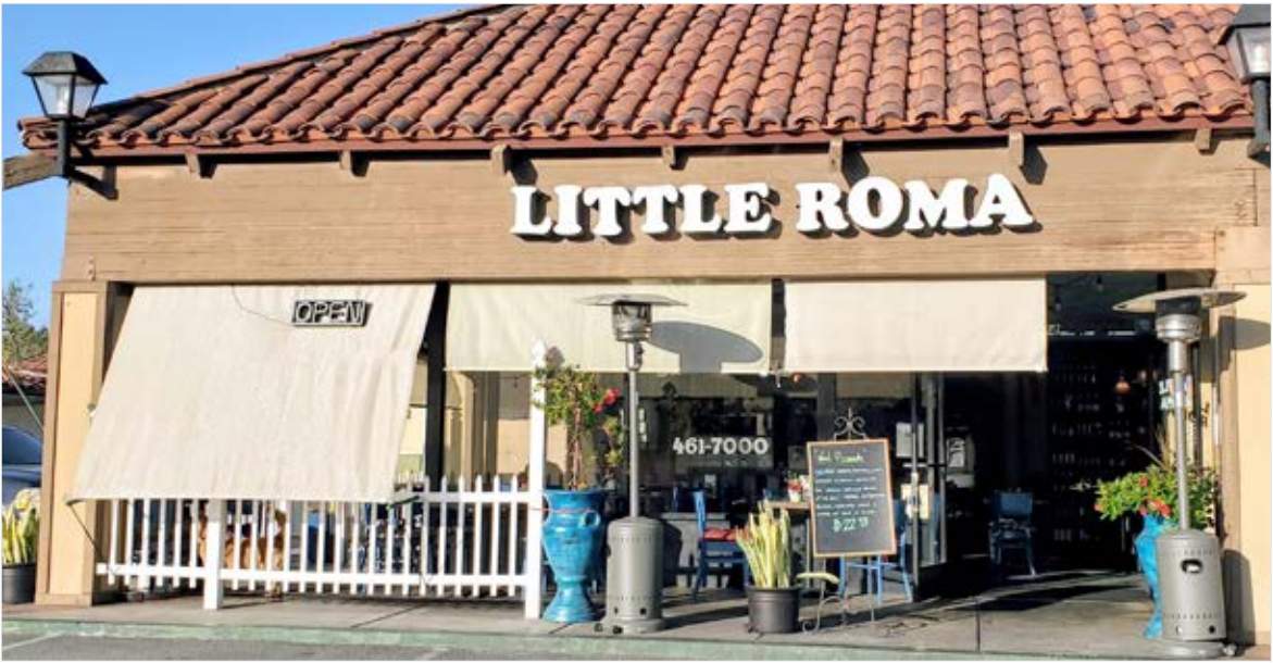
Little Roma's exterior