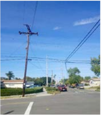
Power lines in La Mesa

For many people, looking at their electric bills these days there is some angst. Now, La Mesa residents have the opportunity to take advantage of San Diego’s community community choice aggregation program that not only generates renewable power but could also lead to lower bills over time.