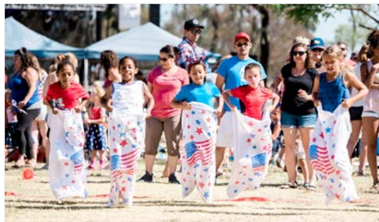
Kids race at a previous event.

The biggest challenge each year is funding expenses like fireworks, the music stage, security