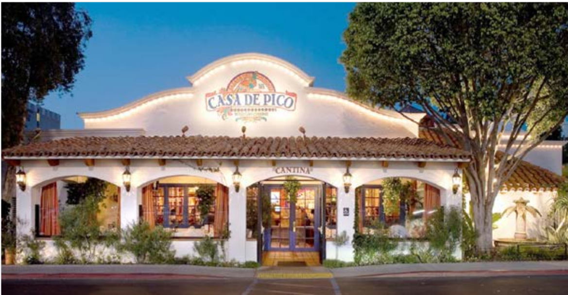
Casa de Pico offers lots of space and a bustling dining experience.