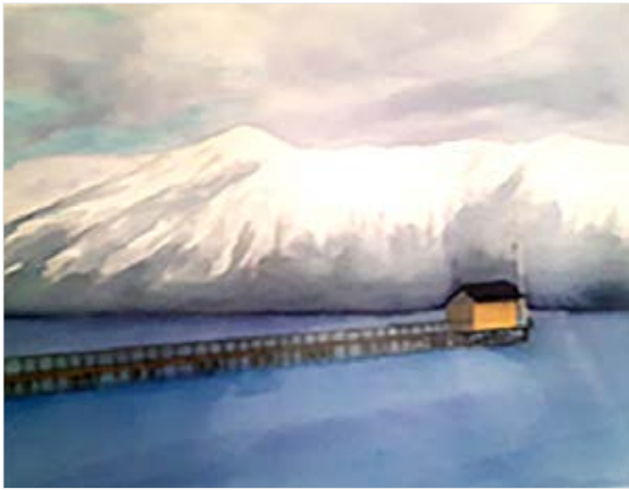
“Solitude” by Tom Kilroy