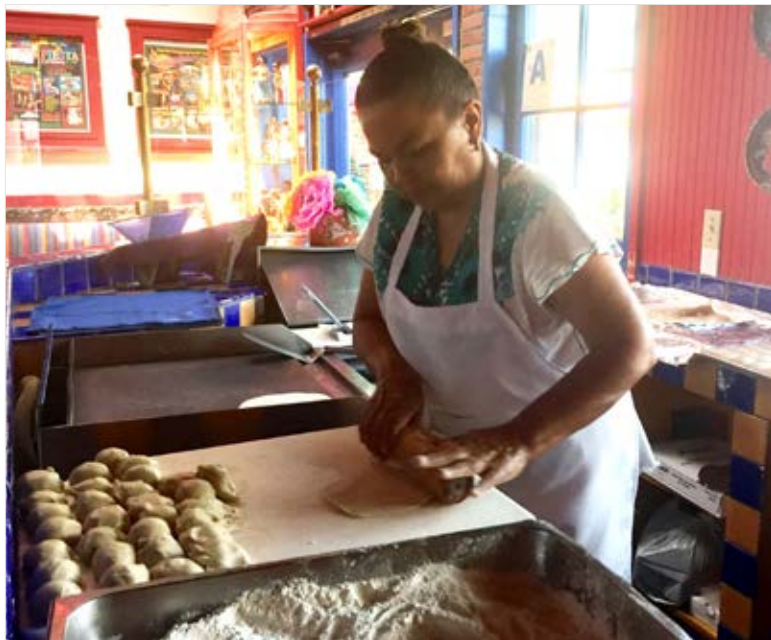
The restaurant makes both flour and corn tortillas in-house.

Casa de Pico boasts one of the largest outdoor patios in La Mesa for eating and drinking. It seats 115 guests. Inside, fiesta-style décor flows attractively throughout various dining areas, including a bright, windowed section resembling a solarium. The property in total has a 500-seat capacity.