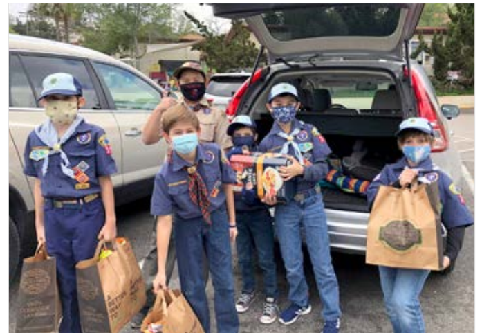
Cub scouts carrying food donations.

The drive-thru drop off location is at St. Andrew's Episcopal Church (4816 Glen Street, La Mesa).