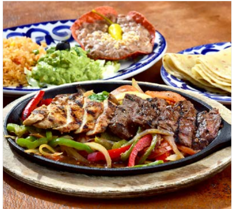
Famous fajitas

Although she added, "We find that everyone has their favorite items, and we are continually testing our food to make sure we're always offering the best, and that all our dishes are made with the freshest, in-season ingredients."