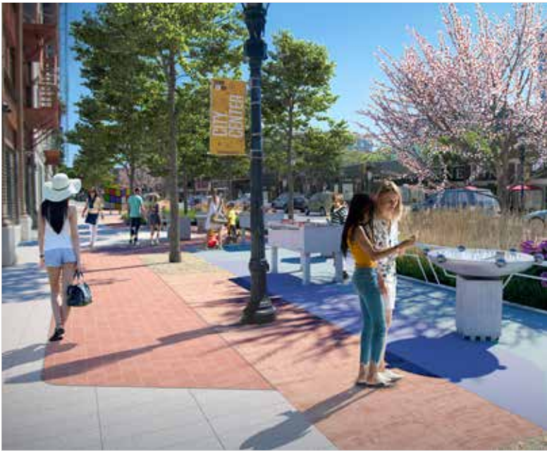
E Street will be pedestrian friendly. (Renderings courtesy Schmidt Design Group)

The E Street Greenway is located between Horton Plaza and Interstate 5, starting on 4th Ave. and ending on 16th St. It is divided into two segments: The East Village District and the Gaslamp District. Each district's unique flavor will be honored through streetscape and urban design.