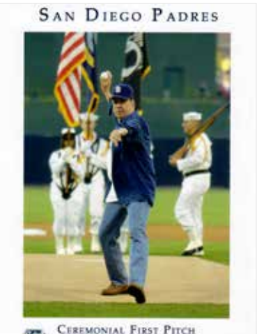
Neuman delivering a first pitch