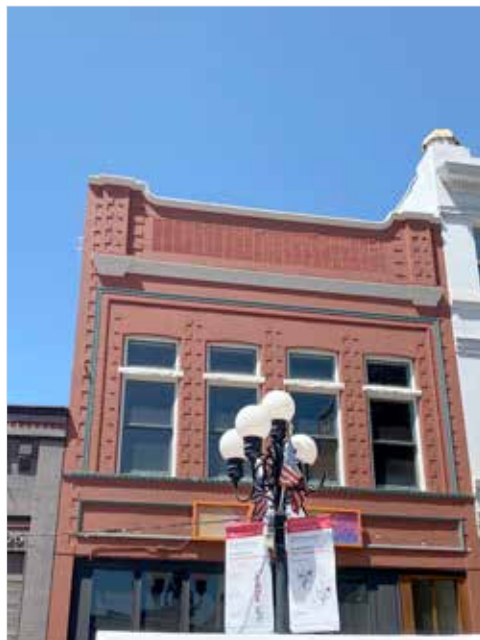
The Dunham Building

In 1888, the present building located at 750-52 Fifth