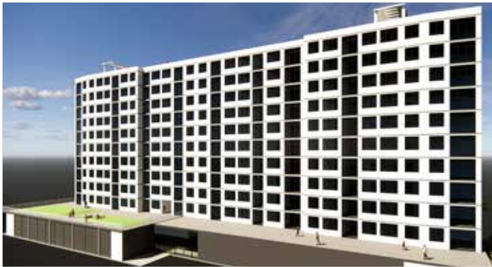
A rendering of the apartment building that can accommodate 190 individuals and families.

—Reach Kendra Sitton at kendra@sdnews.com .