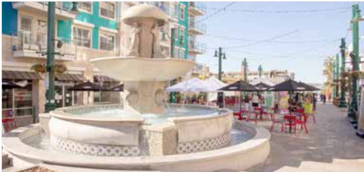
The Little Italy fountain