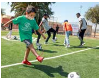
SD Loyals supports kids