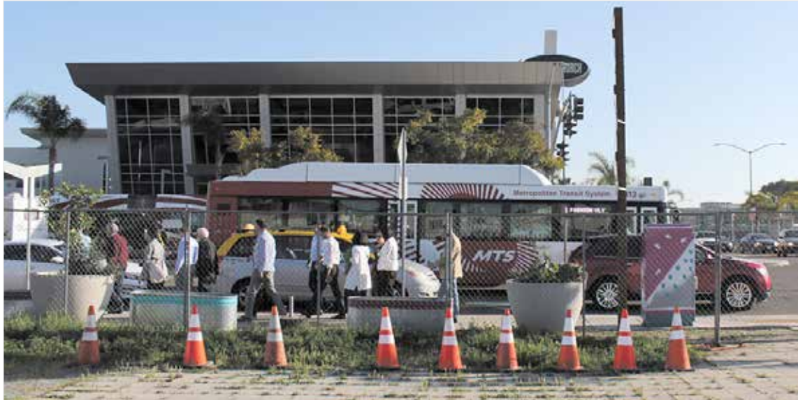
A view from inside the currently vacant lot of the City Heights Transit Plaza.