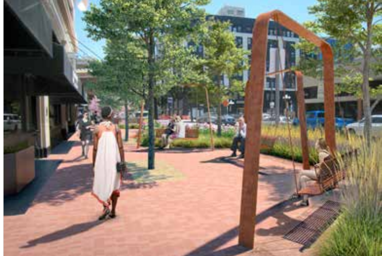
Rendering of a pedestrian walkway on E Street.