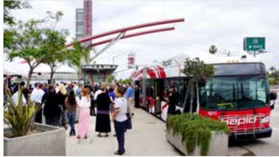
Grand opening of the Bus Rapid Center Line in early 2018 located on the decks above the I-15 next to Bridgedeck project.

"San Diego needs to have affordable homes for everyone. This project is a perfect example of what we need—housing that is accessible to transit and financially within reach for low-income and working San Diegans. I look forward to seeing more projects like this come to District 3 and throughout all of San Diego so that we can ensure housing