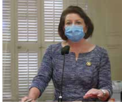
Sen. Toni Atkins

Thank you to Governor Newsom for leading California to one of the best vaccination rates in the nation. Thank you to the California Assembly for advancing SB 9 and SB 10 and other parts of the Senate's vital Housing Package. Thank you to the families, community groups, and law enforcement for banding together to improve accountability and outcomes in public safety. Thank you to the California businesses who understand the urgency of climate change and recognize the benefits that behavioral changes can bring to their bottom line.