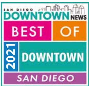
Vote for local businesses