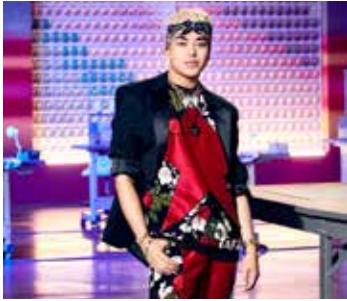
SD's Project Runway contestant