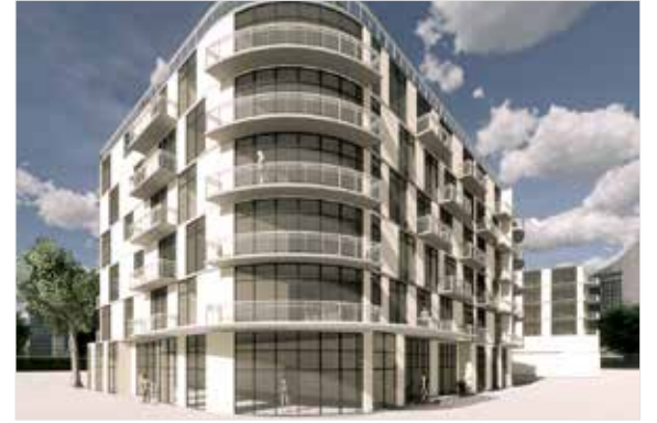
Architectural rendering made in 2020 of the project.