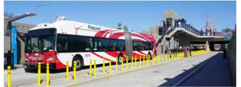
Grand opening of the Bus Rapid Center Line in early 2018 located on the decks above the I-15 next to Bridgedeck project.

"We were delighted to be able to use finance as a tool for change