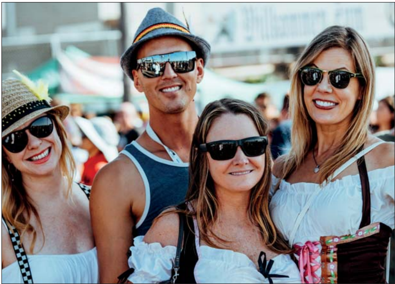
Ocean Beach Oktoberfest will take place Friday and Saturday, Oct. 8-9.