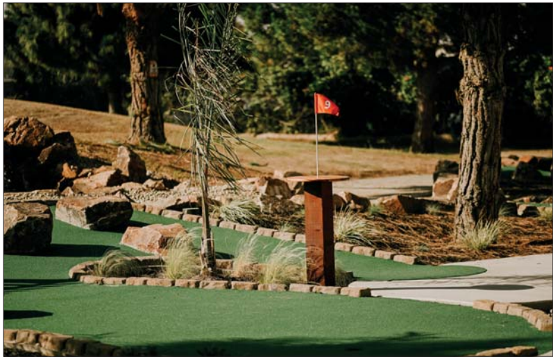
The Gator Course opens at 11 a.m. and takes about 25 to 35 minutes to play.