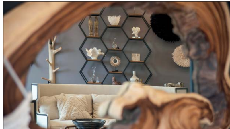
La Galleria has established itself as a destination for artfully crafted gifts, decor, jewelry, custom water features and floral designs.