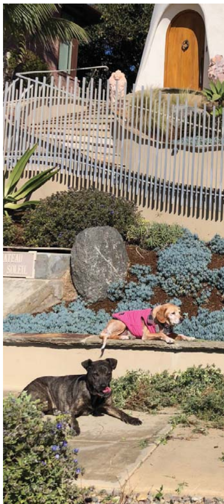
"Roxy Girl" and "Lola the Work Dog" taking a break at 889 Sunset Cliffs

• DAILY • WEEK • BI-WEEKLY • MONTHLY • CONSULTS • PAY-PAL