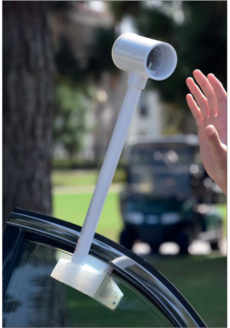
One of the heat sensors used by volunteers participating in City heat mapping project.