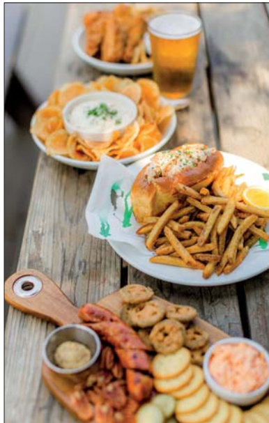
The Loma Club has added more sandwiches, snacks, and cocktails to the menu.