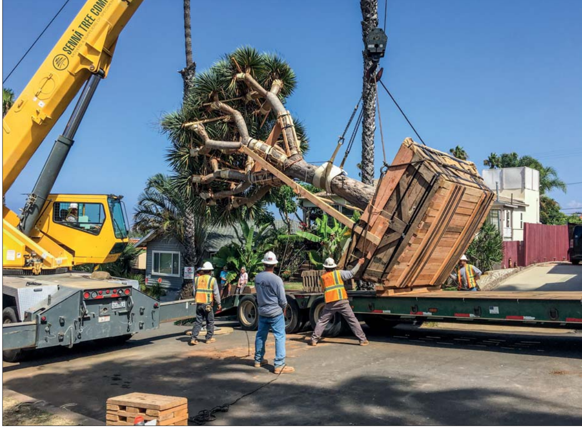
Workers from Senna Tree Co. place the Canary Islands dragon tree on a flatbed truck on Long Branch Avenue for its trip to Sun Valley on Sept. 10.