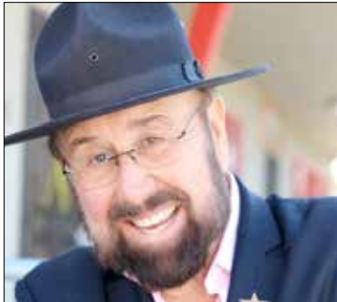
Iconic disc jockey shares his life in broadcasting at Lion Club. Page 4