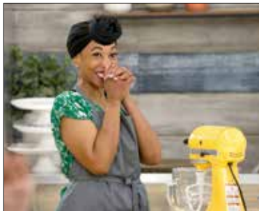
Local baker shines on Hulu's desert-themed cooking show. Page 16