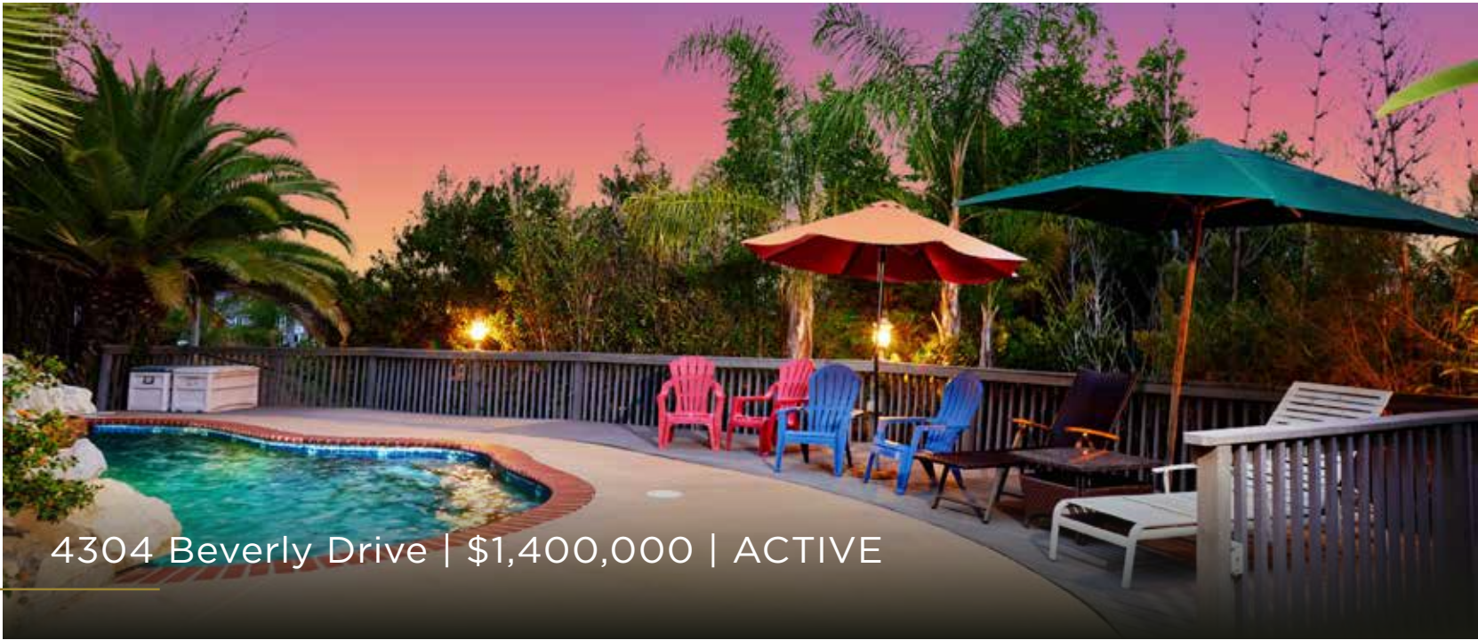
4304 Beverly Drive | $1,400,000 | ACTIVE

pacificsothebysrealty.com | 619.794.1414