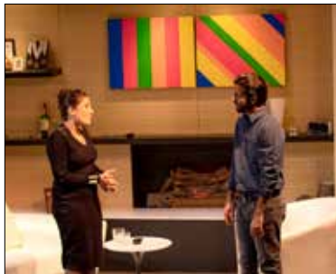
Lamplighters Theatre presents classic crime suspense play. Page 15