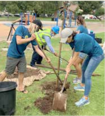
Volunteers plant a tree in Aztec Park.

Urban Forest Expansion and Improvement grant to plant 2,000 trees throughout San Diego County. To date, Urban Corps has planted a total of 1,800 trees including 150 trees in La Mesa. These efforts support the City's Climate Action Plan, which establishes a community-wide goal to cut greenhouse gas emissions in half and grow La Mesa's tree canopy 15 percent by 2035.