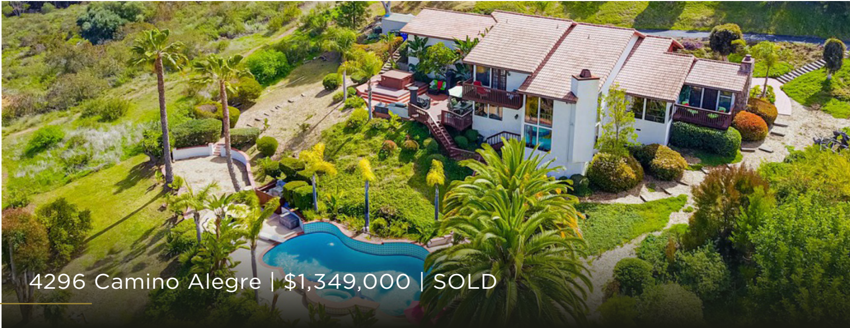
4296 Camino Alegre | $1,349,000 | SOLD