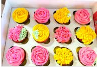
Dani L. Hannah flower theme cupcakes: A bouquet of cupcakes (Choice Confections)

out with 13 amateur and professional bakers tasked with conjuring up confections based on certain themes. Filmed on a posh ranch in the Los Angeles area, the