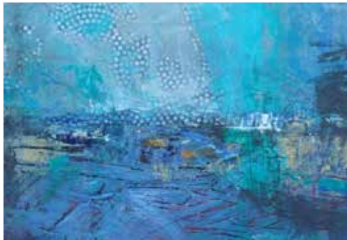
“Canyon in Blues” by Mona Ray