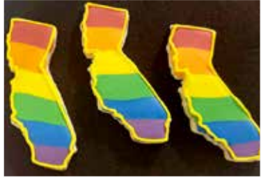
California rainbow cookies: California rainbow sugar cookies (Choice Confections)