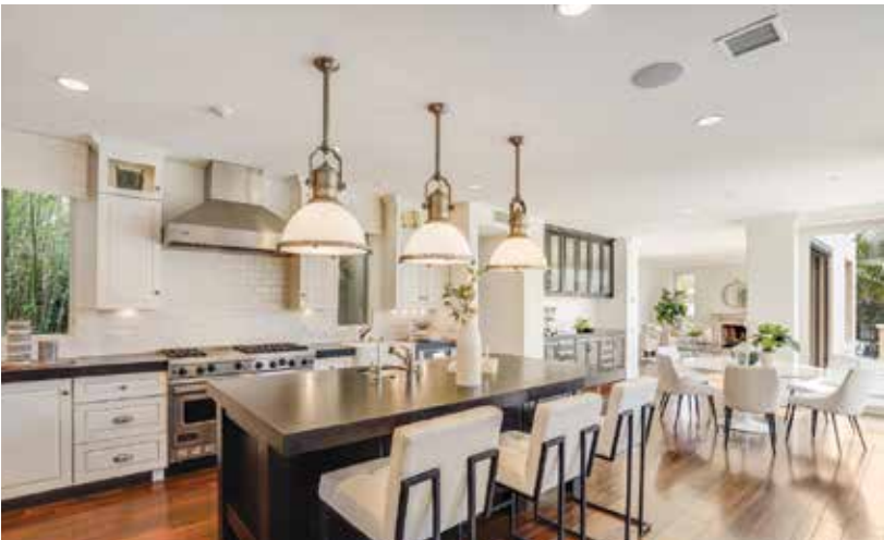
LA JOLLA Beach and Barber Tract: Private, gated estate sits on a cul-de-sac just steps away from famous WindanSea Beach. 4 BD 5 BA | 4,750 SF | $6,495,000 Open House: Sun., 11-1 pm, 348 Vista De La Playa, La Jolla CA 92037