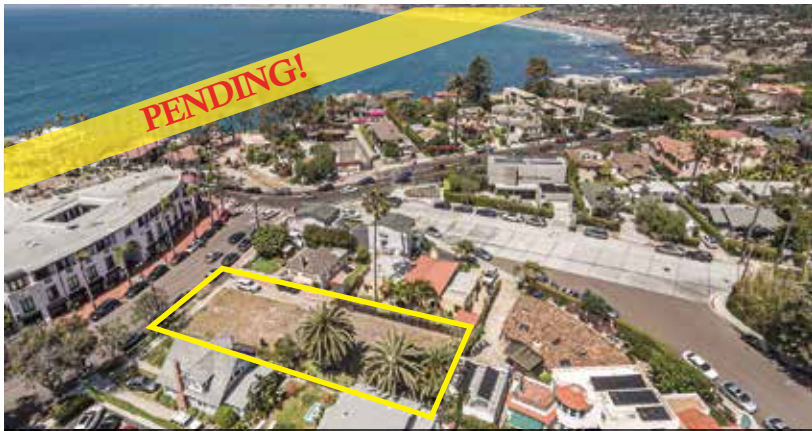
LA JOLLA The Village: Chance of a lifetime to start from ground up in the heart of the village. Build up for ocean views! 7,330 SF | L.P. $2,695,000