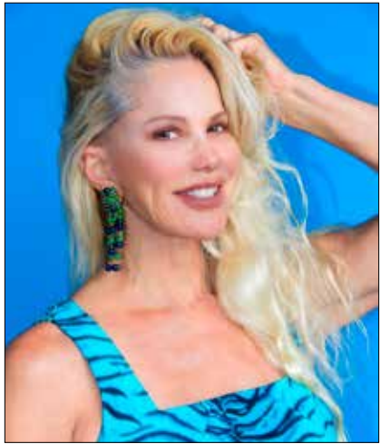
The Social Diary living the 'Dolce' life SEE PAGE 8

LA JOLLA'S LOCALLY OWNED INDEPENDENT VOICE SERVING UNIVERSITY CITY AND LA JOLLA TODAY & EVERYDAY 858.270.3103 | LAJOLLAVILLAGENEWS.COM SAN DIEGO COMMUNITY NEWSPAPER GROUP FRIDAY, SEPTEMBER 17, 2021 sdnews.com