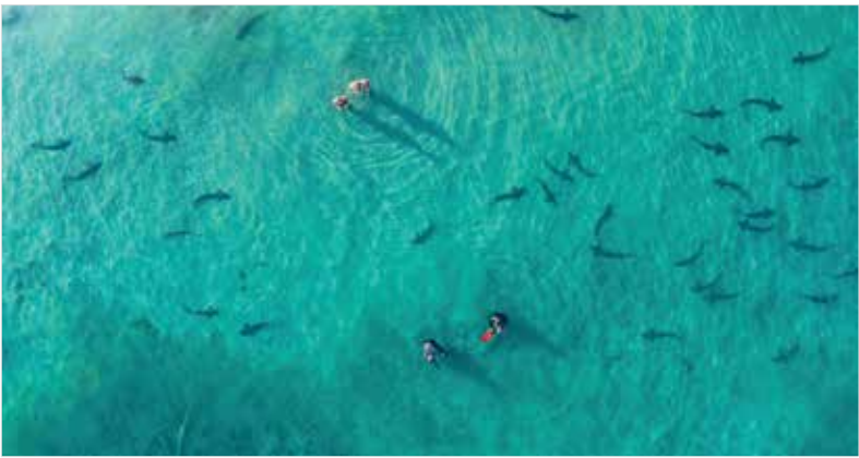
Locals and visitors check out the leopard sharks in the waters off La Jolla.