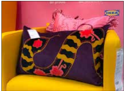
Zandra Rhodes launches a new collection at IKEA SEE PAGE 9