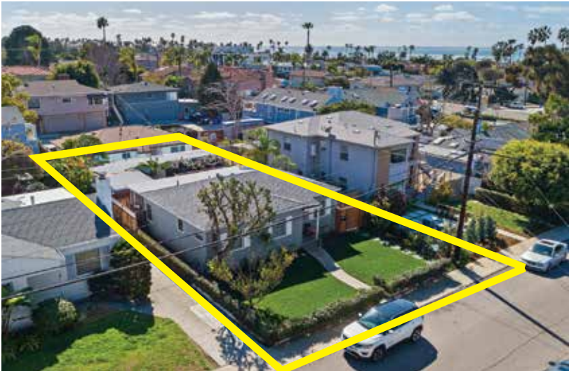
LA JOLLA WindanSea: Rare! Three detached units on one lot. 3BD/2BA/1,112 SF | 2BD/2BA/1,015 SF | 1BD/1BA/486 SF $2,825,000