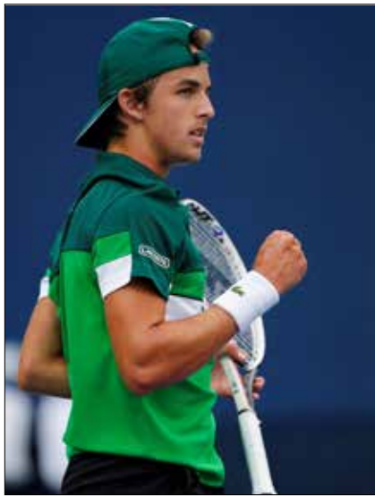
Local tennis star plays at U.S. Open SEE PAGE 11