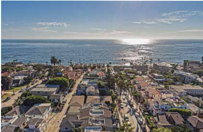
LA JOLLA WindanSea: Lot with approved plans for your finishes including roof-top patio for panoramic ocean view. Just steps from beach. 3 BD 3 BA | 1,859 SF | $1,599,000