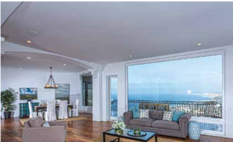
LA JOLLA Country Club: Private, gated estate with patios facing panoramic north shore ocean views for ultimate entertaining! 5 BD 5 full + 2 half BA | 6,246 SF | $4,590,000 Open House: Sat., 4-6 pm, 7411 Hillside Drive, La Jolla, CA 92037