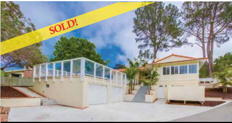
LA JOLLA Hidden Valley: Ranch style home on half acre, walking distance to La Jolla Shores beach and retail! 4 BD 4 BA | 2,280 SF | $1,599,000