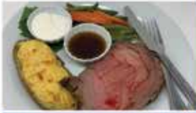
Hot Prime Rib on Wednesdays and Saturdays

BAKERY OPENS DAILY 7AM PATIO DINING WED-SUN