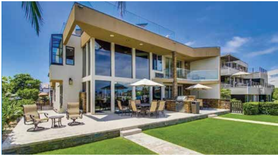
3958 - 62 Bayside Walk • Pacific Beach 7BR/7.5BA offered at $14,950,000

Don't miss this highly sought after spectacular bayfront property. Located just steps from the Catamaran Resort Hotel and Spa, famously known as the "Villas on the Bay"! On the sand, with panoramic bay views from almost every room! Perhaps you or a family member have had the pleasure of being a guest at this world-renowned property, which is currently being used as a HIGH-INCOME vacation rental. Now YOU can own this 7 BR, 7.5 luxury home and make it yours!