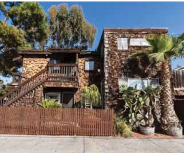
4273,4275 Dawes Street • Pacific Beach JUST SOLD $1,475,500

Triplex on the beautiful MISSION Bay! Great Investment Opportunity to Own this 3 Unit Complex that Generates Year Round Income! Own 1 & Rent the Other 2, or Rent All 3. Gorgeous views, amazing neighborhood! 2 Front Patios w/ bbq's & Upstairs Balcony to Enjoy the Bay by Day & SeaWorld Fireworks by Night!