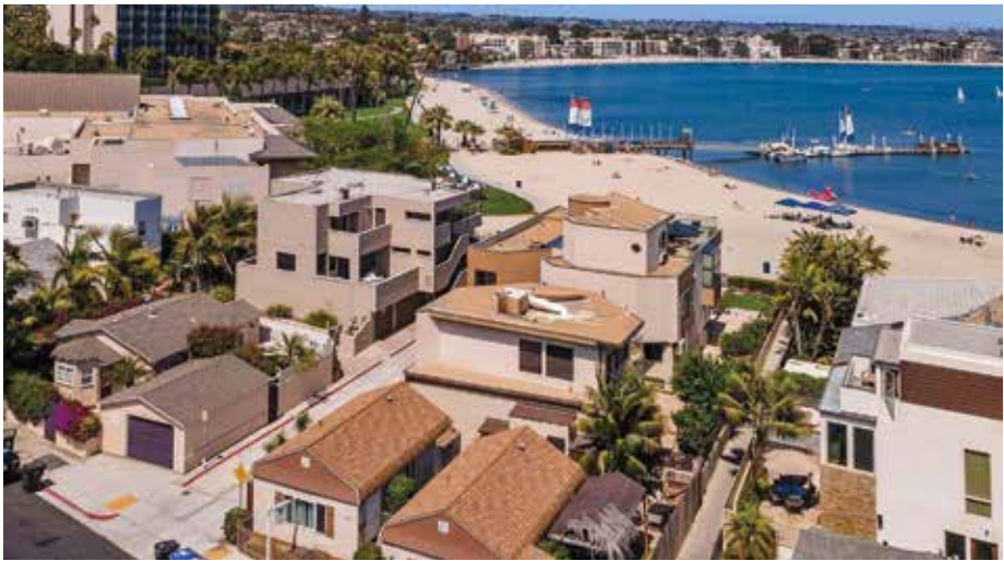
3949-3953 Mission Blvd • Pacific Beach • 2BR/2BA offered at $1,795,000

Don't miss this highly sought after spectacular bayfront property. Located just steps from the Catamaran Resort Hotel and Spa, famously known as the "Villas on the Bay"! On the sand, with panoramic bay views from almost every room! Perhaps you or a family member have had the pleasure of being a guest at this world-renowned property, which is currently being used as a HIGH-INCOME vacation rental. Now YOU can own this 7 BR, 7.5 luxury home and make it yours!