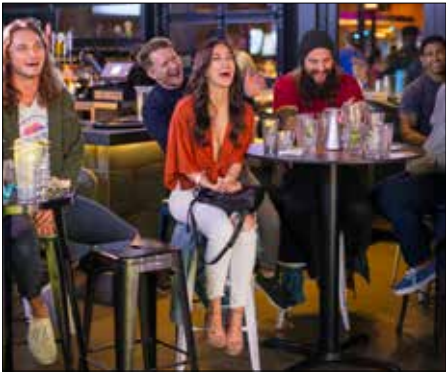
Live events are back in PB SEE PAGE 4