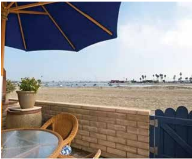
3530, 3532, 3534 Bayside Walk • Pacific Beach JUST SOLD $3,795,000

Nestled in the quiet Wooded Area of POINT LOMA this one of two homes has everything you could ever dream of. NEW CONSTRUCTION with a stunning open floor plan. HUGE rooftop deck with amazing views. Modern/Contemporary high end architecture. * Built by award winning architect, Don McLaughlin * Close to all San Diego Yacht Club and Southwestern Yacht Club * No airplane noise * Top of the line construction * Large windows providing natural light * Bedrooms/office conversions for the work at home family * Opportunity to buy both homes to create a family compound * Panoramic Rooftop deck - great for entertaining * State of the art floating staircase