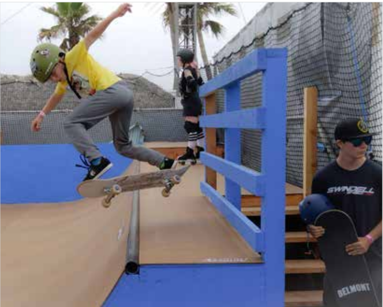
A young skateboarder gets some air at the new skatepark at Belmont Park.