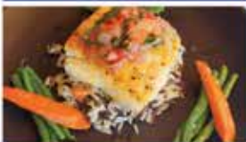
*Covid safe personal plate*