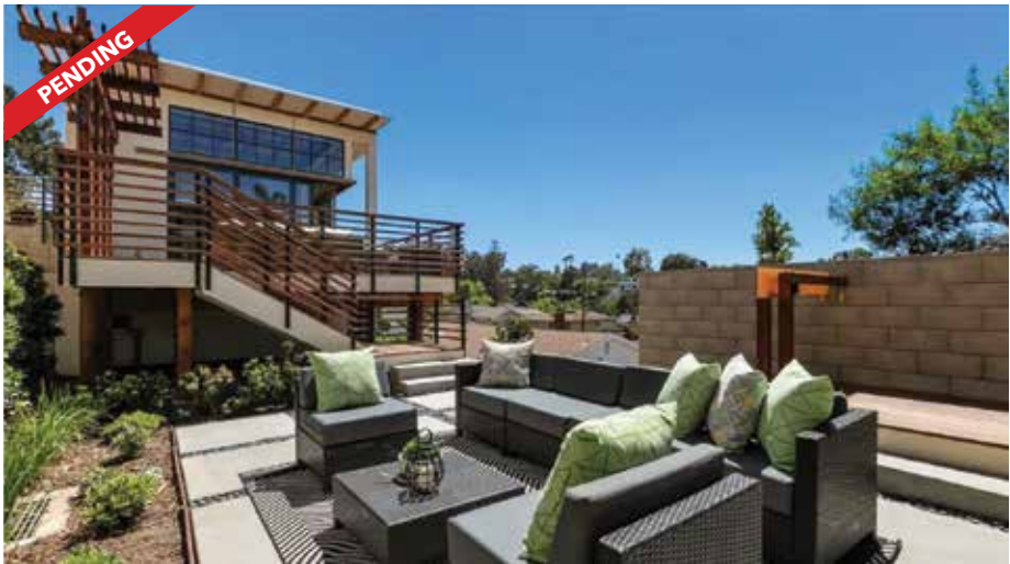
3434 Jennings Street • Point Loma 4BR/3BA offered at $2,495,000

Nestled in the quiet Wooded Area of POINT LOMA this one of two homes has everything you could ever dream of. NEW CONSTRUCTION with a stunning open floor plan. HUGE rooftop deck with amazing views. Modern/Contemporary high end architecture. * Built by award winning architect, Don McLaughlin * Close to all San Diego Yacht Club and Southwestern Yacht Club * No airplane noise * Top of the line construction * Large windows providing natural light * Bedrooms/office conversions for the work at home family * Opportunity to buy both homes to create a family compound * Panoramic Rooftop deck - great for entertaining * State of the art floating staircase