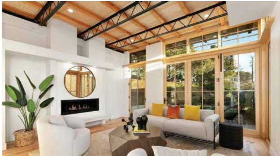
3424 Jennings Street • Point Loma 3BR/3BA offered at $2,550,000

Don't miss your chance to enjoy year round fun in the Sun! You have the best of both worlds with easy beach and bay access! Two wonderful cottages situated on a quiet North Mission Beach court. Just steps from the gorgeous Sail Bay, Catamaran Resort Hotel and the ocean. There are options galore with this wonderful property. Live in one cottage and rent out the other OR have two vacation rentals