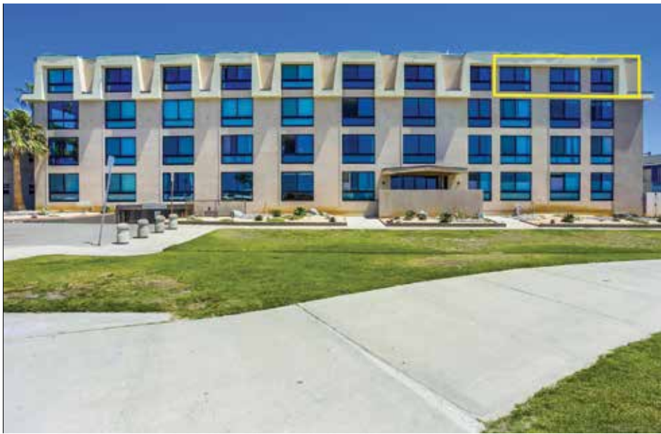
4667 Ocean Blvd. #408 2 BD | 2 BA | 862 SQ. FT.

*The Bridge Loan Advance offering for Compass clients is a loan provided by Notable Finance, LLC, NMLS# 1824748 and is available to all eligible Compass clients working with the Bridge Loan lender of their choice. Loan eligibility is not guaranteed and all loans are subject to credit approval and underwriting by Notable Finance. Loans made or arranged pursuant to a California Finance Lenders Law license. Compass is not a lender and is not providing loans as part of Compass Bridge Loan Services.