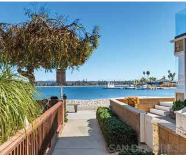
826 Seagirt Court • Pacific Beach JUST SOLD $1,065,000

One block to Mission Bay, Sail Bay, Walk to Bay, Pacific Beach Shopping and Restaurants, the location is absolutely fabulous! One of the original PB duplex's. Unique, one of kind layout, so much potential for adding on and rebuilding or simply keeping the way it is. Location is PRIME Pacific Beach. Feels like a HOME, and is very private