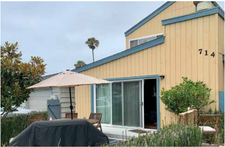
714 Law Street 2 BD | 3 BA | 1,376 SQ. FT.

This unique home is located west of Mission Blvd in North PB and just steps away from Palisades Park and Law Street Beach. The home features ocean views and, 3 parking spaces and a separate, fully-functioning guest unit in the back of the property.