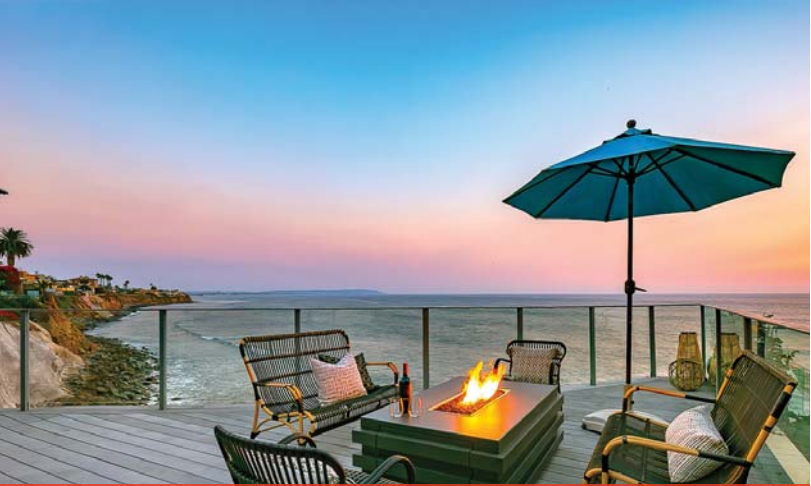
LA JOLLA Birdrock: Ocean Front Retreat Where the Ocean is your backyard neighbor! $3,900,000-$4,295,000