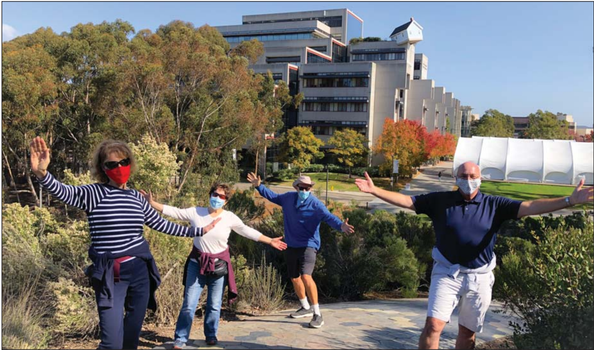
A group adventure at UC San Diego. In the background is Fallen Star, an art installation by South Korean artist Do Ho Suh on the Jacobs School of Engineering building at UC San Diego.