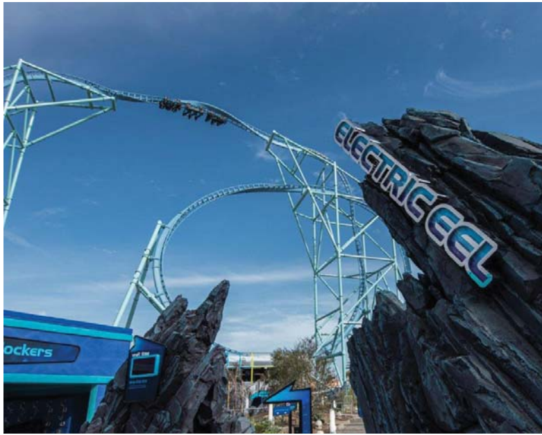
The roller coaster Electric Eel – where riders drop from heights of 150 feet while getting boosted 60 mph forwards and backwards through looping twists – is now open at SeaWorld.

"We reopened in August 2020 then again in early February as an accredited zoo and aquarium with changes to almost every aspect of our park operations to enhance our already strict health and safety standards – from food service to live animal presentations," noted Tracy Spahr, SeaWorld spokesperson. "Now with guidelines available from the state, SeaWorld San Diego is operating as a theme park. Guests can enjoy our indoor exhibits and see penguins, sharks,