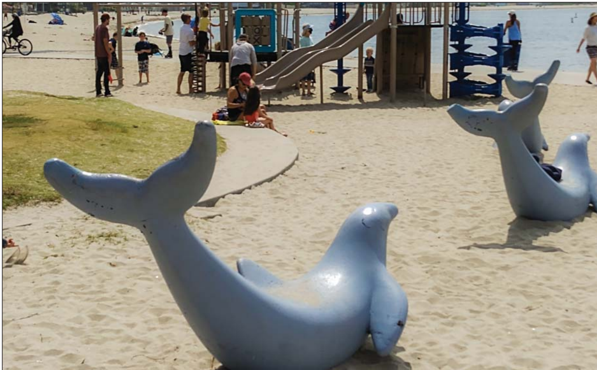
Fanuel Park on Mission Bay will have a curfew from 10 p.m. to 5 a.m.

The following nighttime curfews are now designated: PB Library, 10 p.m.-5 a.m.; Mission Bay Youth Fields, 11 p.m.-6 a.m.; and Fanuel Park, 10 p.m. to 5 a.m.