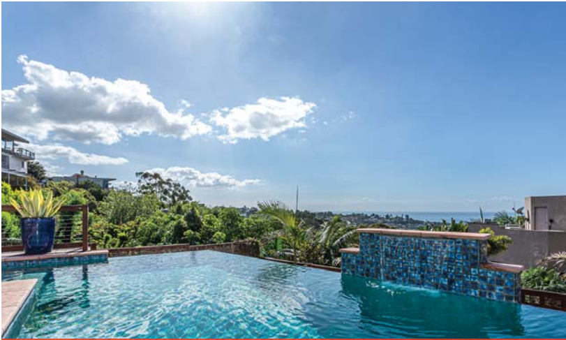
LA JOLLA Country Club: Enjoy infinity pool & panoramic ocean views Exquisite hillside estate with dual masters and guest quarters 4bd+optional & casita/5.5ba | $3,695,000