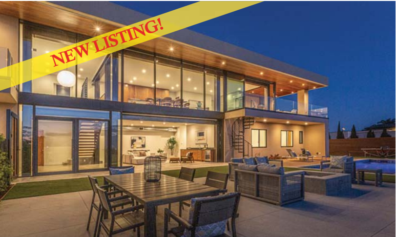
SAN DIEGO Bayho: 180° Bay & Ocean Views. Setting the New Contemporary style: the Soho Loft blended w/easy breezy Cali fun 5bd/6ba | 4,338s.f. | $3,998,000