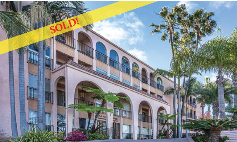
PACIFIC BEACH Del Rey: Bay view & city lights! 3rd floor unit in building that's set on a hill and above the Fray 2bd/2.5ba | 882 s.f. | $585,000