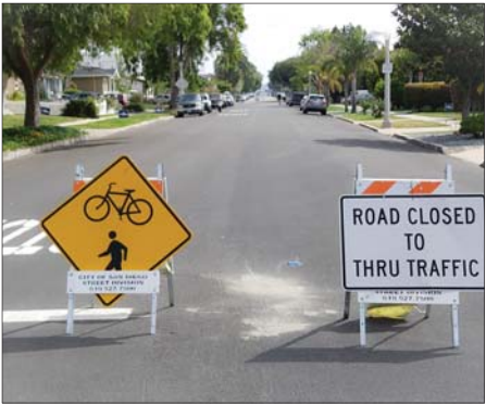
Mixed views on Slow Streets