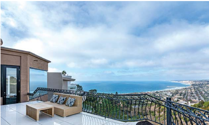
LA JOLLA Country Club: Breathtaking northshore & ocean views. Seller may carry 1st Trust Deed at 2% interest only, call for info. 5bd/5full+2half | 6,246 s.f. | $5,500,000