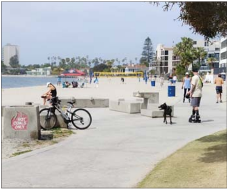
Curfews at three PB parks