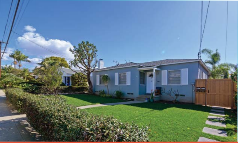
LA JOLLA WindanSea: Rare! Three detached units on one lot. 3bd/2ba/1,112s.f. | 2bd/2ba/1,015s.f. | 1bd/1ba/486s.f. $2,850,000