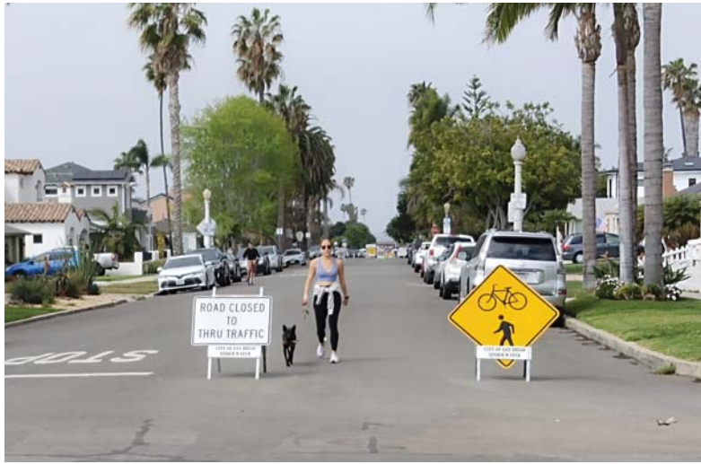
Diamond Street is part of the Slow Streets program.

"In spite of it saying 'not a through street,' many (drivers) still use it as such," said Sprofera. "Because [Diamond] was such