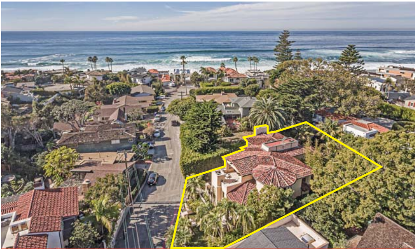
LA JOLLA Beach & Barber Tract: just 4 lots from the ocean on cul-de-sac w/pedestrian access to beach 4bd/4.5ba | 4,750 s.f. | $6,998,000