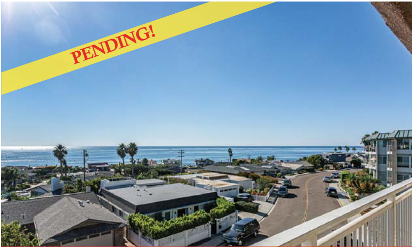
LA JOLLA Bird Rock: builder's choice SW corner unit + 2 studios for guests Panoramic Ocean Views and generous decking for outdoor enjoyment Main unit: 2bd/2.5ba | 2 sep. studios | 2,076sf total | L.P. $1,798,000