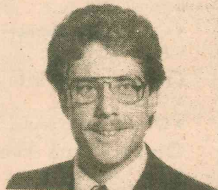
ED SCHROEDER ATTORNEY AT LAW

The times given for each date include the predicted time of the high tide (U.S. National Ocean Survey) and the probable two hour interval in which a spawning run may begin.