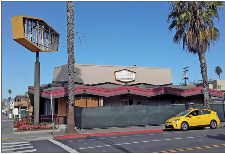
The corner of Mission Boulevard and Garnet Avenue will be redeveloped into housing.