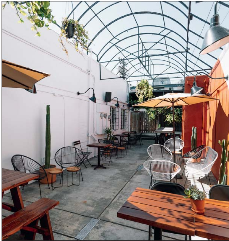
Yerba Mate Bar & Empanadas spacious sheltered patio in the back of the building.

"Yerba Mate can be served either cold or hot and we treat it as