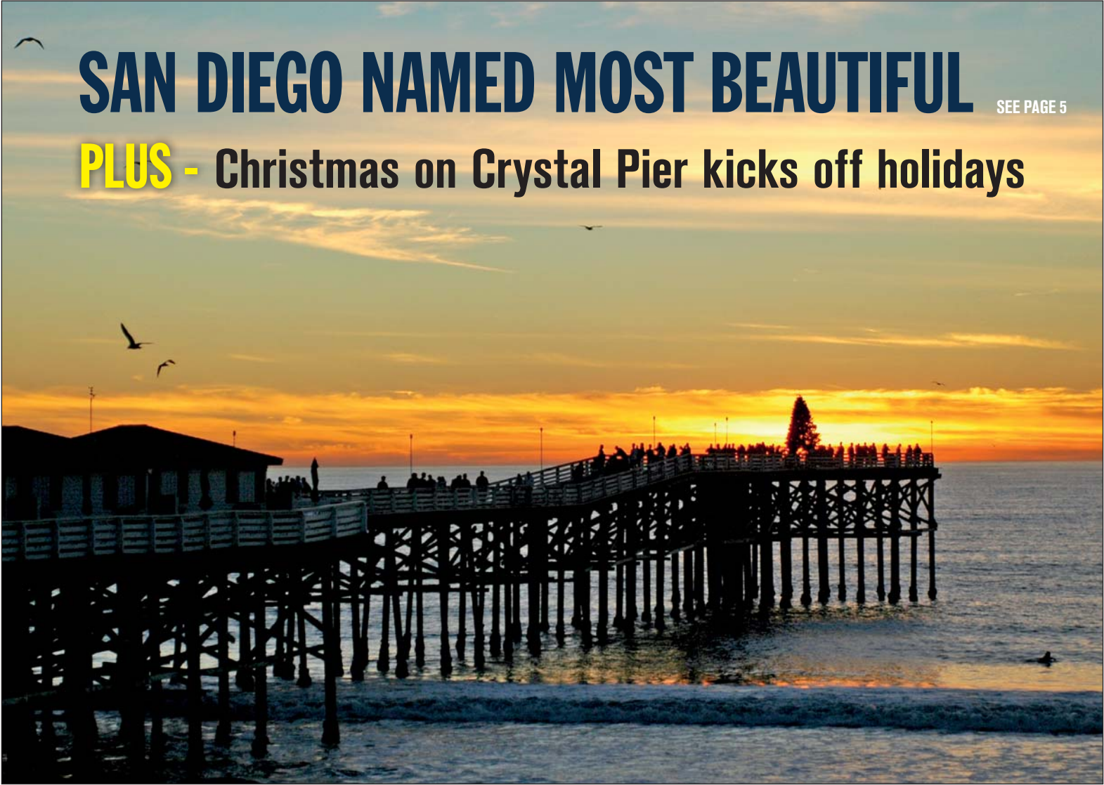
The annual lighting of the Christmas tree at the end of Crystal Pier will take place at sunset on Saturday, Dec. 7.