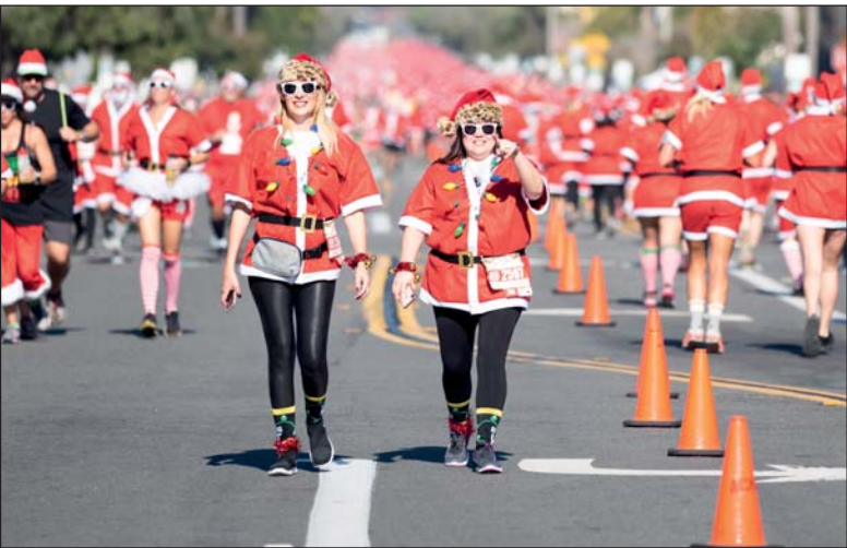
The Santa Run is one of the more popular holiday events in PB.

“This year marks the 40th Holiday Parade, and while we used to claim the longest-running