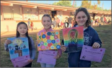
Three fifth-graders are among the six Barnard Mandarin Magnet Elementary School students whose artwork advanced to the district level of the National PTA's Reflections art competition.