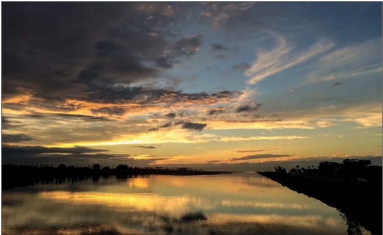
The spectacular autumn sunset reflects in the San Diego River estuary.

According to the Tourism Authority, visitors passing through San Diego spend roughly $11.5 billion every year. That amount of cash might make sense since the city also hosts 35.8 million visitors annually. Jam-packed to the brim with seaside taco shops (and trucks), breweries