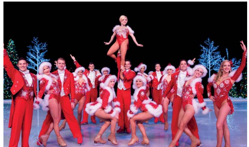
Taking center stage at the Christmas celebration this year is Winter Wonderland on Ice, an ice skating spectacular featuring 15 of the nation's top skaters.

Christmas glides into SeaWorld with an all-new ice skating spectacular featuring skaters from around the country performing Winter Wonderland on Ice.