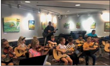
The Crown Point Junior Music Academy Music Club performed at the PB Taylor Library on Saturday, Nov. 16. CPJMA's after-school Music Club is fun, free, and is open to students in TK through fifth grade.