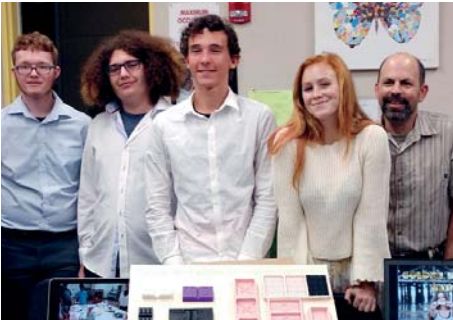
Mission Bay candy bar team SEE PAGE 11