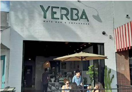
Yerba Mate Bar opens in PB SEE PAGE 6