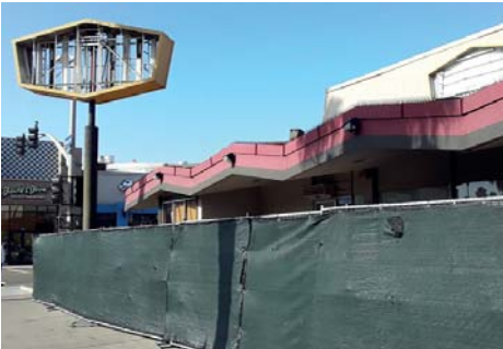
Denny's in PB loses lease SEE PAGE 4