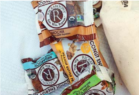
Rickaroons made in Pacific Beach SEE PAGE 7