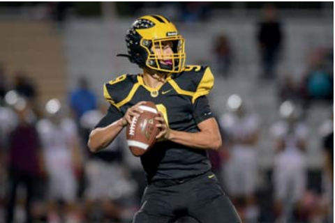
Bucs' Clash in CIF playoffs SEE PAGE 13