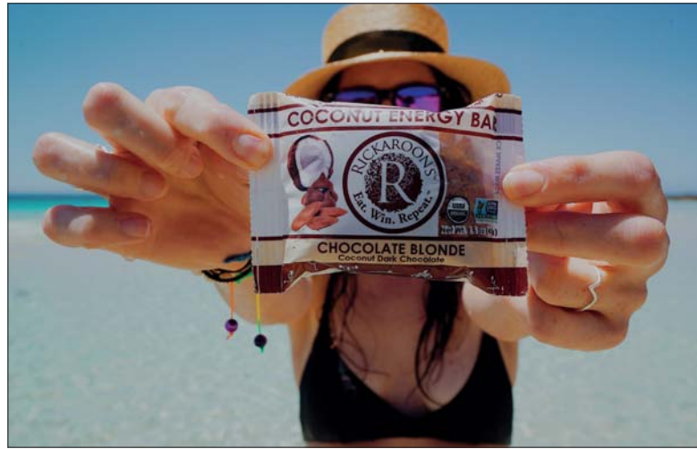
Chocolate Blonde, with dark chocolate and coconut, is Rickaroons' best-selling energy bar.