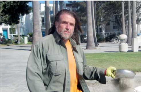
Finding blessings at Fanuel Park SEE PAGE 5