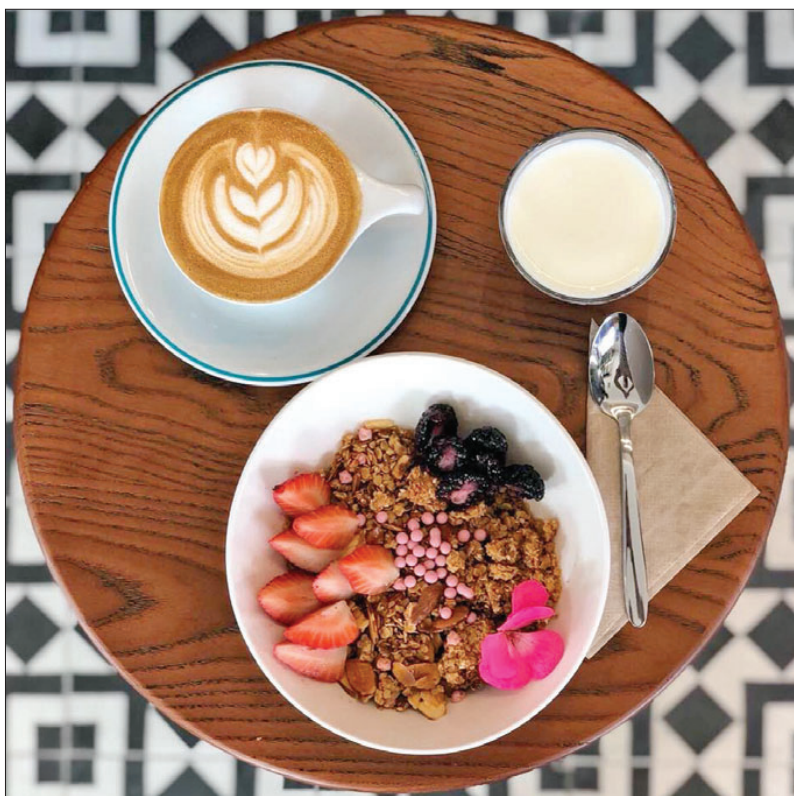
Almond granola with Strawberry Crispearls and fresh fruit as well as a choice of milk, cold or steamed, is available at Pacific Beach location.