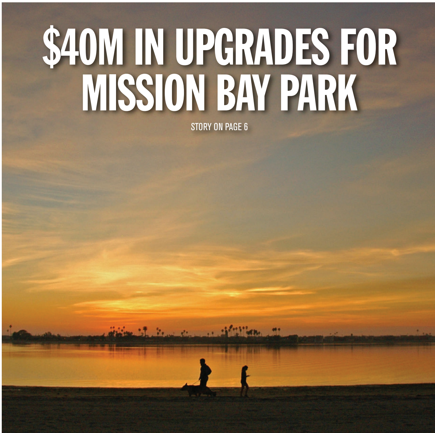
People walk along the shoreline of Mission Bay Park at Crown Point, which is slated for improvements.