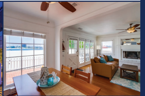
2910-2912 Bayside Walk ~ FOR SALE ~ Classic Duplex on Water Front 3BR/2BA House + 1BR/1BA + 3 Car parking