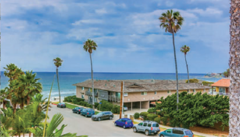
657 CHALCEDONY • INCOME PROPERTY 4/4 • STEPS TO BEACH • 2-CAR GAR • $1.4M