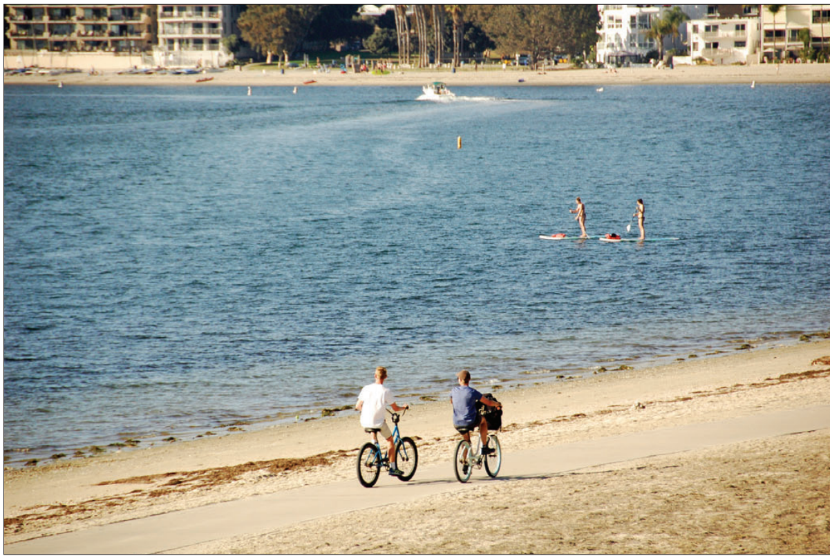
Boaters, standup paddle boarders and bicyclists take advantage of a beautiful fall day at Mission Bay.

In addition to maintaining and nurturing natural resources, Drumm says ecotourism is better for the economy. Lowering volume and density, monitoring and managing impacts and encouraging more local input leads to a higher income multiplier, higher tourist spending and a higher ratio of jobs per tourist.