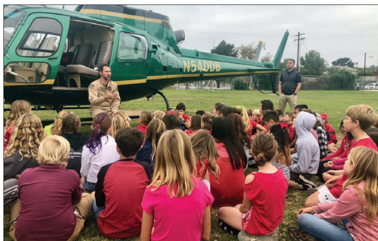
Pacific Beach Elementary had a visit from a DEA helicopter, the FBI, Border Patrol, and SDPD K9 officers for Red Ribbon Week. It was an exciting, unforgettable experience for the kids.