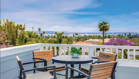
4925 EMELENE • NEW CONSTRUCTION 4/3 • NEAR KATE SESSIONS PARK • $1.699M

Contact me now for a FREE home estimate: