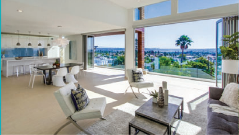
1621 COLLINGWOOD • PANORAMIC VIEWS 4/4 • MODERN LUXURY • $2.995M