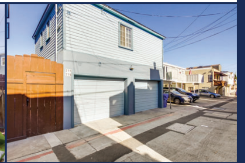
733-735 Avalon ~ JUST SOLD ~ Income Property 2BR/1BA cottage + 1BR/1BA apt + 2 Car Garage