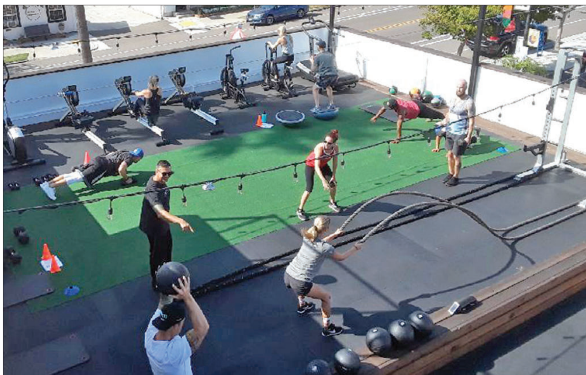
A group training class works out on the top floor of PB Fitness with a view of Cass Street.

"If you want an open gym where you come in and work out individually — that's not our business model," said Cardoza. "What we do is group training, both intense and lower key, in a social environment.