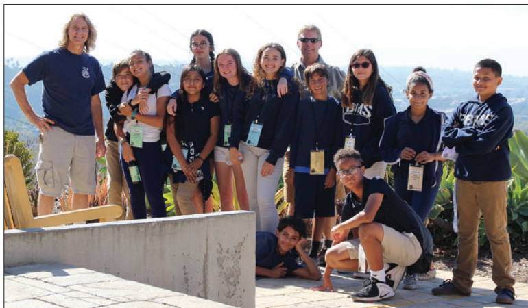
Students from Pacific Beach Middle School's yearbook and media class traveled to the iTV (channel 16) studios at the San Diego County Office of Education.