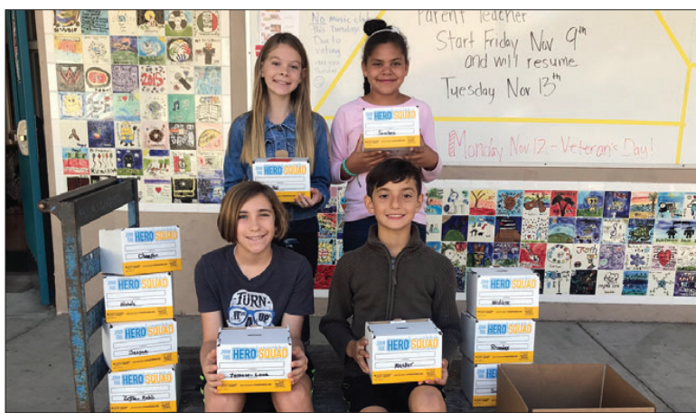
CPJMA ASB Officers led a month-long fundraising effort for the Student Series' Pennies for Patients Program. With the help of everyone at CPJMA, students collected more than $1,000 for the Pennies for Patients Program.

■ The next Friends of Pacific Beach Secondary Schools meeting will take place 6 p.m. Wednesday, Nov. 28, at Mission Bay High School Library.