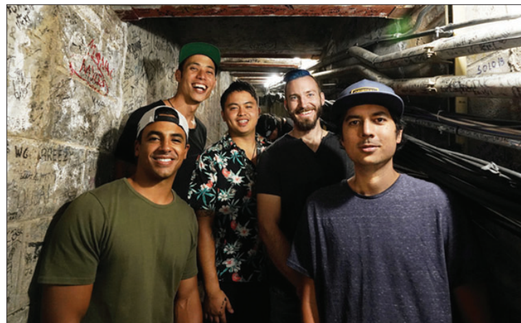
Through the Roots will play Moonshine Beach on Wednesday, Nov. 21.

With more than 20 million copies sold in the U.S. alone, it's safe to say that few musical bodies of work are as beloved as Fleetwood Mac's "Rumors." On Nov. 16 The Benedetti Ensemble will perform the entire album at Dizzy's, recasting the tunes for guitarist