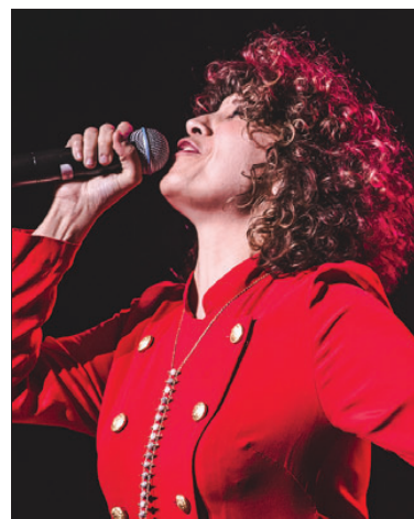
Guatemala native Gaby Moreno will perform with A Bowie Celebration.