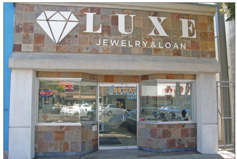
Luxe Jewelry &amp; Loan at 1029 Garnet Ave. in PB.