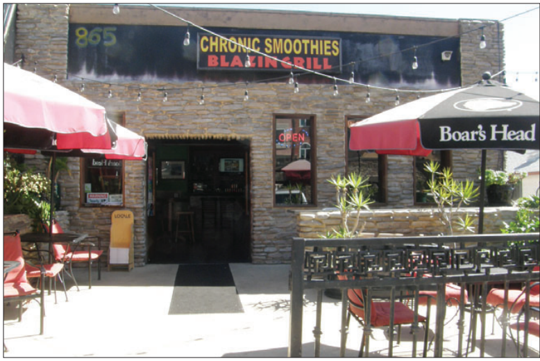
Chronic Smoothies Blazin Grill at 865 Turquoise St. DAVE SCHWAB / BEACH &amp; BAY PRESS