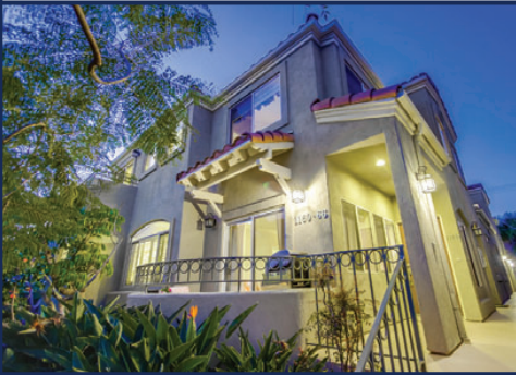
1160 Pacific Beach Dr - Just Listed - $895.000 3BR/3BA Townhome + 2 Car Garage