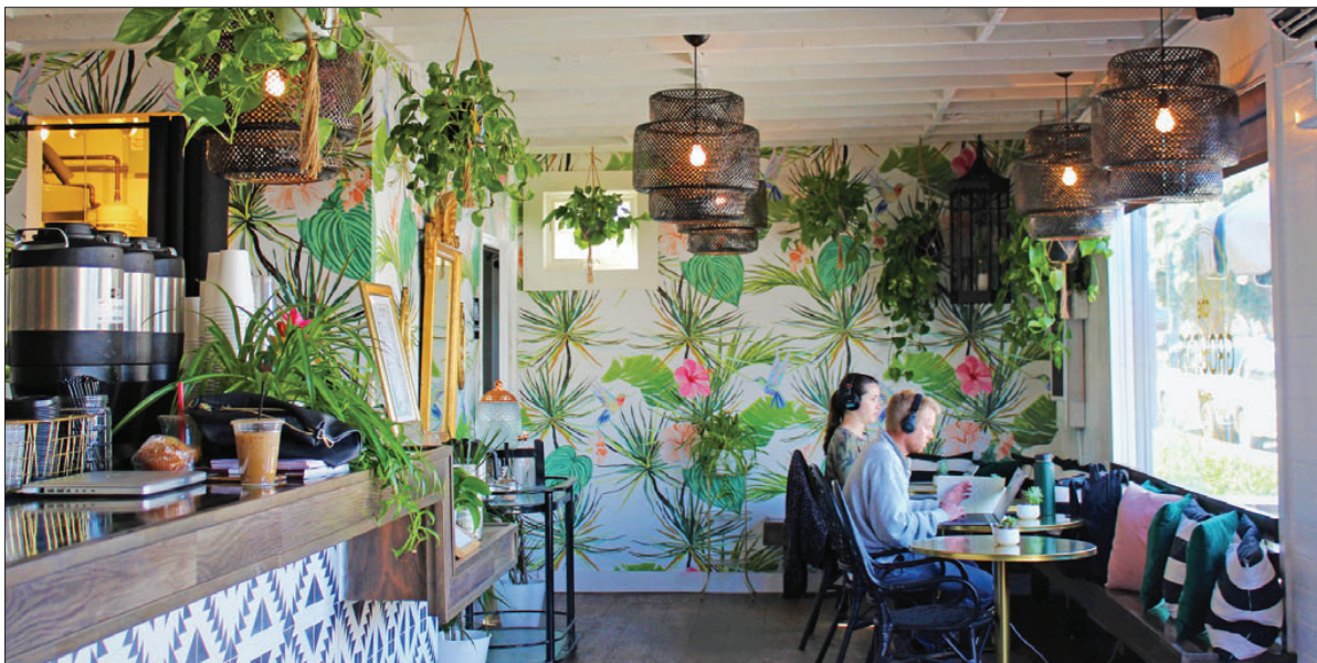
The wallpaper, featuring hummingbirds and pink hibiscus flowers, and the caged lamps.