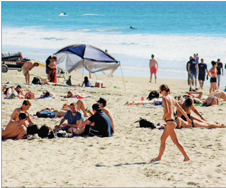
Students are back on the beaches for spring break.

Family owned and operated, K-Dubs Beach Rentals is a beach gear delivery service that offers a unique deal to the beach communities and out-of-town guests by supplying surfboards, beach cruisers, sunshades,