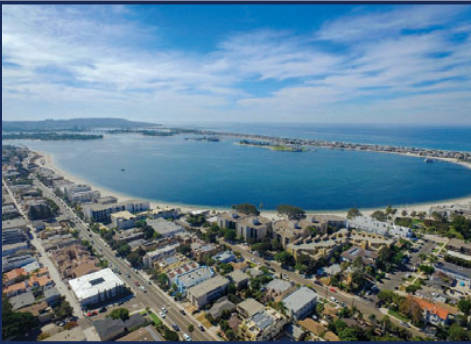
North PB Townhome - Coming Soon - $774.000 3BR/2.5BA + 2 Car Garage