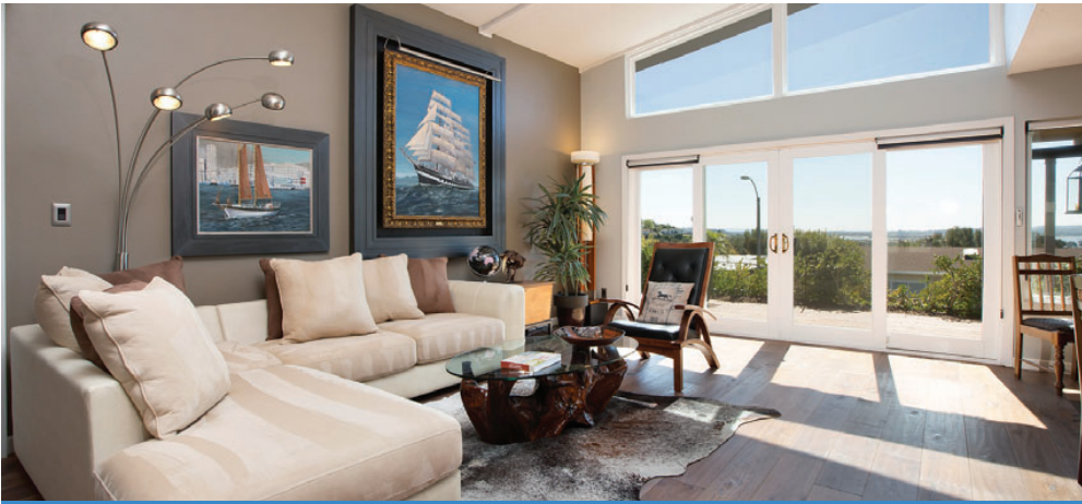
JUST LISTED! OPEN SAT & SUN 12-4 3051 CONNER WAY