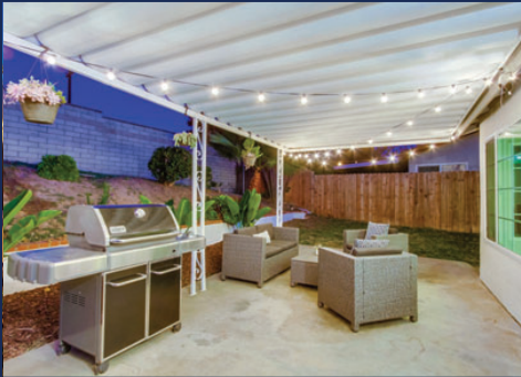
2723 Lancha - In Escrow - $699,000 3BR/2BA - 1540 sq ft Linda Vista SFR