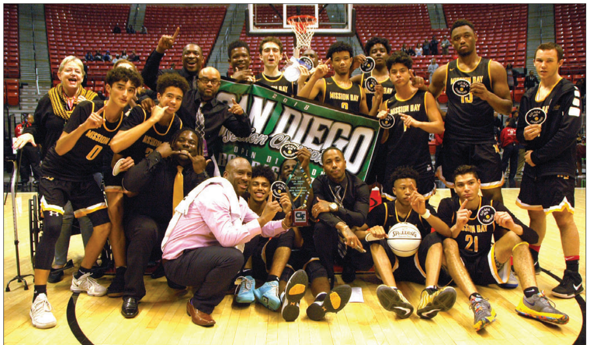
The Mission Bay Buccaneers pose with their CIF championship patches and trophy.