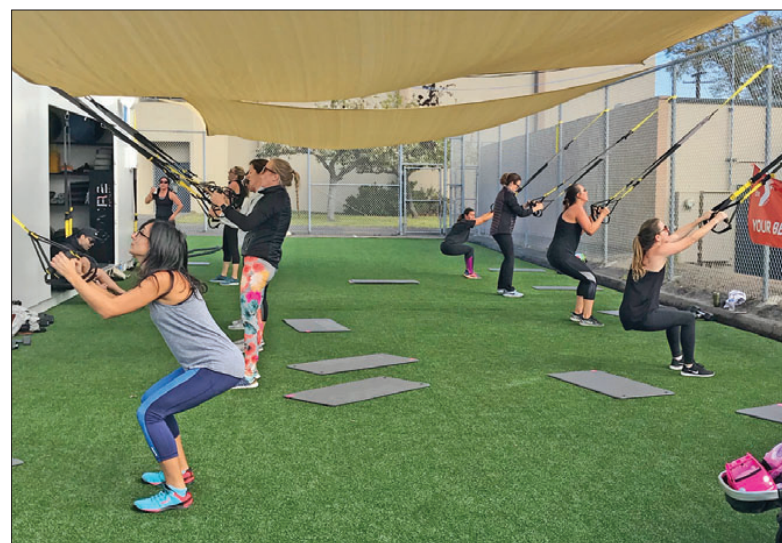
People workout at the Outdoor Fitness Center.