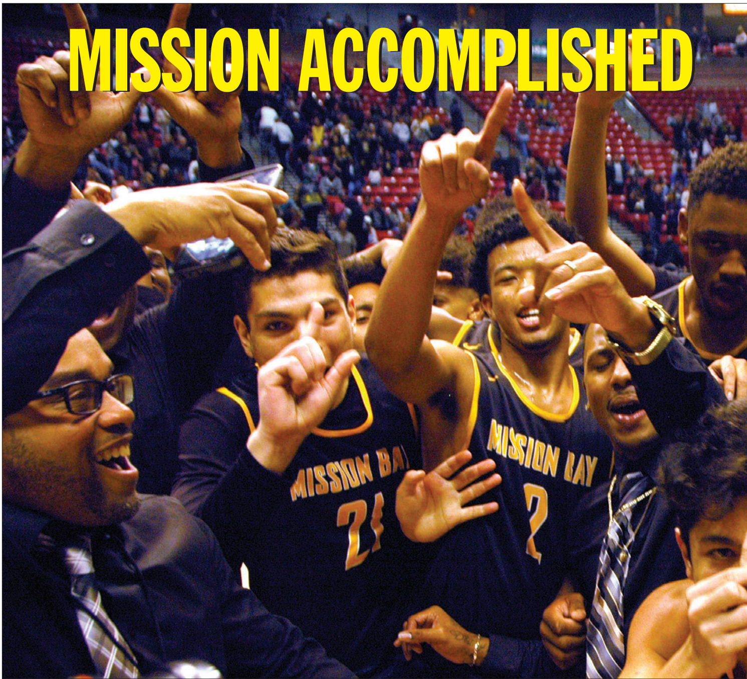
Mission Bay players and coaches celebrate winning the CIF Open Division title at SDSU's Viejas Arena on March 2.

Try the Matcha Latte, with tea, coconut milk, and hibiscus at The Grounds Bean Bar SEE PAGE 6