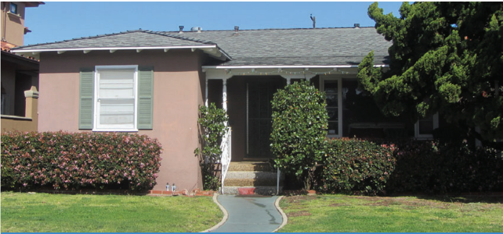
JUST LISTED! OPEN SUN 1-4 1016 OLIVER AVE.

Pacific Beach | $1,195,000 Quaint 2 br 2 ba home with approx. 1438 sqft, features open bean ceilings, fireplaces, dining room, eat-in kitchen, nice yard & 2 car garage. Close to beach & bay. Carol Sorenson 619-203-2424 csorenson106@gmail.com CalRE# 00464678