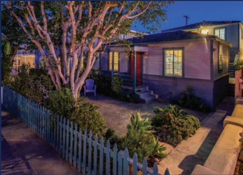
733-735 Avalon - $1,379,000 2BR/1BA + 1BR/1BA Duplex - 2 Car Garage