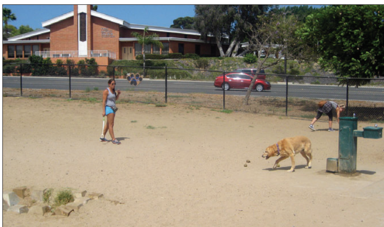
The Capehart dog park has no grass left.