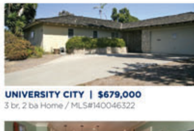
UNIVERSITY CITY | $679,000