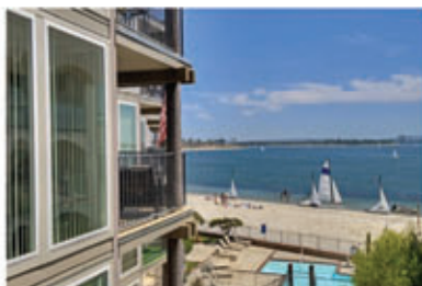
PACIFIC BEACH | $750,000

Sail Bay corner unit moments to the sand, pool & spa. Upgraded SS appliances, granite countertops, floor-ceiling windows & large deck! Gated parking.