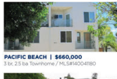
PACIFIC BEACH | $660,000