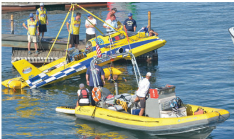
CLOSER INSPECTION Bayfair San Diego hydroplane race safety officials inspect a boat that flipped multiple times during the race.