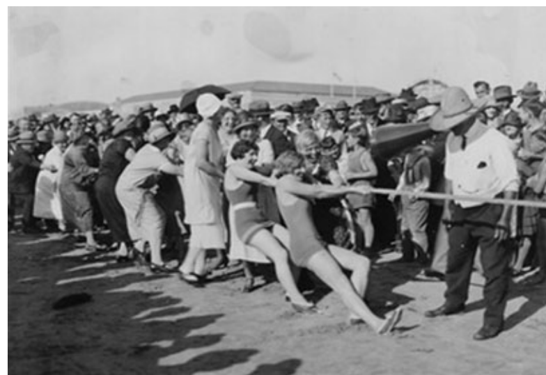
HEAVE-HO Mission Beach has always held an allure for funseekers, like these involved in a tug-of-war likely in the 1920s or '30s.