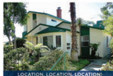
LOCATION, LOCATION, LOCATION!