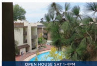
MISSION VALLEY | $165,000

Tennis anyone? West Mission Valley studio Pent-house w/vaulted ceilings & nice view. Pool, spa, BBQ, VA financing! Why rent?