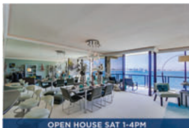
OPEN HOUSE SAT 1-4PM