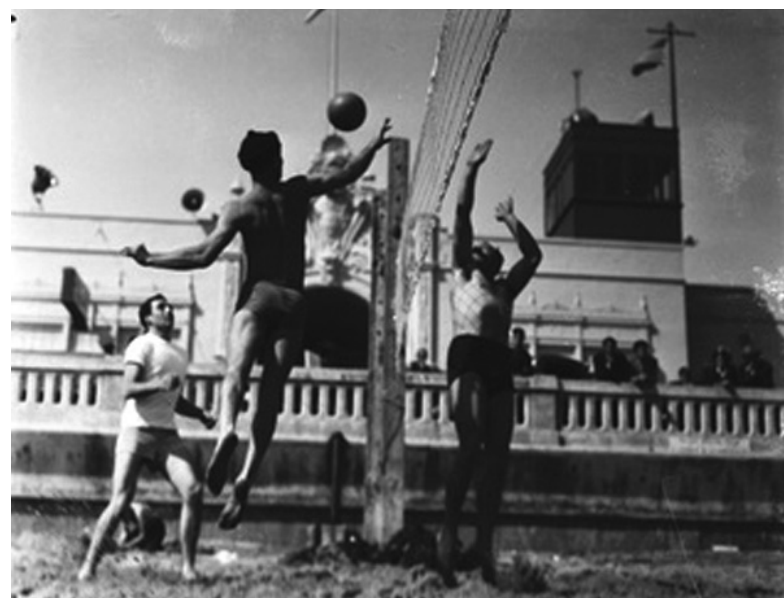
A LONG TRADITION What would Mission Beach be without an impromptu volleyball game in the sand?

See photos & videos at www.rightchoiceselectorliving.org (619) 246-2003