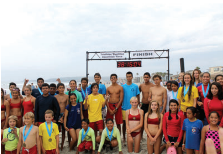
MAKING A SPLASH Participants from San Diego, Tijuana and Rosarita joined the second annual Junior Lifeguard Festival in Mission Beach on Aug. 2.

This event was open to the public and featured special junior lifeguard guests from Tijuana and Rosarita. Junior Lifeguard events included swim, paddle relays and beach flags. All families, friends and participants enjoyed a breakfast on the beach.