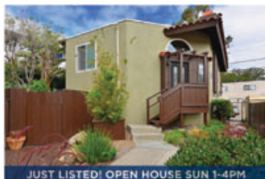
JUST LISTED! OPEN HOUSE SUN 1-4PM