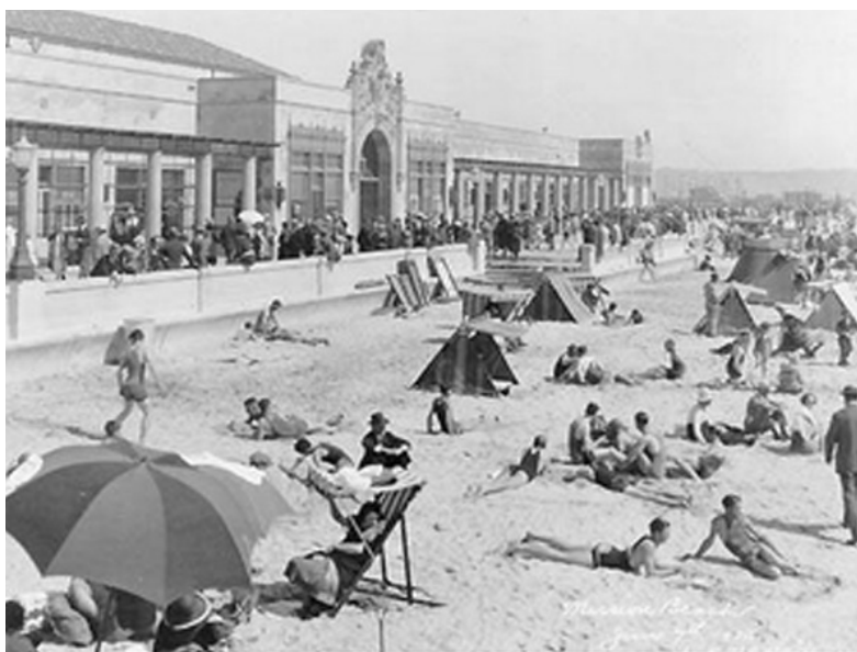
PEOPLE-GAZING The boardwalk area of South Mission Beach has always been a popular spot for sunbathers and people-watchers, as shown in this undated historic photo.

The festival wouldn't be complete without tasty grub. Visitors will be able to grab the best barbecue taste treats at the sanctioned cook-off area, with samplings starting at 11 a.m. until they're