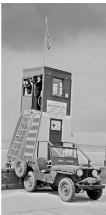
MORE CENTENNIALS San Diego lifeguards, who are also celebrating 100 years of service this year, stand perched atop a lookout station in this historic photo.

For more information, visit www.missionbeachcentennial.org or call (858) 488-1549.