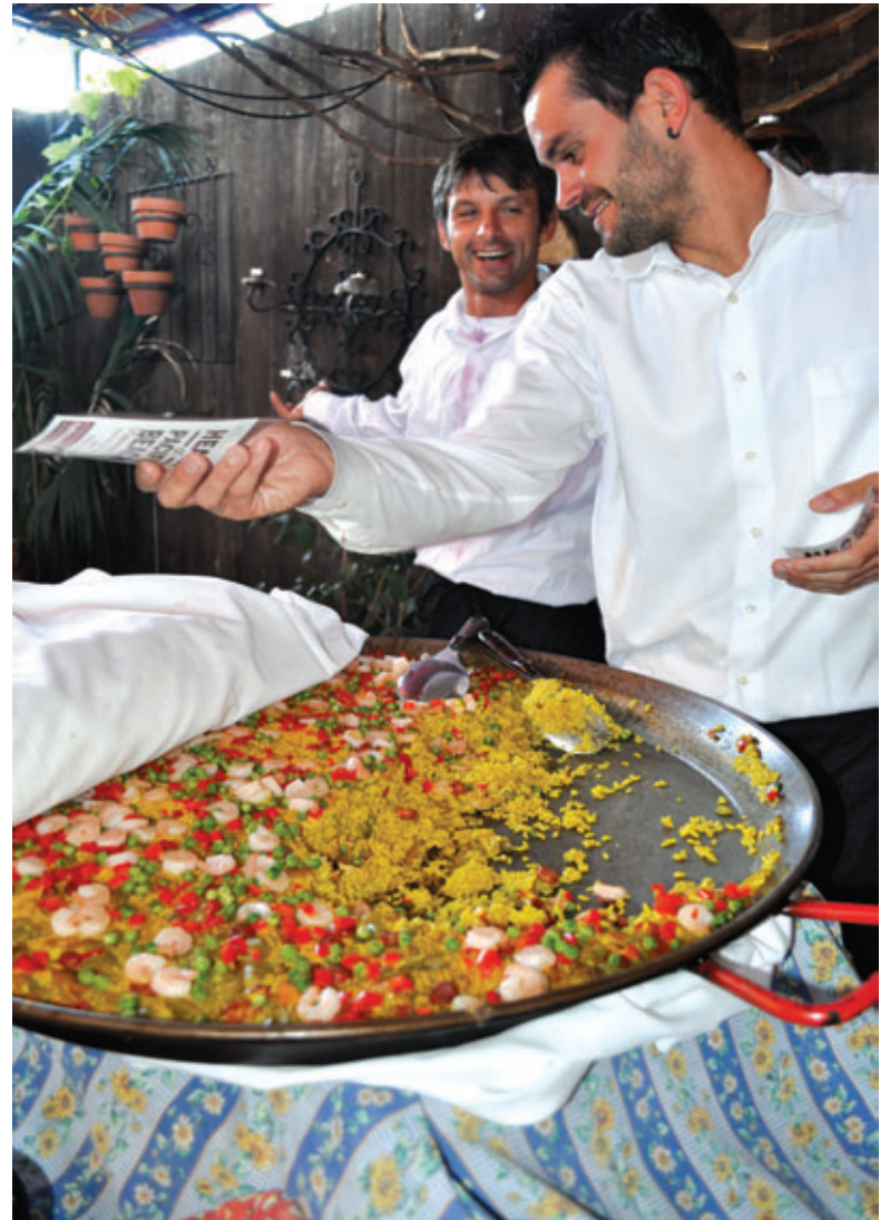
TASTE DELIGHTS Workers at Costa Brava show off a huge pan of paella during a previous Pacific Beach Restaurant Walk.

For more information, call Kim Ramsey at Discover Pacific Beach at (858) 273-3303, or visit www.pacificbeach.org .