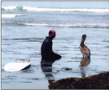
The first-place photo winner in last year's Beacon photo contest was this surfer getting a little one-on-one time with a friendly brown pelican at "Garbage Beach."

• Please do not email photos. Instead drop them off or mail them to: The Peninsula Beacon , Attn: Photo Contest, 1621