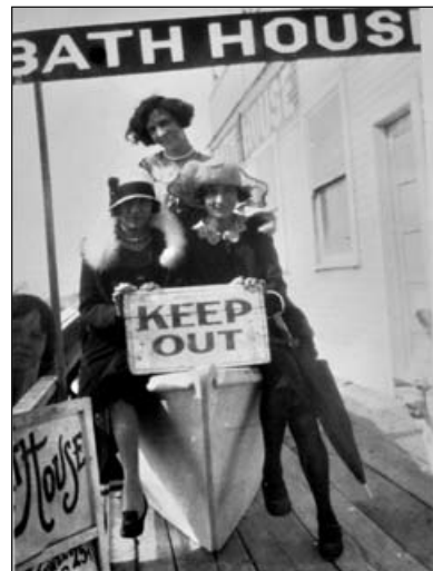
The Ocean Beach Bath House and the old wooden boardwalk were a few of the treasures that graced the oceanfront in 1921.