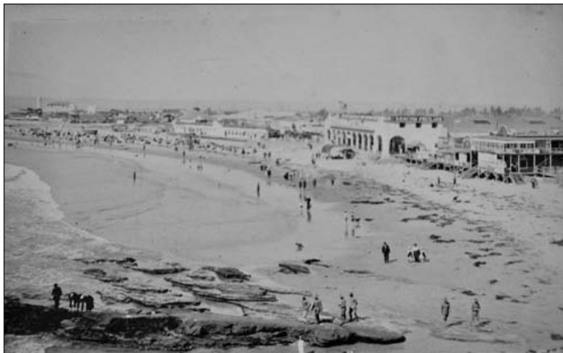
Ocean Beach in the early 1920s.

At the time, there were hardly any paved streets or sidewalks to speak of, and just a single streetcar that branched off for a stop at the present-day Masonic Lodge. According to Isom, Ocean Beach was full of eucalyptus trees before the sidewalks and streets were paved in the mid-1920s. Endless poppy fields stretched along Sunset Cliffs and olive orchards spread across the Point where he and his brothers would camp overnight.