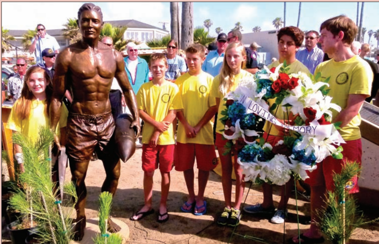
Members of the San Diego Junior Lifeguard program gather around a new sculpture honoring lifeguards past and present during the memorial's unveiling May 23 at the foot of Santa Monica Avenue. The wreath honors 13 persons, mostly military servicemen, who lost their lives in the Ocean Beach surf on May 5, 1918 because of huge riptides. The incident led to the formation of the San Diego Lifeguard Services as we know it today.