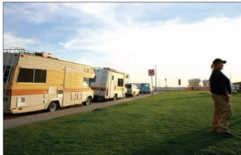
Campers and motorhomes like these parked in Ocean Beach have long been a thorn in the side of residents and visitors.

A number of beachfront residents, most from Pacific and Mission beaches,