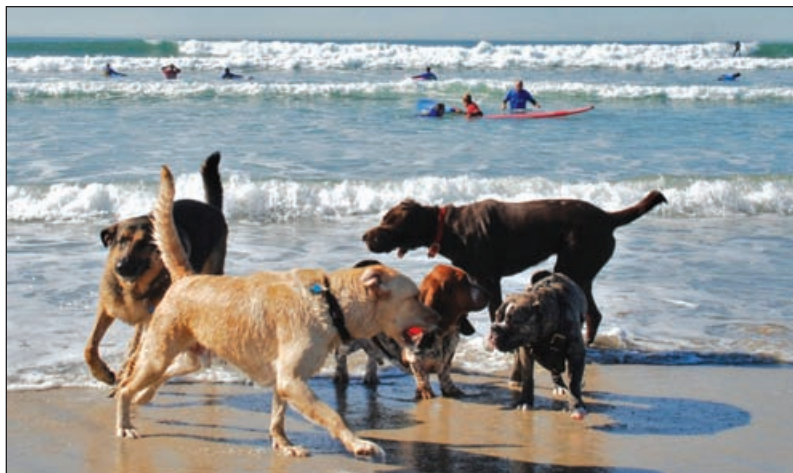
Lifeguards said dogs caught in strong undertows and tidal flows are more likely to return safely ashore than are humans, who are prone to panic in harsh currents and conditions.