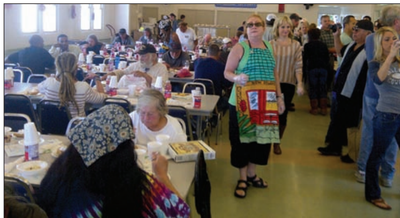
Hungry guests got a helping hand from a host of volunteers during a Thanksgiving feast organized by Second Chances Bread of Life in Ocean Beach.