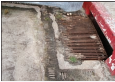
After a resident brought the issue of the clogged diversion drains to Coastkeeper's attention, left, the organization alerted the city and the problem was quickly fixed, right.