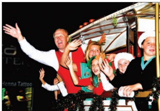
District 2 City Councilman Kevin Faulconer gets the crowd fired up with a float full of smiling young faces during the holiday parade.