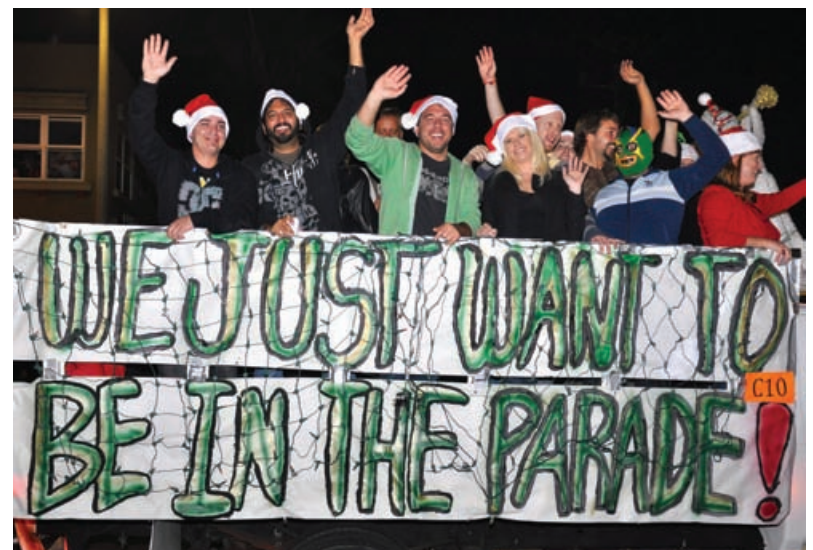
"We Just Want To Be In The Parade"