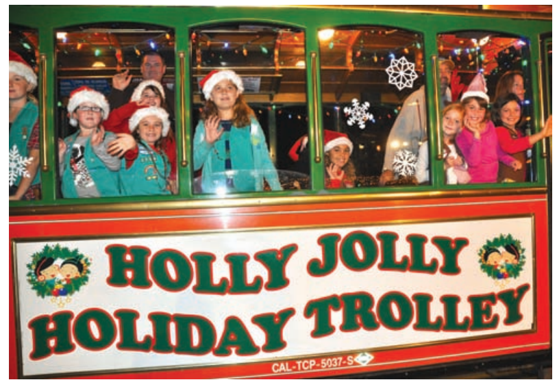
Girl Scout Troop 3759