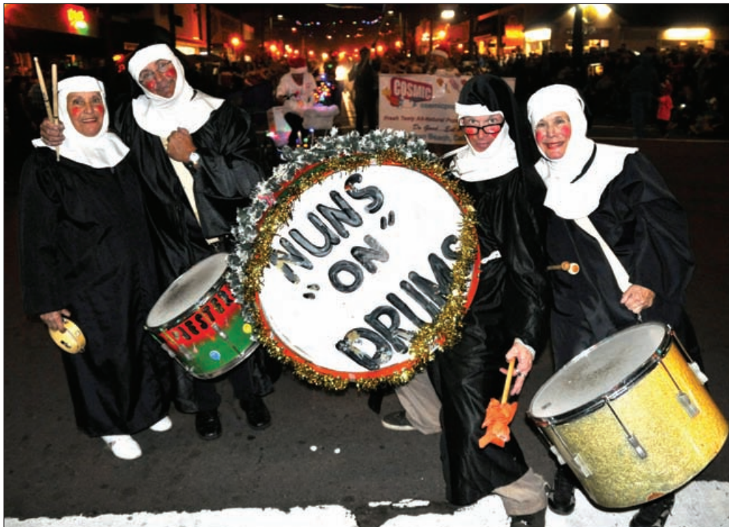
Members of the "Nuns on Drums" entry, above, ham it up during the 33rd annual Ocean Beach Christmas Parade down Newport Avenue on Dec. 1. Right, the parade, as always, was brimming with music and smiling faces as participants and spectators alike sought to seek the spirit of the season.