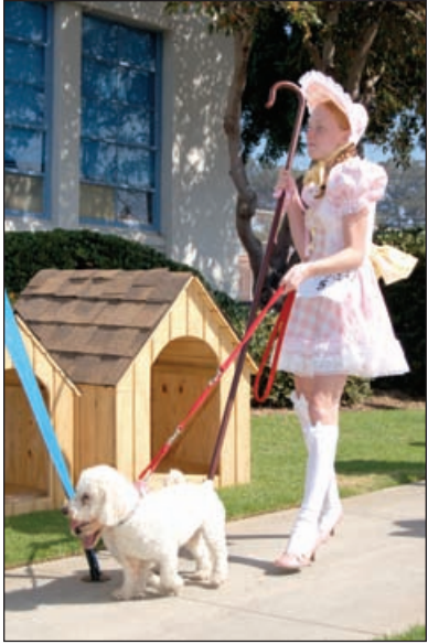
Bo Peep appears to have switched out her naughty sheep for a dog who minds during the OB Canine Festival.