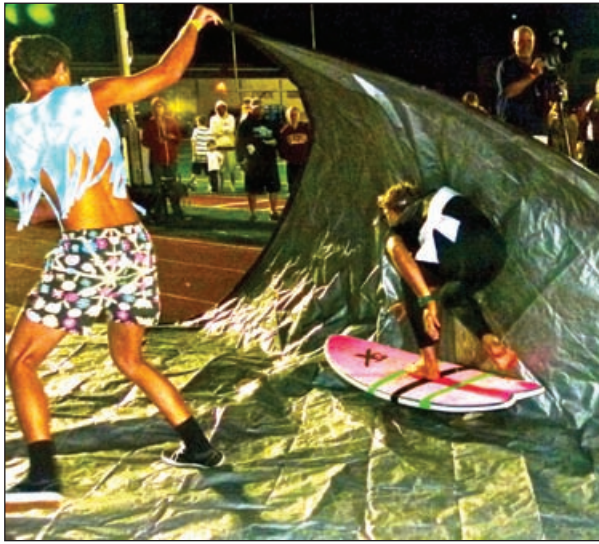
Junior class members wowed the crowd with a simulated ocean wave and surfer.

The night illustrated the school's motto: "Once a Pointer, Always a Pointer."