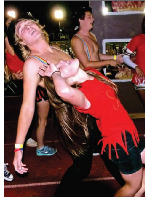
Moves and expressions like this moved the judges to name the senior class as Homecoming dance contest champions.