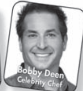
Bobby Deen Celebrity Chef