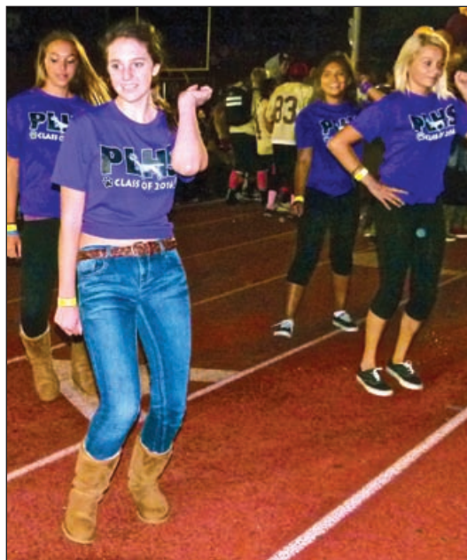
Freshman girls bust some moves in their coordinated T-shirts.