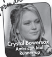
Crystal Bowersox American Idol Runner-up