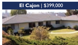
El Cajon | $399,000

Great view home in Sunset Cliffs with 3 br, 2 ba, view deck, fireplace, hardwood floors, new master bathroom indoor laundry and 2-car attached garage. Perfect location and room for your boat or RV.