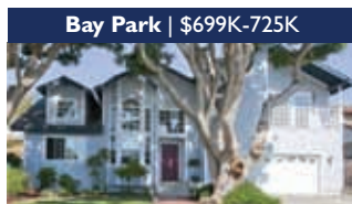
Bay Park | $699K-725K

Remodeled 2 br, 2 ba ocean front condo! Two balconies, wood laminate flooring & tile throughout. Newer cabinets, appliances & granite counter tops. Dual master suites! 2-car garage plus 1 additional deeded parking space.