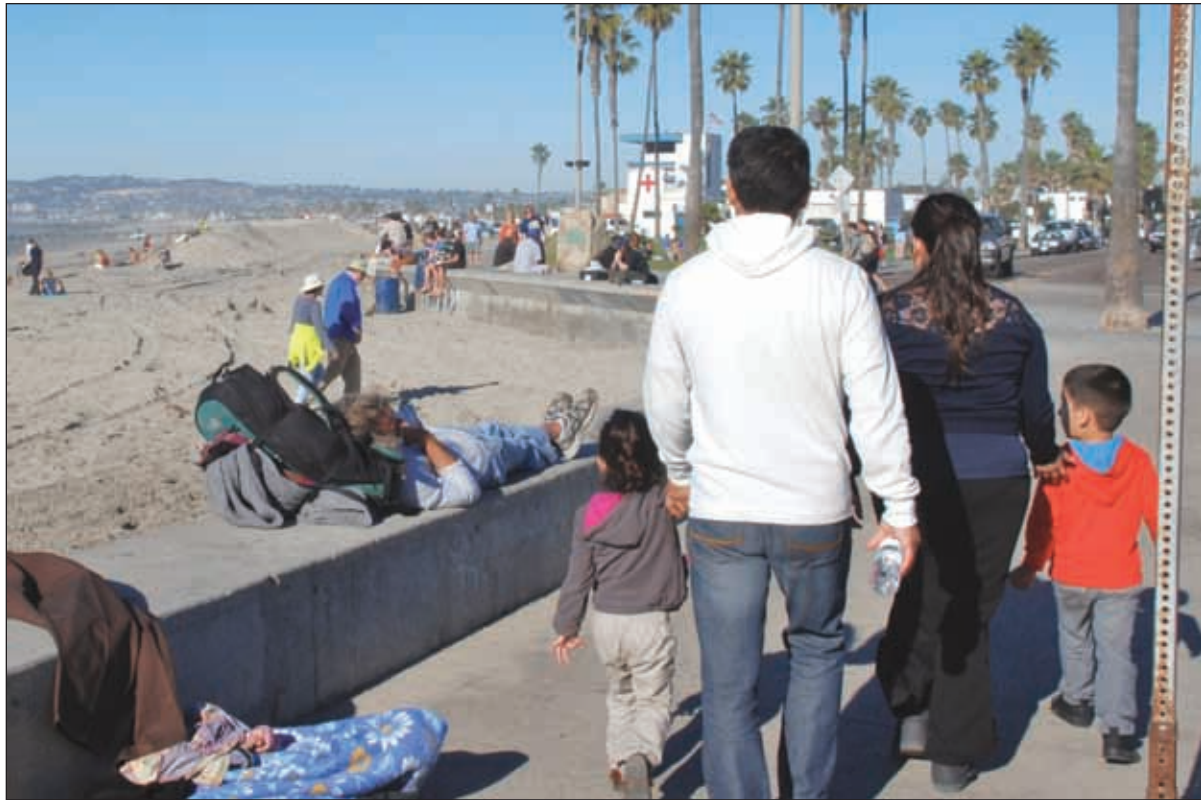
Some locals express a real concern for their families in the face of unruly and aggressive behavior by young panhandlers and transients.