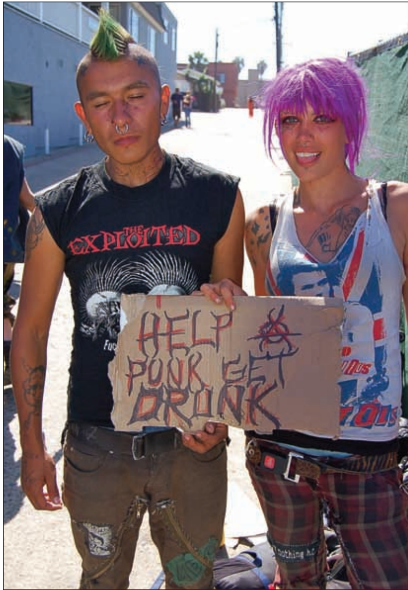
With the "live and let live" philosophy of Ocean Beach, some panhandlers are anything but shy about what they want and how to go about getting it.