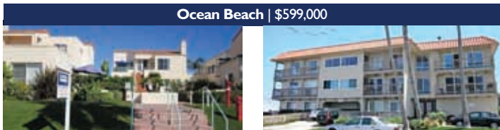
Ocean Beach | $599,000

1st Agent to Work in Point Loma 619.300.5026 NumanI@cox.net