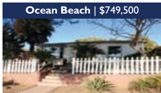
Ocean Beach | $749,500