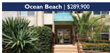
Ocean Beach | $289,900

2 br, 2.5 ba townhome features cherry flrs, upgraded kit with travertine, tile & white appliances, updated ba's, custom baseboard, dining room w/French doors to large patio & upgraded plumbing.