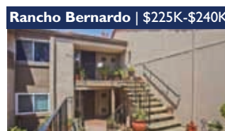
Rancho Bernardo | $225K-$240K

BRAND NEW North Clairemont home in highly sought after San Clemente View neighborhood just adjacent to Park Rim. All 4 br's & 2.5 ba's downstairs, HUGE bonus room upstairs w/full bath. 360 degree City & Canyon VIEWS & HUGE Balcony!