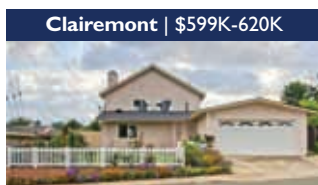
Clairemont | $599K-620K

First time on the market! Stunning home! Living rm has dramatic 25 foot ceilings w/loads of light. Formal dining rm w/ hardwood flrs & French doors to private lush backyard w/build in pool. Gourmet kitchen w/cooktop island & breakfast bar. 4 br, 3.5 ba. Master suite w/ bay views & more!