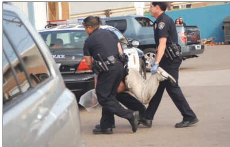
Police say crime statistics associated with some of the young, aggressive transients along the beachfront are often difficult to quantify because of the changing makeup of the group.