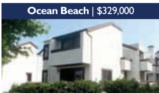
Ocean Beach | $329,000

Just Listed! 2 detached properties in upper OB! Front home is 2 br, 1 ba with separate dining rm & hardwood flrs. Grass front yard with fenced backyard & covered patio area. Rear unit is 2 br, 1 ba with extra enclosed patio room. Rear unit has fenced yard & is built on top of 4-car garage.