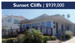
Sunset Cliffs | $939,000

Upgraded townhome. 2 br, 2.5 ba. Kitchen w/ new cabinets & appliances & totally new baths. Tiled floors & wood burning flplc. Master bathroom w/ new tile shower enclosure & floors, new custom cabinets, 2 sinks & designer countertops.