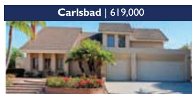
Carlsbad | 619,000

1 br, 1 ba. Bright updated top floor unit with peak ocean views. Newer vinyl windows, remodeled kitchen & bath. Laundry in unit. Complex has pool. Fantastic location!