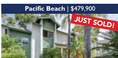
Pacific Beach | $479,900

Coming Soon! 3 bedroom, 2 bath Townhome just 2 1/2 blocks from the beach! 2-car attached garage. Low HOA.