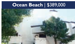
Ocean Beach | $389,000

Sea Colony! Plan 3. 2 br, 1.5 ba end-unit townhome with direct entry attached 2-car garage. Just painted, newer carpet. Unit wired for sound system in living room and master br. Faces west, 2 decks.