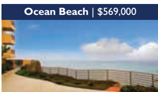
Ocean Beach | $569,000

Originally a 4 bedroom. Seller removed the wall between the two smaller bedrooms, each still have a closet and door, easily converted back to a 4 bedroom if needed. Updated kitchen, family room with a newer patio doors leading to 1 of three private outside areas.