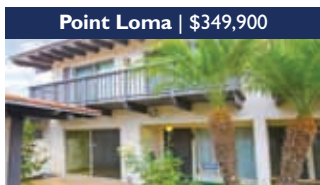
Point Loma | $349,900