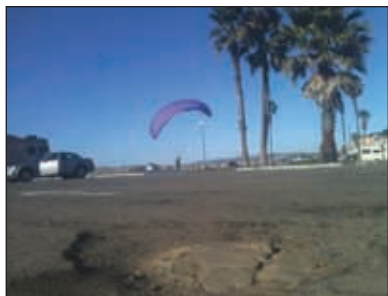
Some locals blame personal injuries and vehicle damage on the pitted public parking lot on Abbott Street.