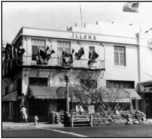
Iller's Department store on the corner of Girard Avenue and Wall Street is pictured in 1943. The store has sand bags and camouflage netting to remind La Jollans to buy war bonds.