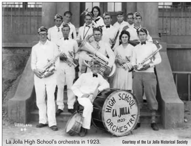
La Jolla High School's orchestra in 1923.