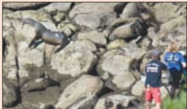
A juvenile sea lion runs back to the water on March 9 after being disentangled from fishing gear.