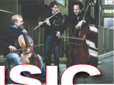
Project Trio plays at the Neurosciences Institute on March 28.

For a full list of venues' addresses and contact information, visit www.sdnews.com