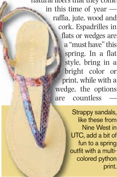
Strappy sandals, like these from Nine West in UTC, add a bit of fun to a spring outfit with a multi-colored python print.

Since shoes are a vice for most women, let's start there. I love all the natural fibers that they come in this time of year — raffia, jute, wood and cork. Espadrilles in flats or wedges are a "must have" this spring. In a flat style, bring in a bright color or print, while with a wedge, the options are countless —