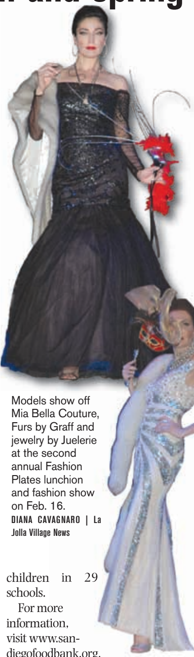
Models show off Mia Bella Couture, Furs by Graff and jewelry by Juellerie at the second annual Fashion Plates luncheon and fashion show on Feb. 16.

Proceeds went to the Food 4 Kids Backpack Program, which targets hungry children in San Diego County public schools. They currently serve 1,125