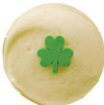
Sprinkles' Irish chocolate cupcake, just the treat for St. Patty's Day.

live music by Harvey's Heroes starting at 9 p.m.