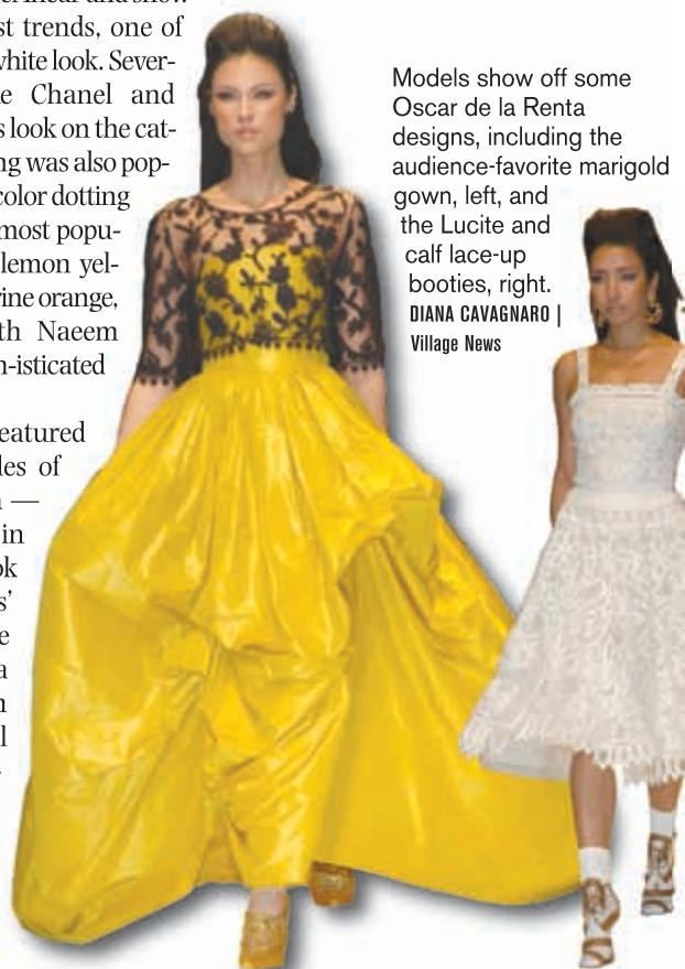
Models show off some Oscar de la Renta designs, including the audience-favorite marigold gown, left, and the Lucite and calf lace-up booties, right.

The event benefited Promises2Kids, founders of the Child Abuse Prevention Foundation, an organization that protects abused and neglected children by trying to break the cycle of child abuse. For more information, visit www.promises2kids.org .