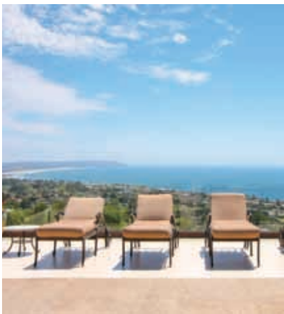
821 Havenhurst • Sold Offered at $3,000,000 - $3,400,876