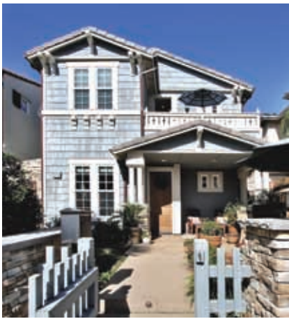
376 Bonair • Sold Offered at $1,400,000 - $1,600,876