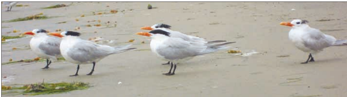
Tern style is facing the ocean, always a prudent pose when poised where land meets the unruly sea. The combined physical attributes and determined stance somehow make the terns look like they are fighting a headwind, though in reality they are comfortably stationary.

of these fish species are one reason the status of royal terns has been poorly understood throughout the 20th century. We are only beginning to document changes in behavior of seabirds and correlate them with their prey (in terms of numbers and distribution fish). The point is to understand how the changes relate to fishing pressures on these important prey and global climate change. Since seabirds that nest with success can expect to be widely distributed across their range, decreases in their numbers or change in their expected range provide quick and visible proof. Though the royal tern is no