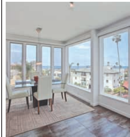
245 Prospect • Sold Offered at $1,200,000 - $1,400,876