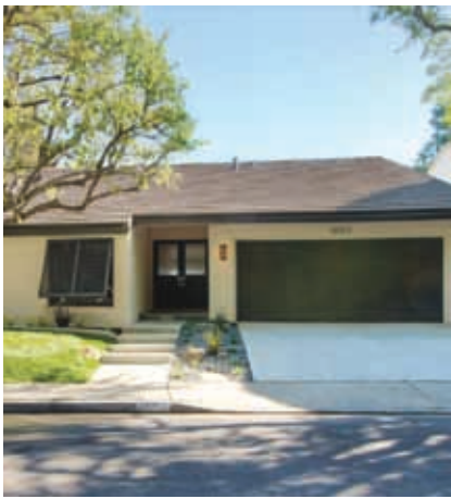
1883 Caminito Marzella • Sold Offered at $1,095,000