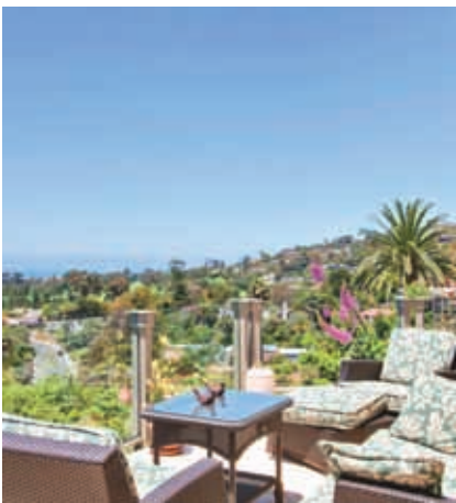
6444 El Camino del Teatro • Sold Offered at $3,625,000