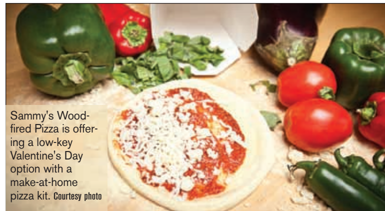
Sammy's Wood-fired Pizza is offering a low-key Valentine's Day option with a make-at-home pizza kit.