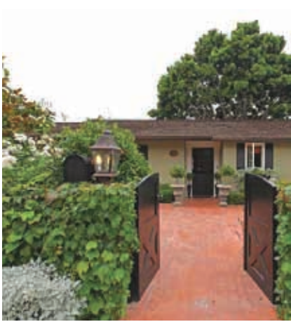
5944 Waverly • Sold Offered at $2,000,000 - $2,200,876