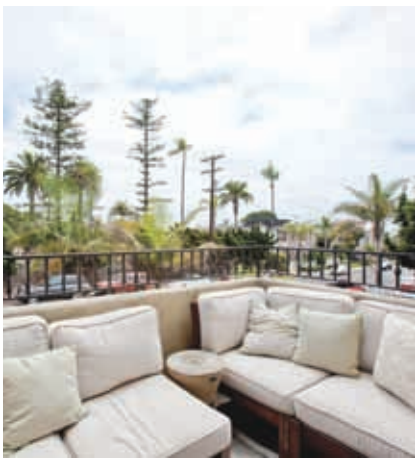
642 Westbourne • Sold Offered at $1,100,000 - $1,300,876