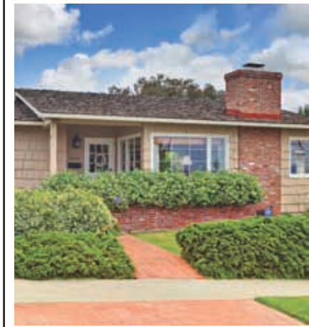
6570 Avenida Mirola • Sold Offered at $1,300,000 - $1,500,876