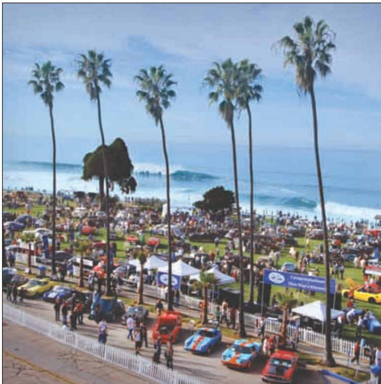
Classic cars line the shore at the La Jolla Cove for the 2010 La Jolla Motorcar Classic. This year's event will take place April 3 from 9 a.m. to 3 p.m.

The La Jolla car show will feature more than 150 automobiles in 30 specialty car classes, with the featured marque being the German automobile. In addition to awards in specialty car classes, this juried show will also recognize winners in the following categories: a winner's circle award (comprised of prior best of show and best in class winners), director's choice, people's choice, best in show, best in restoration and excellence in design. Mercedes Benz sedans,