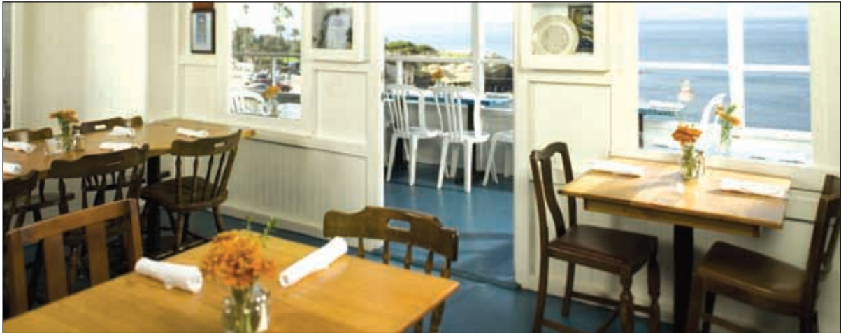
You can hear the La Jolla Cove seals from Brockton Villa's seafront veranda.