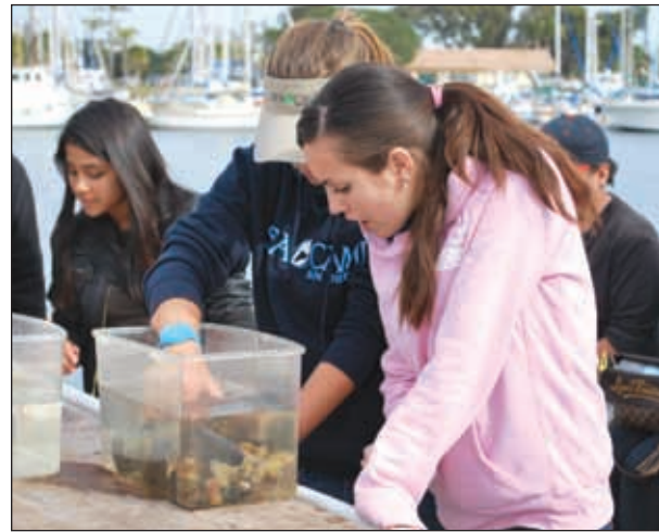
A partnership between Mission Bay High School and the Scripps Institution of Oceanography allows students to engage in hands-on study aboard the research vessel Melville.