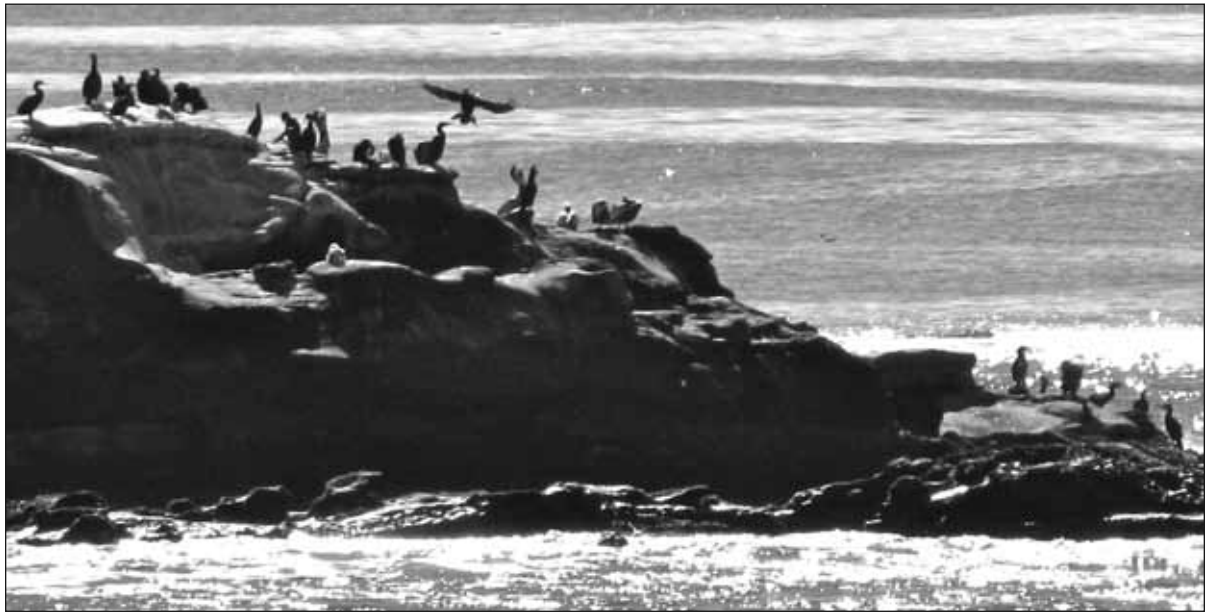
Birds perch on the iconic Bird Rock, which collapsed in December. Despite the fact that their roost has been downsized, the birds are still coming back to Bird Rock.