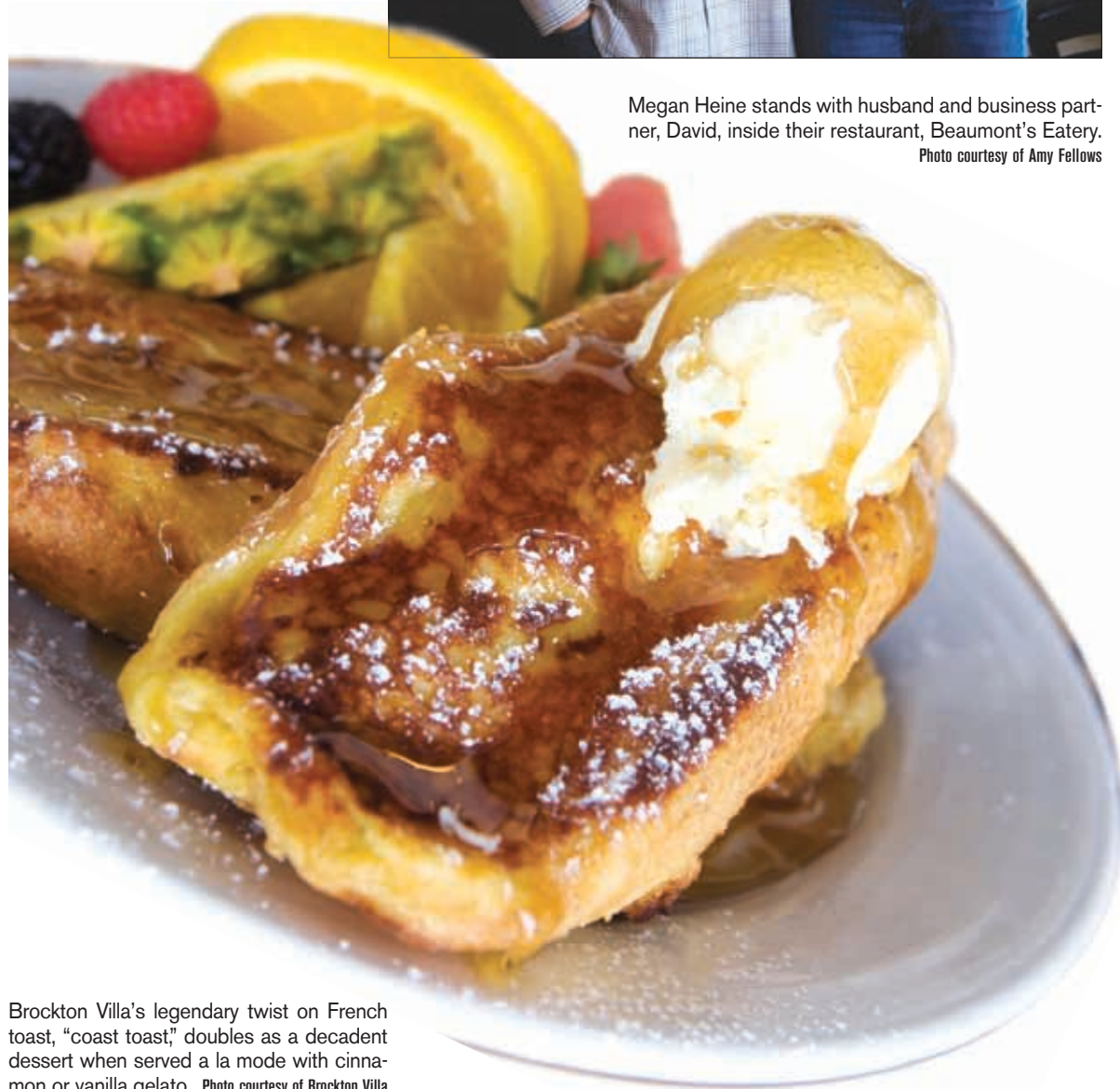
Brockton Villa's legendary twist on French toast, "coast toast," doubles as a decadent dessert when served a la mode with cinnamon or vanilla gelato.

At the Beach 809 Thomas Ave Pacific Beach, CA (858) 270-1730