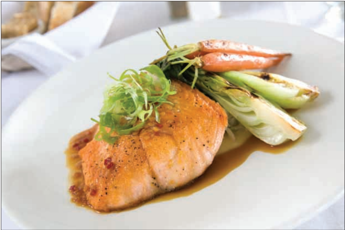
Brockton Villa is known for its remarkable seafood, like this ginger-chili-glazed natural salmon with coconut cilantro rice, baby bok choy and citrus butter emulsion.