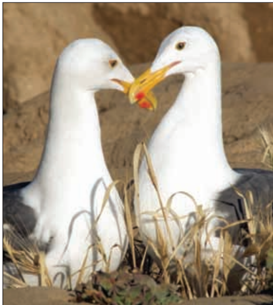
A pair of Western Gulls court and bond on the bluffs near the Cave Store. The two gently tapped their bills together, making a soft clicking sound.