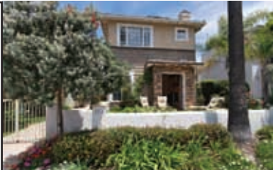
Sold Bonair Street