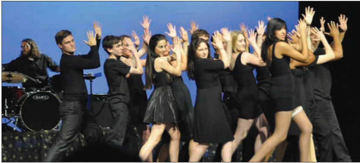
La Jolla Country Day School's (LJCDS) cast of "The World Goes 'Round" opened the Rotary Club of La Jolla's "Stars In Our Eyes 2011" at La Jolla High School's Parker Auditorium on Jan. 28. Its rendition of Kander and Ebb's "All That Jazz" (from "Chicago") will be featured in three full-length performances of "The World Goes 'Round," to which the community is invited.