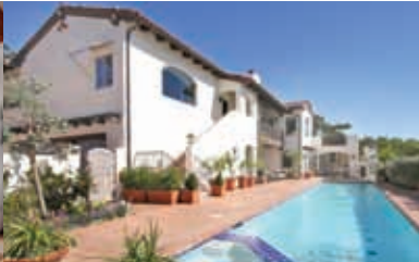
Sold Carrizo Drive