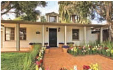
Sold Fern Glen

Open Saturday & Sunday 1-4 pm • 376 Bonair Street