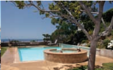
Sold Nautilus Street