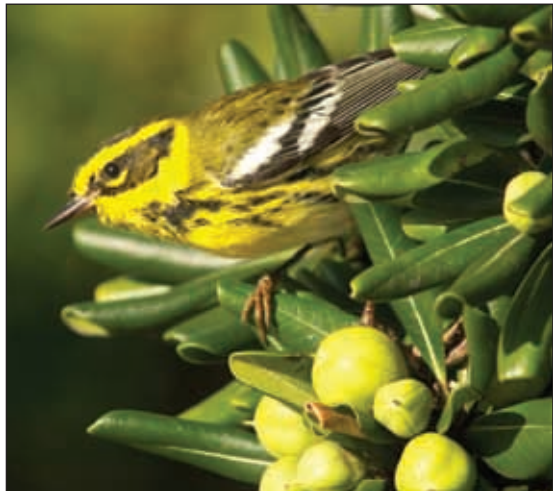
La Jolla offers more than sea birds and shore birds for the observant nature watcher. This gorgeous Townsend's warbler was photographed foraging in bushes above the Children's Pool.