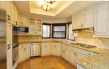
Sold Eads Avenue