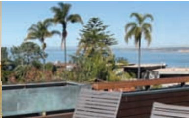
Sold Prospect Place