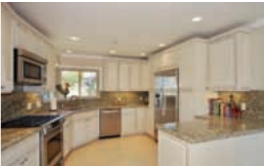
Sold Ricardo Place