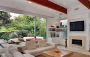
Sold Bonair Place