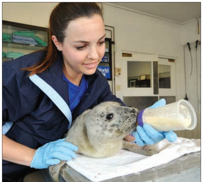
A SeaWorld staff member bottle feeds a male seal pup, estimated to be less than a week old.

If you think a marine mammal is in serious danger, call the stranded animal hotline at (800) 541-7325.