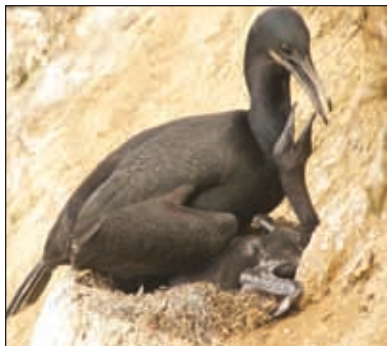
Left: Double-crested cormorants, like this one at Shell Beach, are fairly drab most of the year. But when breeding season starts, striking plumes and facial coloration appear. Right: A Brandt's cormorant cares for its chick at the La Jolla Cove. The parents share duties, taking turns attending the nest and fishing.