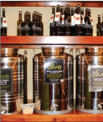
Left: Self-serve vats of delicacies like meyer lemon and garlic olive oils and aged balsamic vinegar line the wall of We Olive, La Jolla's new olive oil tasting bar. Right: Guests of We Olive's Feb. 17 opening event smell oils before tasting.

For olive oil-inspired recipe ideas, from shortening-free cookies to roasted turkey to tomatillo salsa, visit www.weolive.com/blogs .