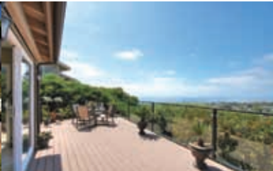
Sold Manana Place