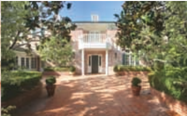
Sold LJ Scenic Drive South