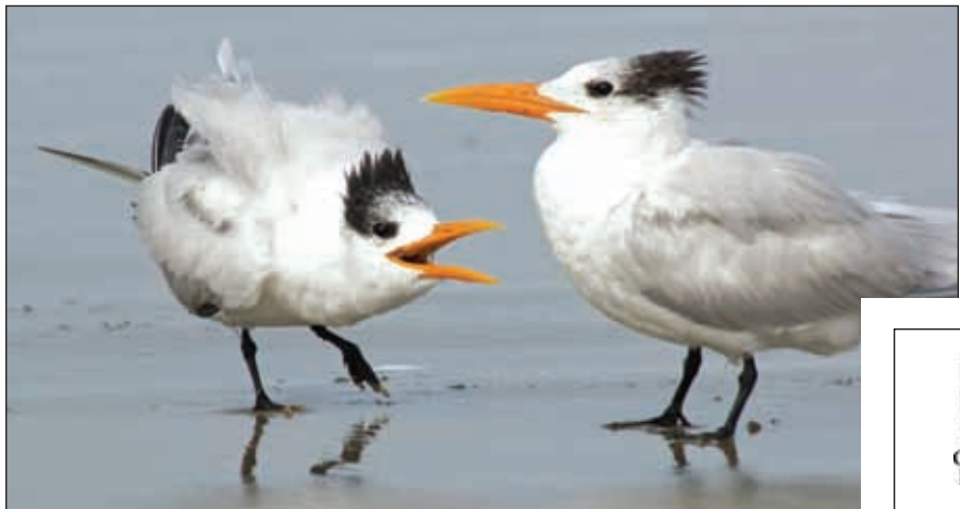
Royal terns display on the beach at La Jolla Shores.

The festival's non-refundable registration fee is $20 per person (free for children 12 and under). Events prices vary, with some being free. Registration information and a schedule can be found at www.sandiegoaudubon.org/birdfest.htm or by calling (858) 273-7800.