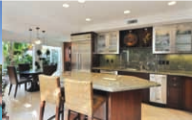
Sold Fern Glen