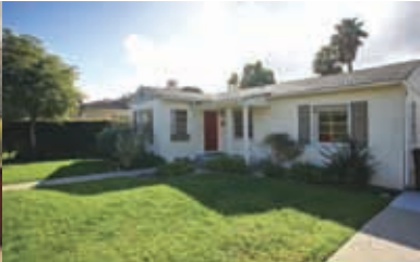
Sold Waverly Avenue