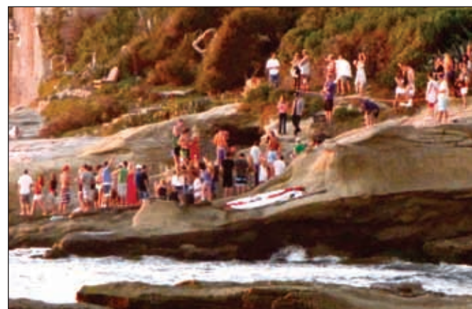
Standing at the end of Bird Rock Avenue looking north on Feb. 12, local photographer Sharon Hinckley caught a glimpse of a delightful summer-like scene – well over 60 people gathered on the coast with music playing and having a good time.