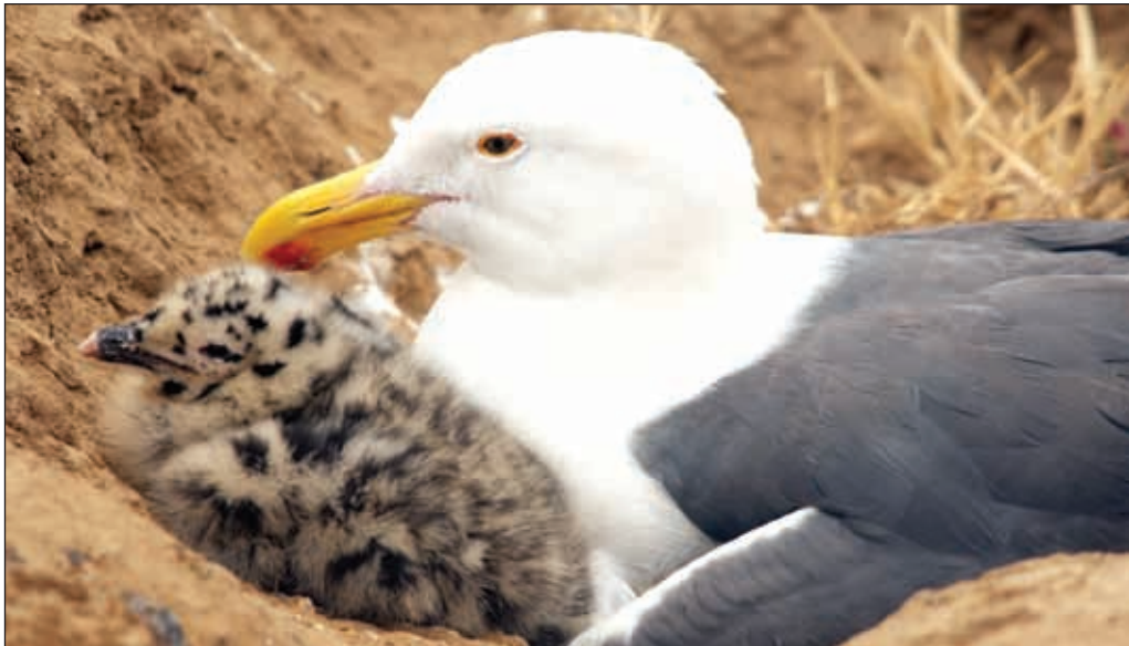
A western gull cares for its chick on the bluffs near the Cave Store. Chicks lose their spotted markings as they mature.