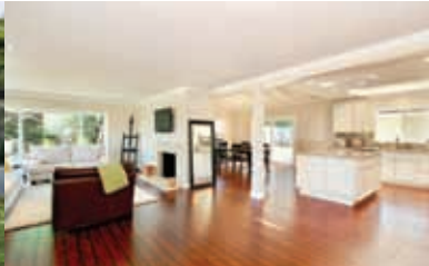
Sold Avenida Manana