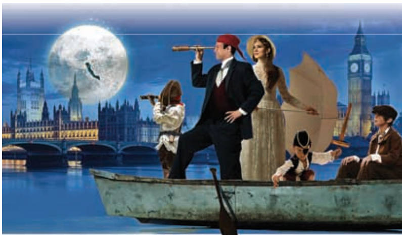
The La Jolla Playhouse, in its world premiere of "Finding Neverland," will use this poster art.

Subscriptions to La Jolla Playhouse's 2011/12 season are available by calling (858) 550-1010 or by visiting lajollaplayhouse.org .