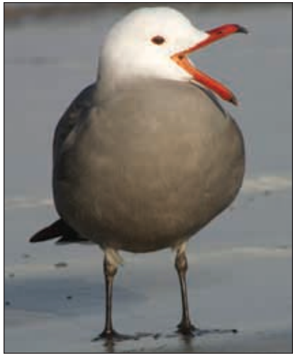
Herrmanns, like this one at La Jolla Shores, have a cherry-red bill and eye ring, a snow-white head and charcoal-gray body. They are rare, and very sought after at the San Diego Bird Festival.