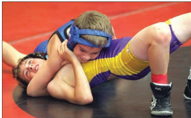
Wrestling clubs from San Diego county and Imperial County with members as young as 4 years old compete in a meet last month at La Jolla High (above and below).