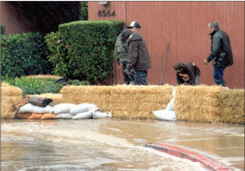
Homeowners stack hay bales and sand bags in an attempt to prevent home flooding along El Paseo Grande on Jan. 21. Rushing water eroded the area around the boat launch at La Jolla Shores, forcing its closure.

Teachworth is unsure why people are willing to donate online to schools they may have no connection with, but he welcomes the generosity. Teachworth hasn't had any takers yet for the Bunsen burners, but the word's out. ■