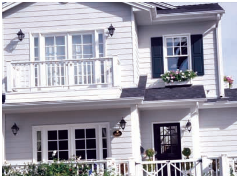
This Bird Rock home was part of last year's Home Tour. This year's event on Jan. 30 will raise money for Bird Rock Elementary School.