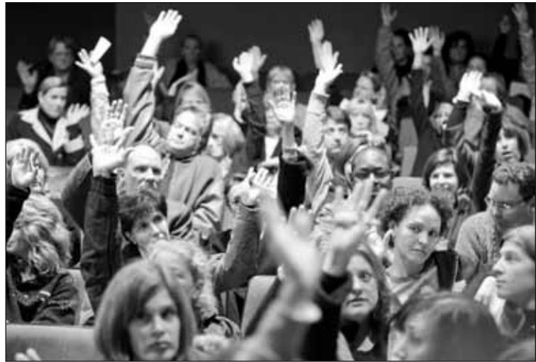
Raised hands indicate support for a La Jolla schools cluster at a Jan. 21 meeting exploring the idea.

Forming a cluster would also foster better communication between schools, the group of parents said. The cluster could help establish curriculum priorities across the schools, and perhaps coordinate fund-raising. For example, the cluster could help ensure each elementary school pro-