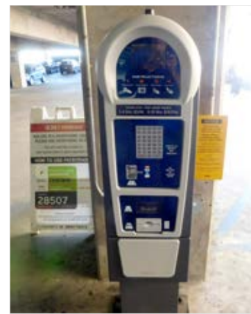
A new electronic parking kiosk at SDSU