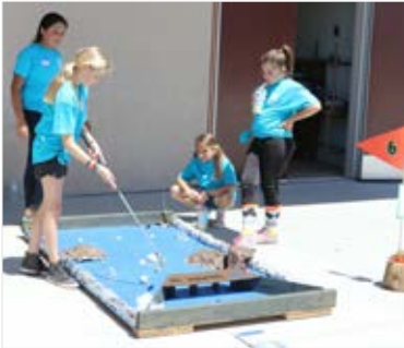
An all-girls team checking out their creative mini golf hole when the theme of the third Mini Golf Challenge was "Water."