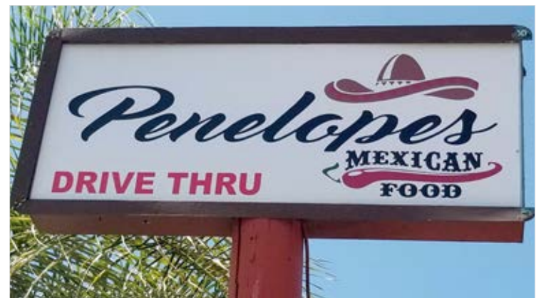
The Penelope's sign

The menu has all the standard favorites: burritos, tacos, carnitas, tortas and bowls. Try any of these with shrimp. Menudo lovers can enjoy the Penelope's version on the weekends or try their unique fries. They have adobada, carne asada, surf and turf, birria, chorizo. They are the only restaurant in San Diego making a breakfast of chorizo, eggs and cheese fries.