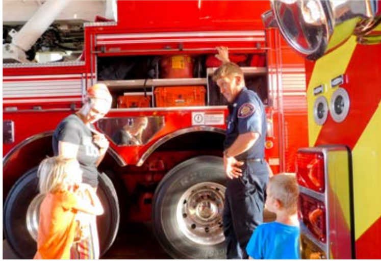
The open house at Fire Station 10 was a chance for residents to learn about fire safety and meet their local fire fighters.

The Oct. 8 open house at San Diego Fire Department Station 10 drew a pretty good crowd from the El Cerrito area, and it wasn't just to eat the free hot dogs and collect pictures of children climbing on fire trucks.