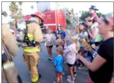
Station 10 hosts open house event for community. Page 2