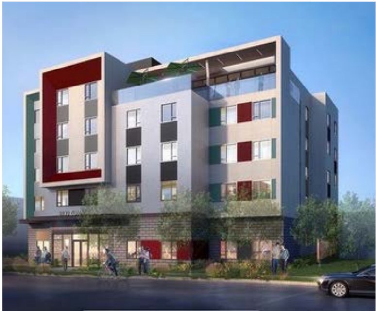
SEE ZUMA WEST, Page 3 Conceptual drawing of the proposed Zuma West project (Courtesy Zuma West, LLC)

Zuma West, a development by Keith Henderson of Zuma West, LLC, incorporates two off-site, affordable homes as well. Zuma West is anticipated to replace 11 existing apartments currently located at 6139-6147 Montezuma Road, while the