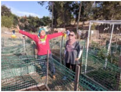
Community garden volunteers