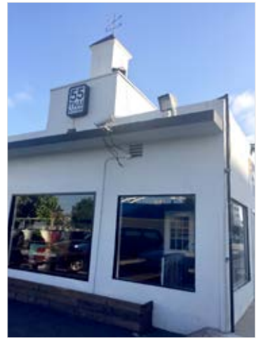
Authentic Thai food on College Avenue

All menu items are served in sturdy cardboard bowls or boxes. The eating utensils are plastic.