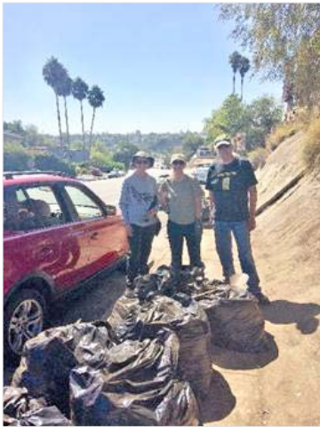
Beautification Committee members at the neighborhood clean-up on Sept. 21