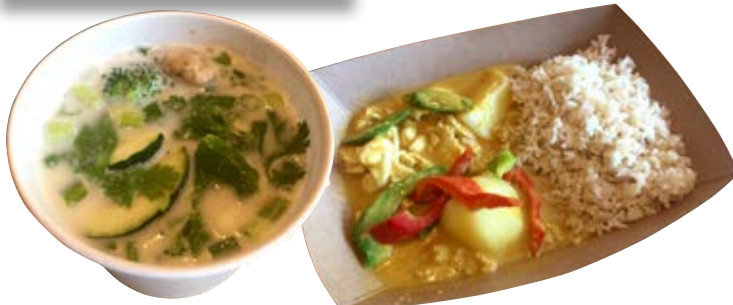
(l-r) Tom kha soup; Yellow curry with chicken

Prices: Appetizers, 85 cents to $5; soups and salads, $3.75 to $9; noodles and rice dishes, $8.50 to $9.50; curries and house specialties, $8.50 to $9.50