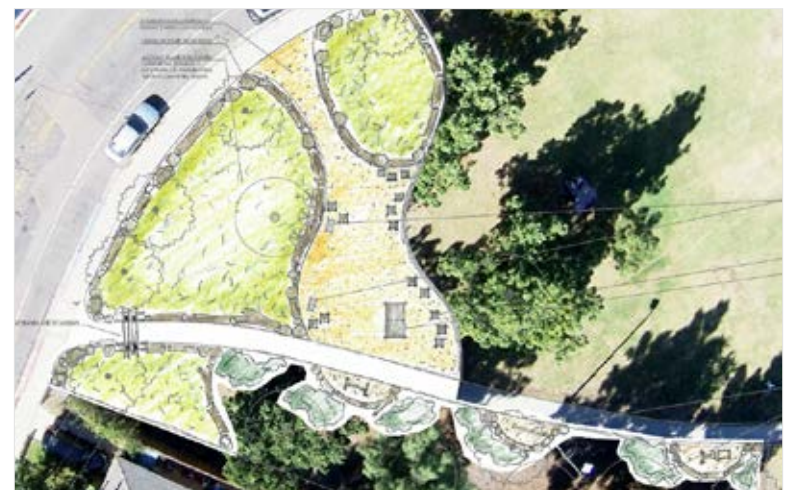
Artist rendering of the Clay Park improvements currently under construction. (Courtesy Rolando Community Council)