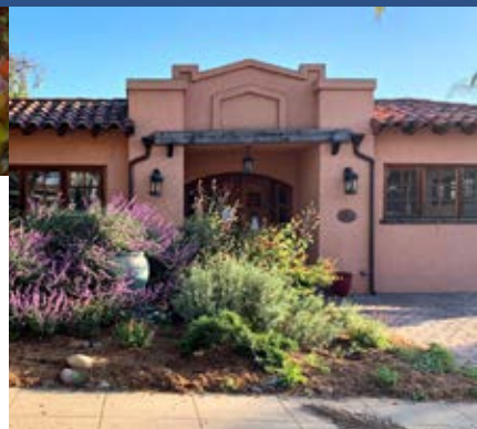
5473 Adams Ave. SOLD: $850,000