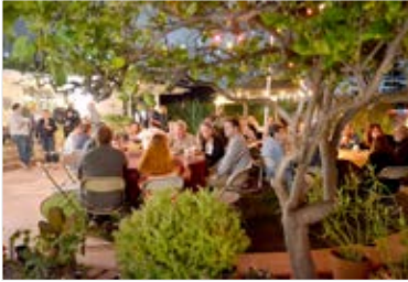
The Progressive Dinner was well attended.