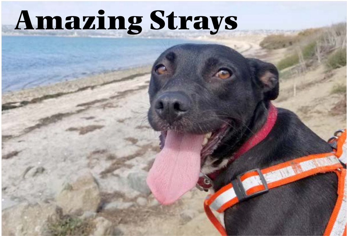
Catrina is a dog currently fostered by an Amazing Strays volunteer that is looking for her forever home.