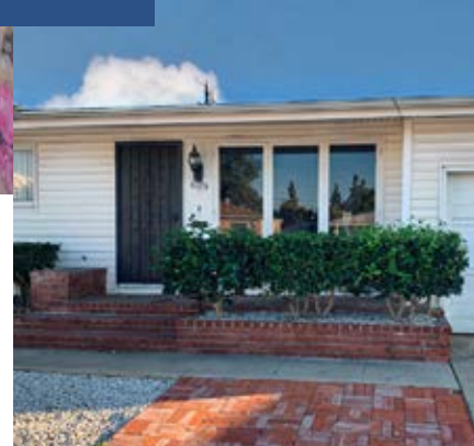
6175 Mary Lane Dr. SOLD: $710,000