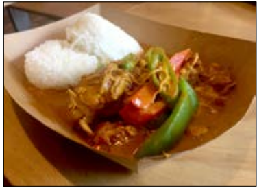
Experience real massaman curry at 55 Thai. Page 10