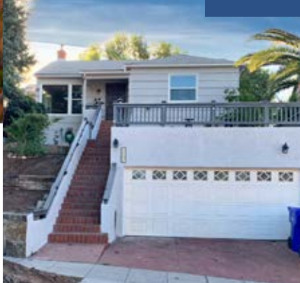
4636 Rolando Blvd. SOLD: $607,000